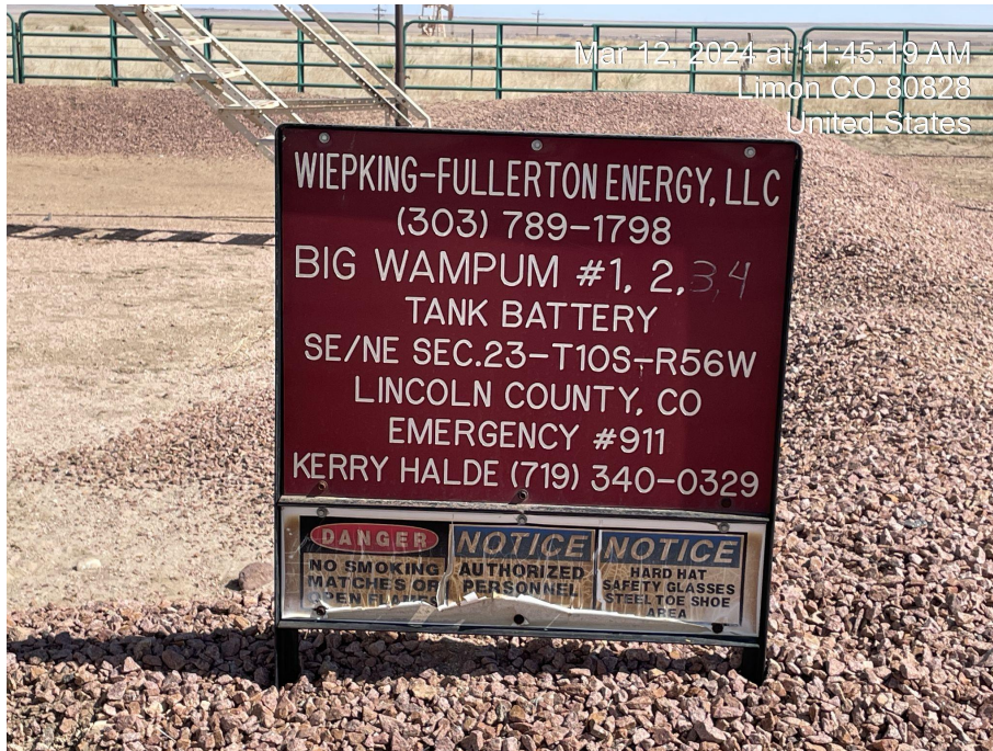
Photo 11. Photo taken facing east of tank battery sign