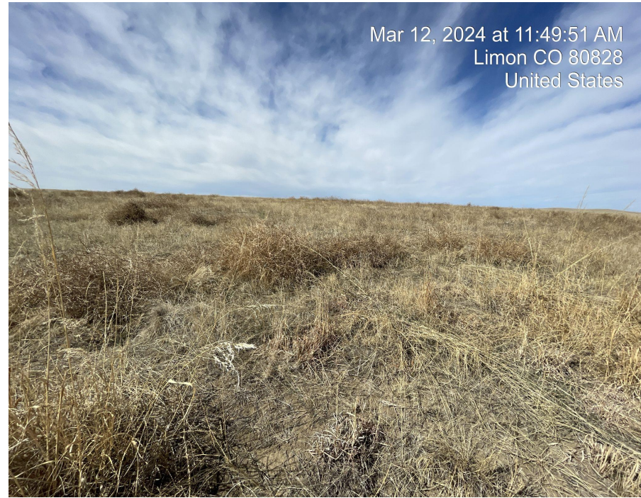
Photo 6. Photo taken facing northeast of vegetation in the interim reclamation area.