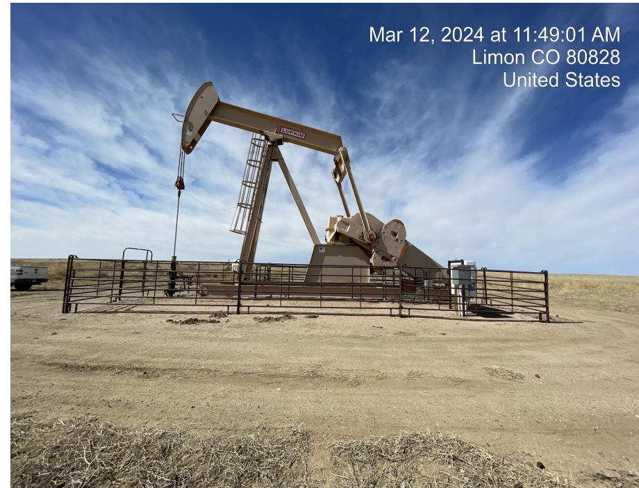
Photo 2. Photo taken facing east of wellhead.