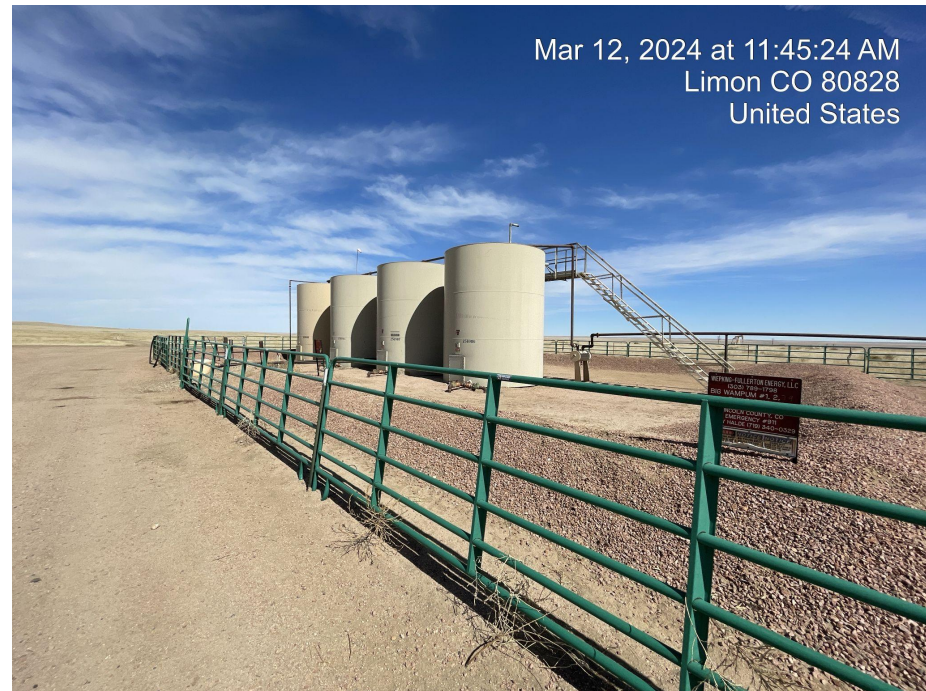
Photo 12. Photo taken facing east of tank battery.