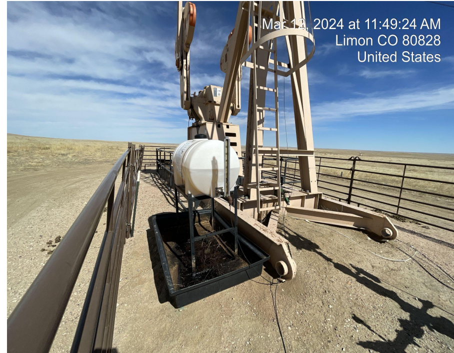
Photo 4. Photo taken facing east of secondary containment without wildlife protection.