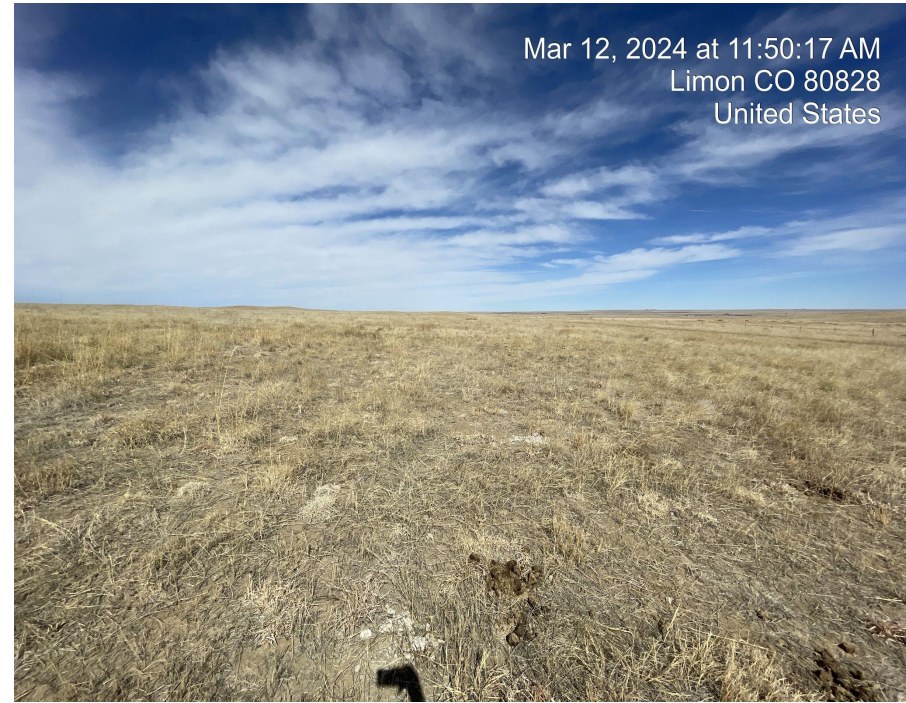
Photo 8. Photo taken facing west of vegetation in the interim reclamation area.