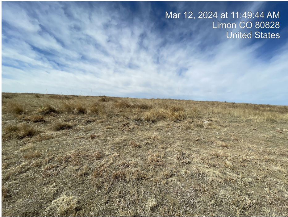
Photo 5. Photo taken facing southeast of vegetation in the interim reclamation area.