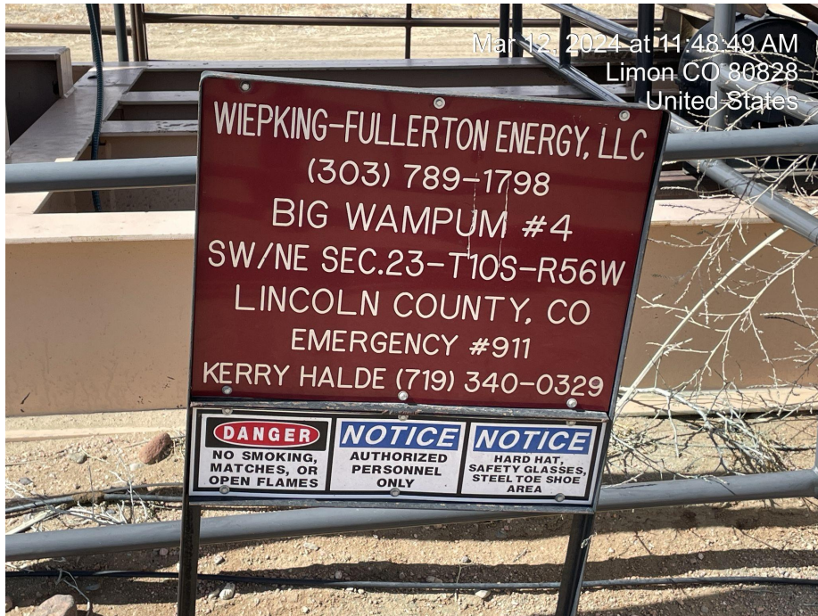
Photo 1. Photo taken of location sign.