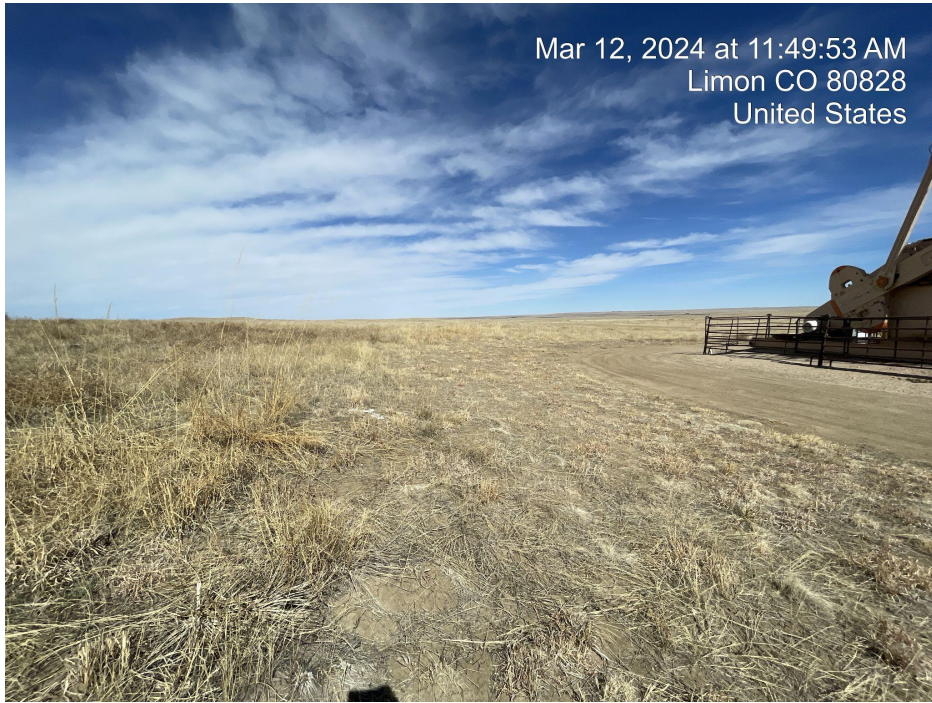
Photo 7. Photo taken facing northwest of vegetation in the interim reclamation area.