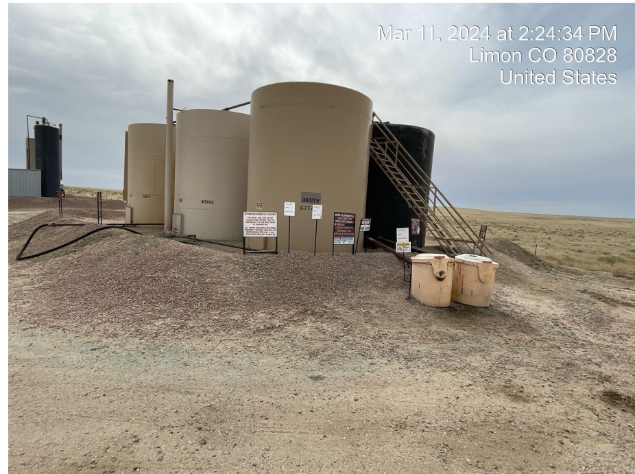
Photo 12. Photo taken facing east of tank battery.