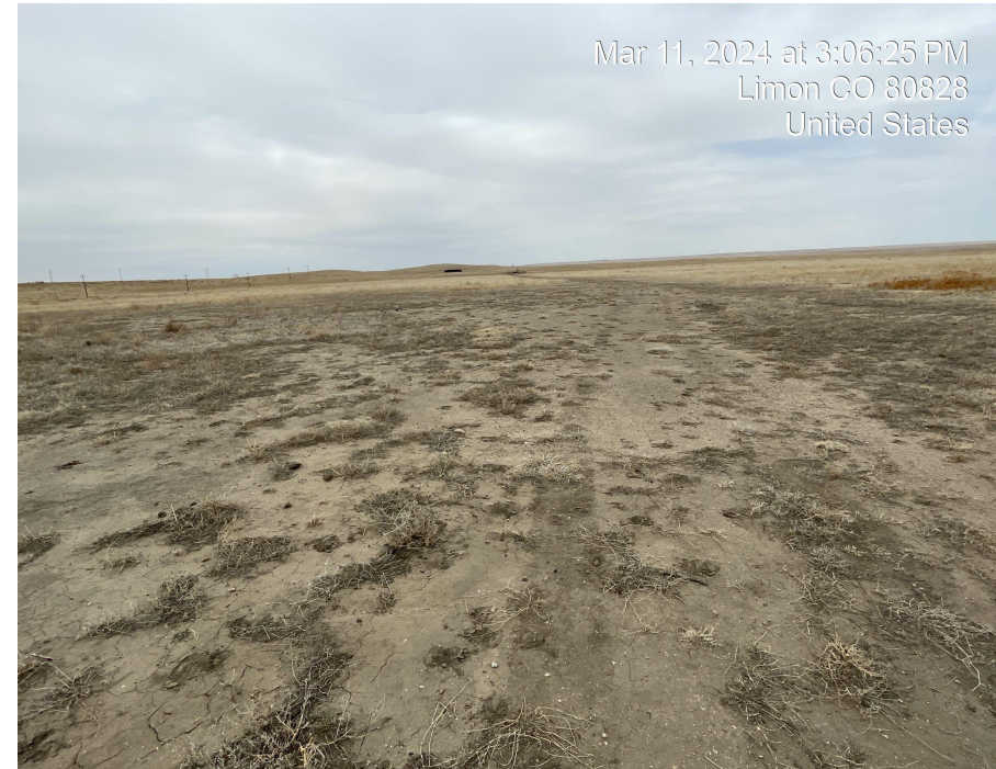
Photo 8. Photo taken facing northwest of bare soil and vegetation in the interim reclamation area.