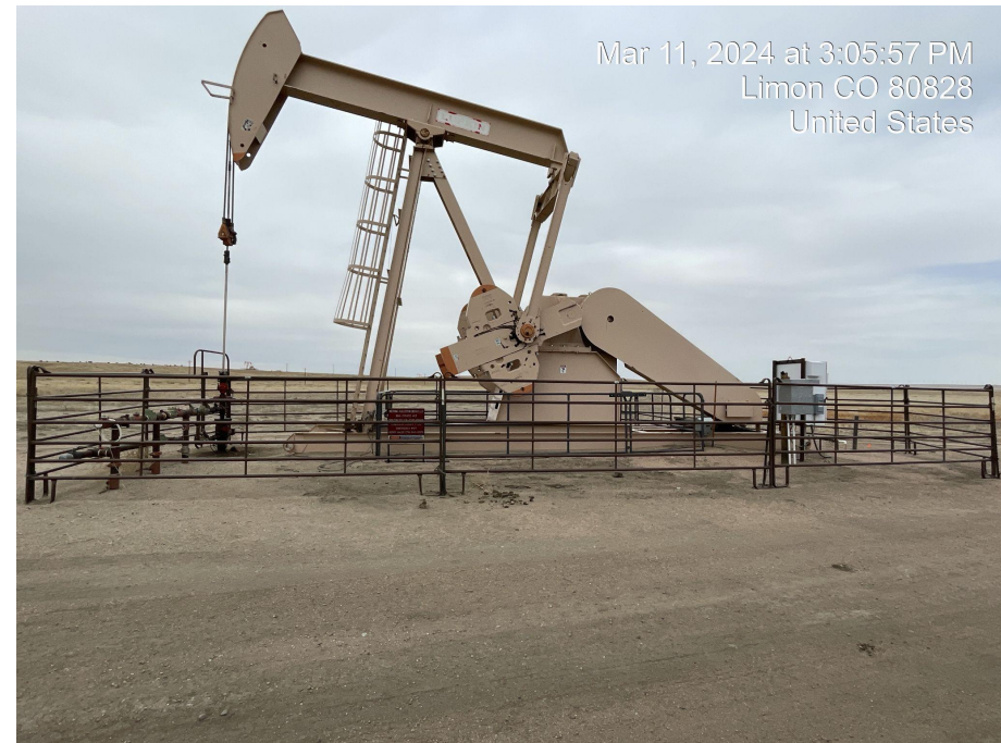
Photo 2. Photo taken facing east of wellhead.