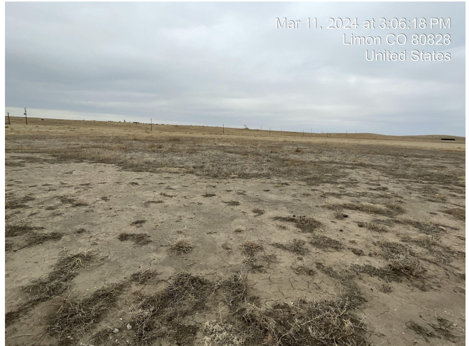
Photo 4. Photo taken facing east of bare soil and vegetation in the interim reclamation area.