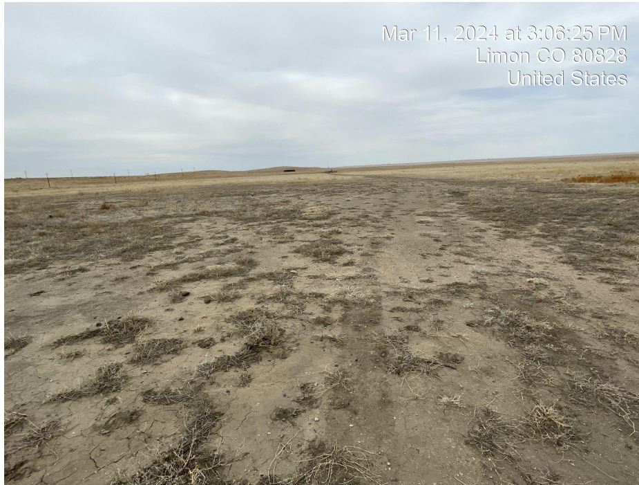
Photo 7. Photo taken facing north of bare soil and vegetation in the interim reclamation area.