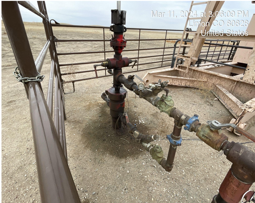
Photo 3. Photo taken facing northeast of stained soil around wellhead.