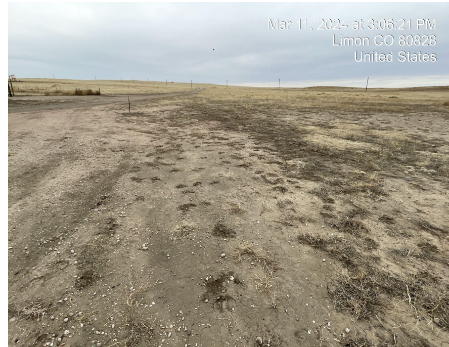
Photo 6. Photo taken facing southwest of bare soil and vegetation in the interim reclamation area.