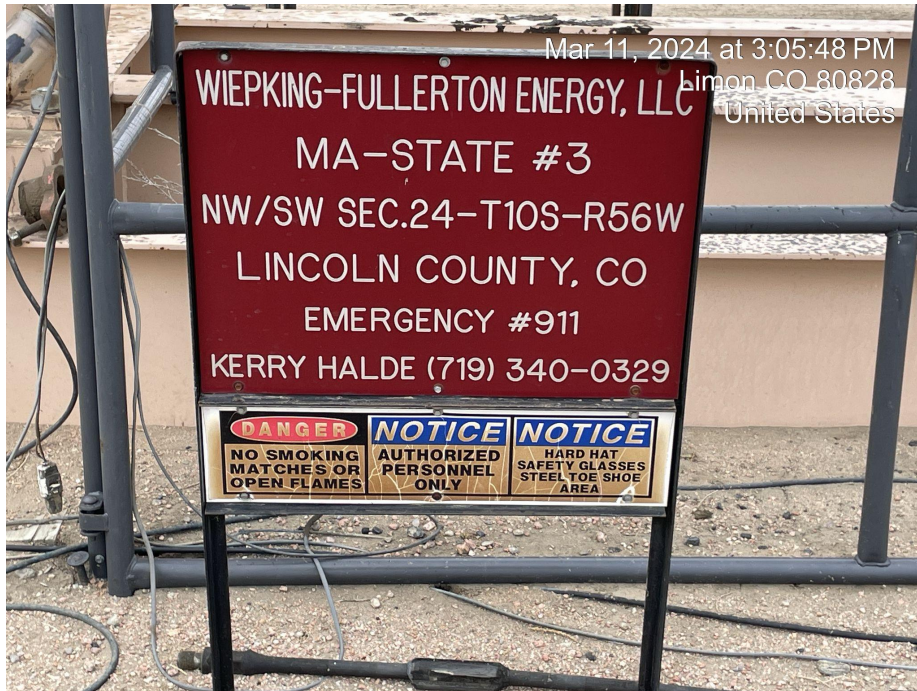
Photo 1. Photo taken of location sign.