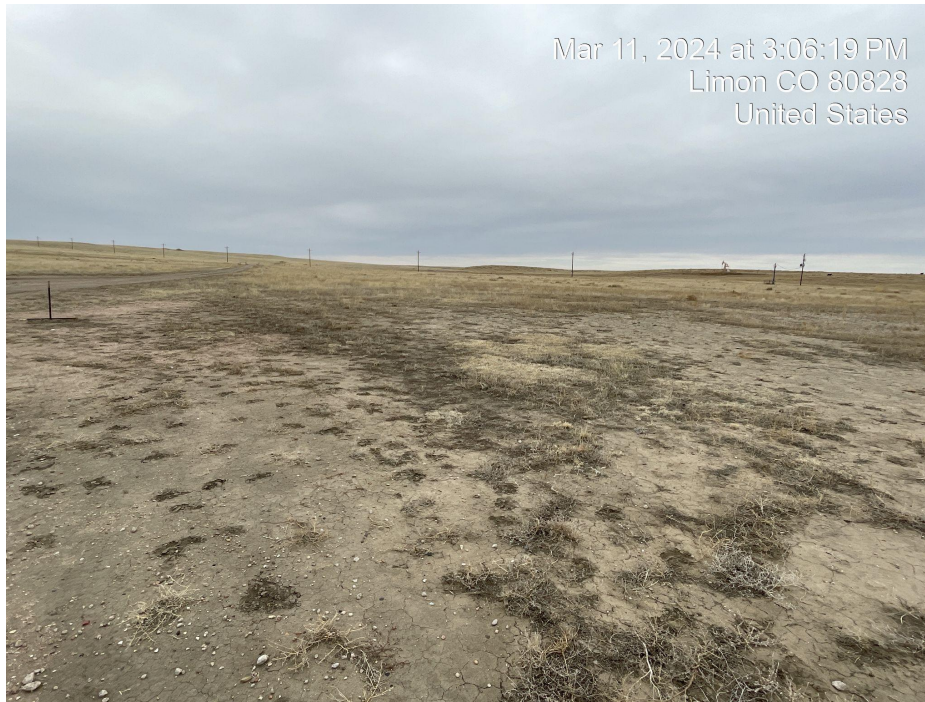
Photo 5. Photo taken facing south of bare soil and vegetation in the interim reclamation area.