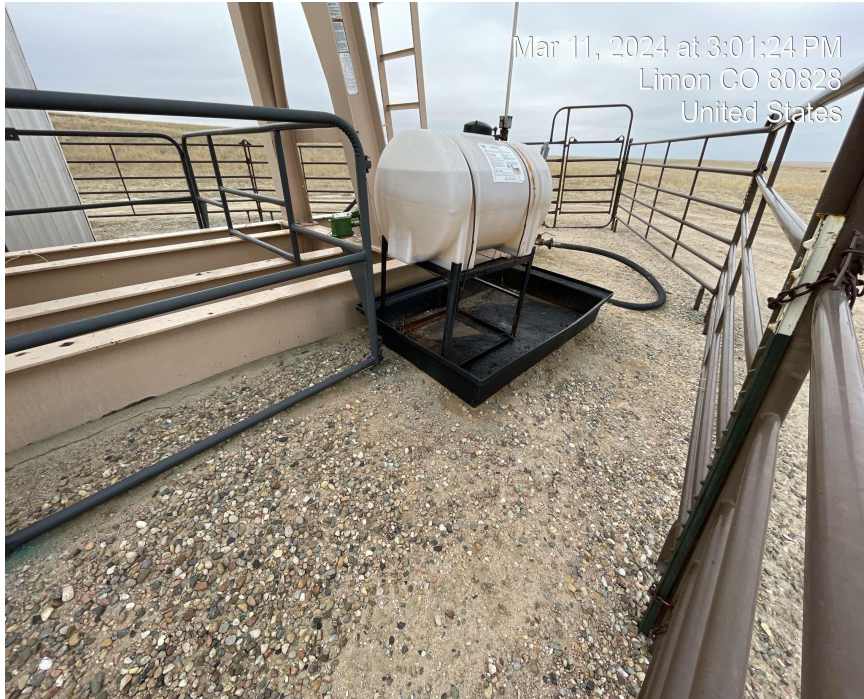
Photo 3. Photo taken facing northeast of no wildlife protection on secondary containment.