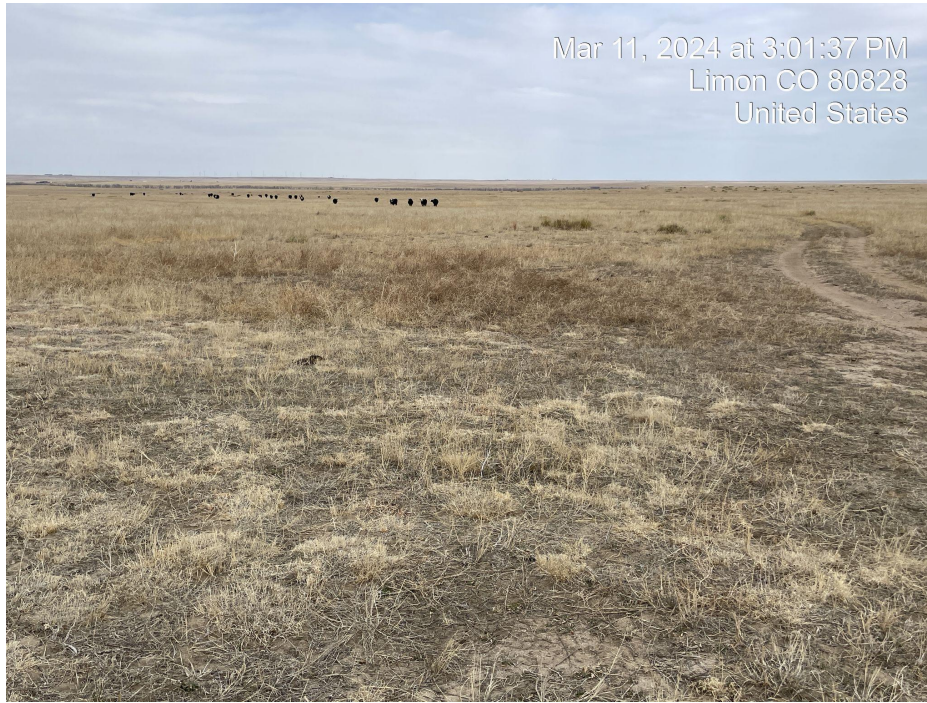
Photo 5. Photo taken facing south of vegetation in the interim reclamation area.