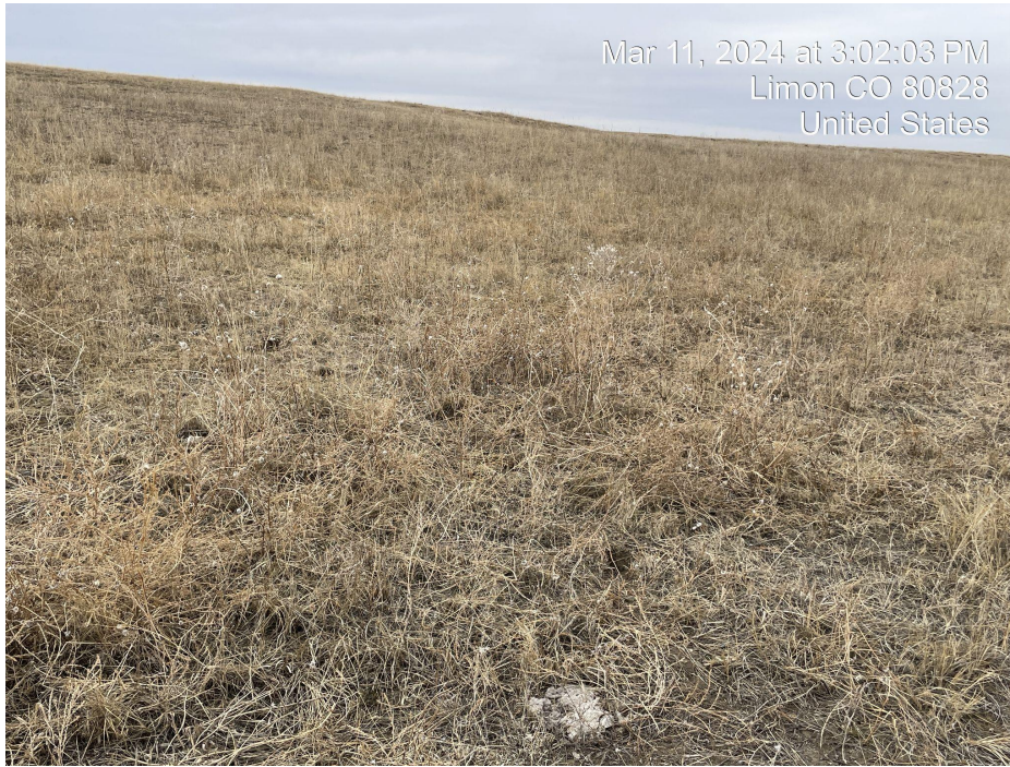
Photo 7. Photo taken facing north of vegetation in the interim reclamation area.