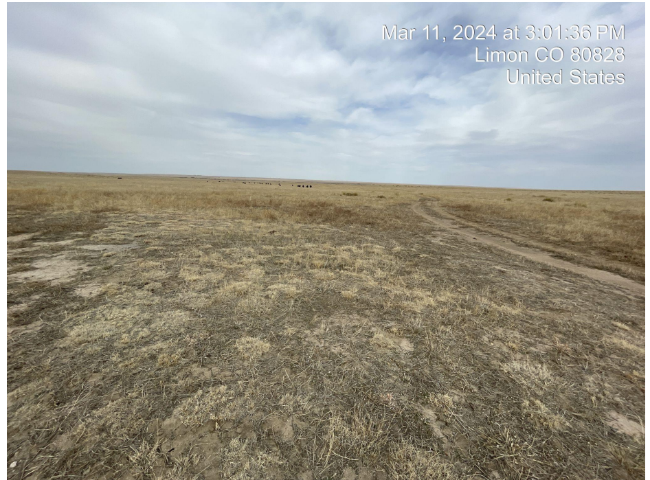
Photo 4. Photo taken facing east of vegetation in the interim reclamation area.