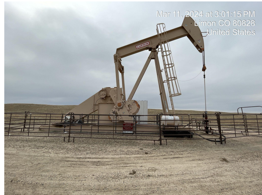
Photo 2. Photo taken facing east of wellhead.