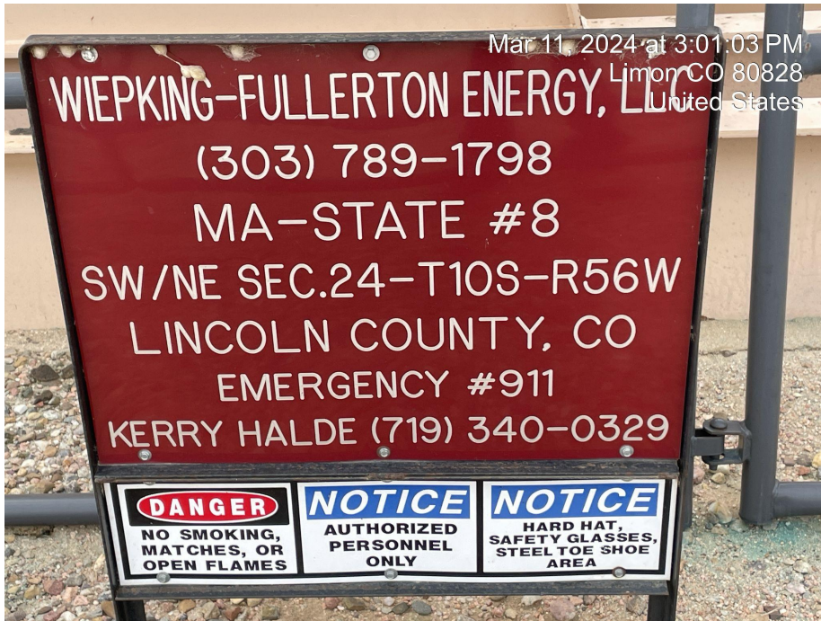
Photo 1. Photo taken of location sign.