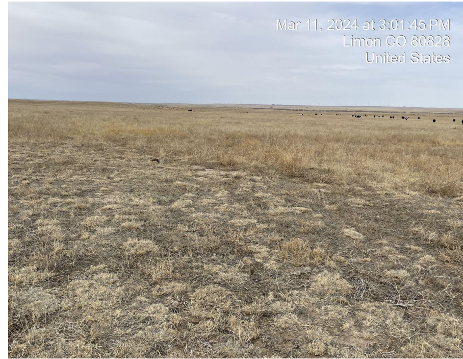
Photo 6. Photo taken facing southwest of vegetation in the interim reclamation area.