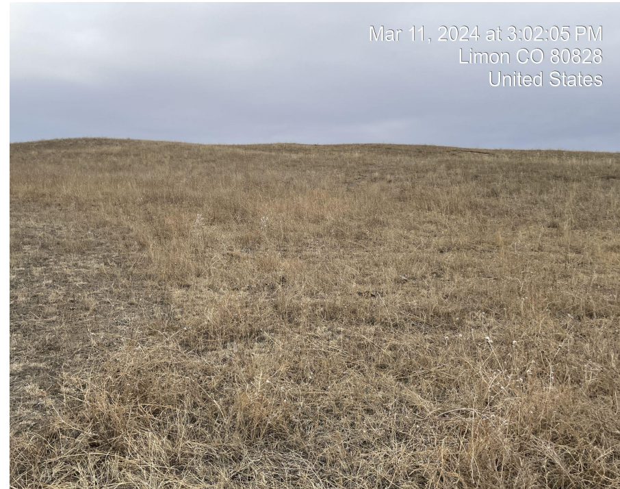
Photo 8. Photo taken facing northwest of vegetation in the interim reclamation area.