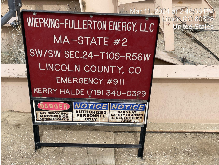
Photo 1. Photo taken of location sign.