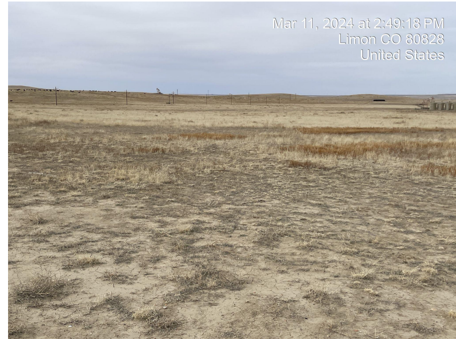
Photo 8. Photo taken facing northwest of vegetation in the interim reclamation area.