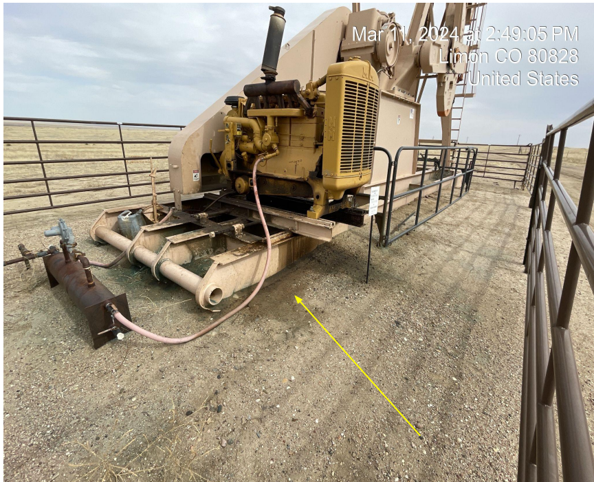
Photo 3. Photo taken facing northeast of stained soil under engine.