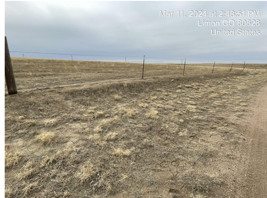
Photo 6. Photo taken facing southwest of vegetation in the interim reclamation area.