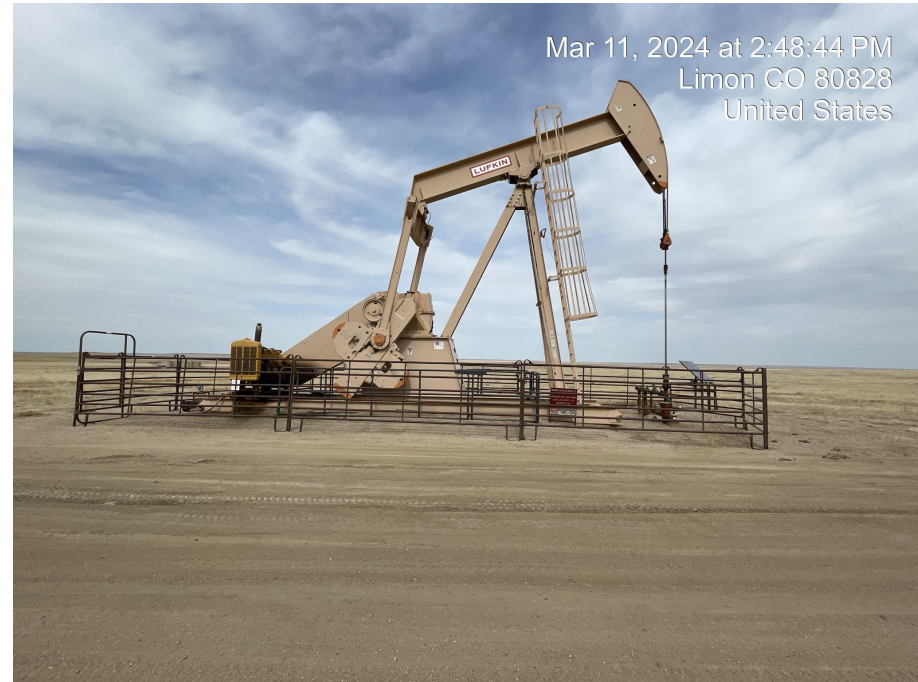
Photo 2. Photo taken facing east of wellhead.