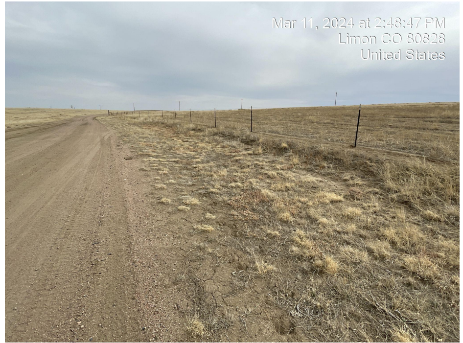
Photo 4. Photo taken facing east of vegetation in the interim reclamation area.