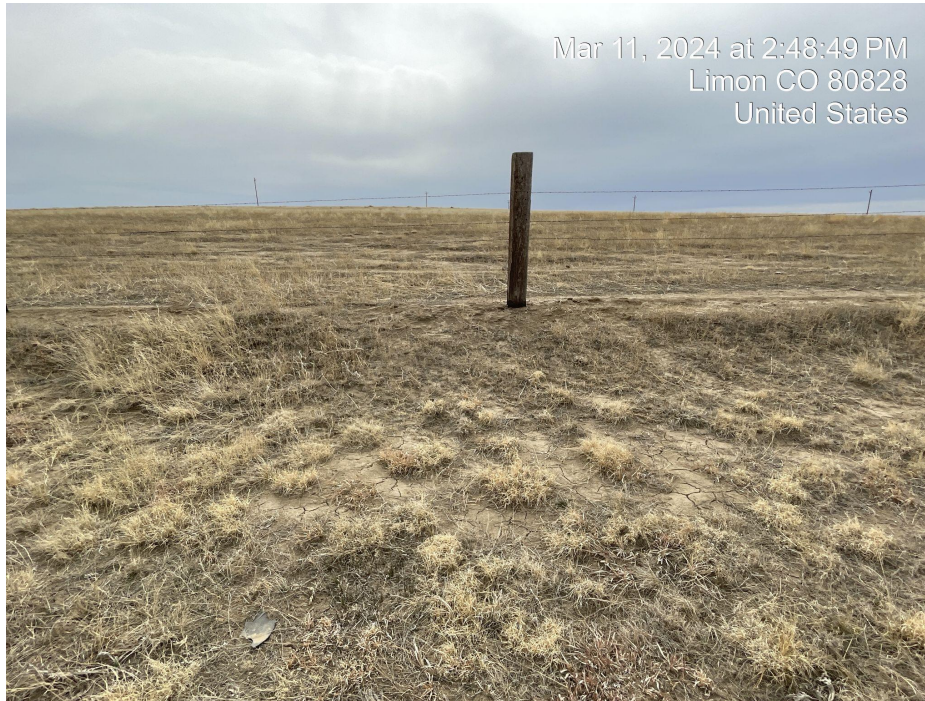
Photo 5. Photo taken facing south of vegetation in the interim reclamation area.