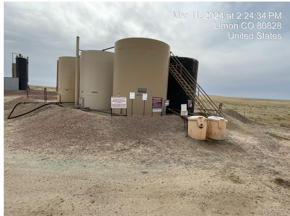
Photo 12. Photo taken facing east of tank battery.