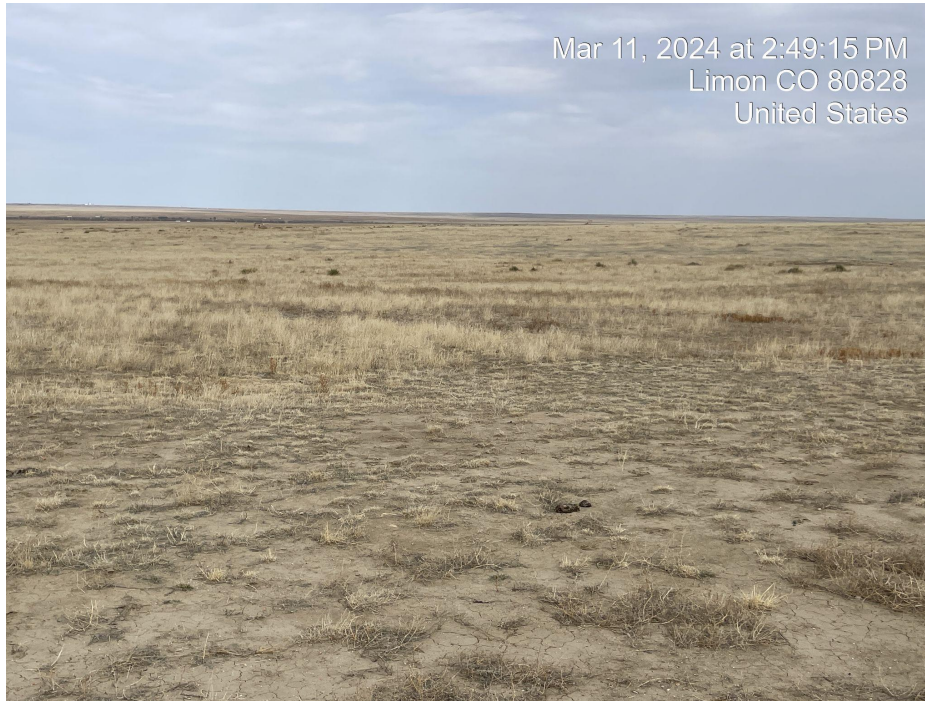
Photo 7. Photo taken facing north of vegetation in the interim reclamation area.