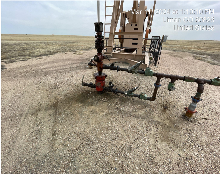
Photo 3. Photo taken facing north of staining around wellhead.