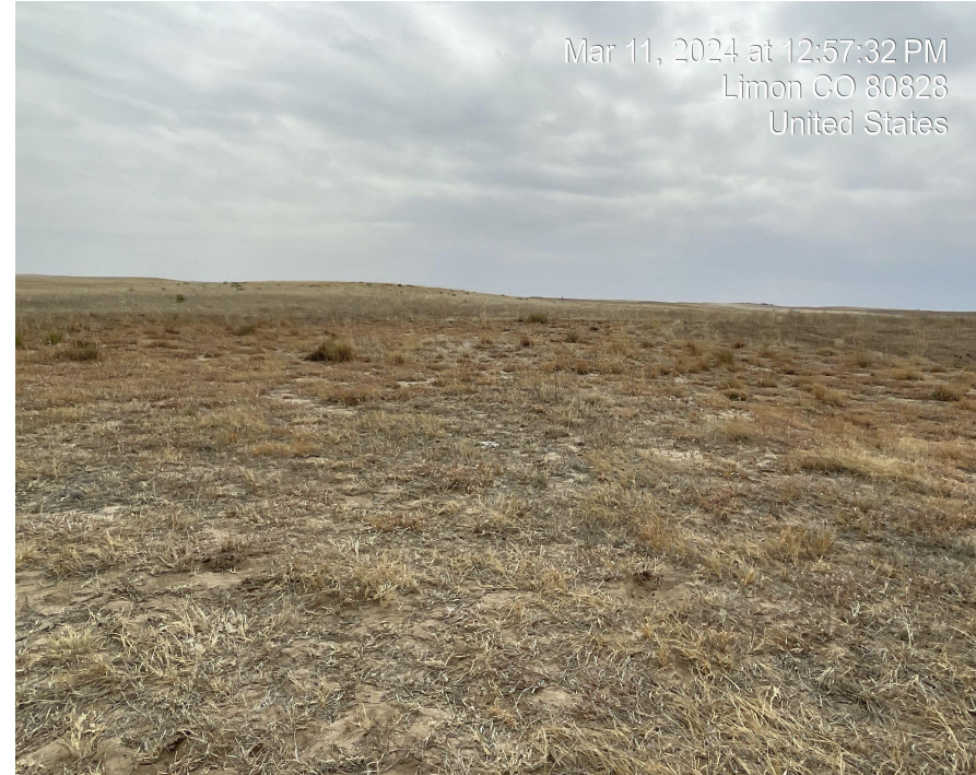
Photo 8. Photo taken facing south of vegetation in interim reclamation area.