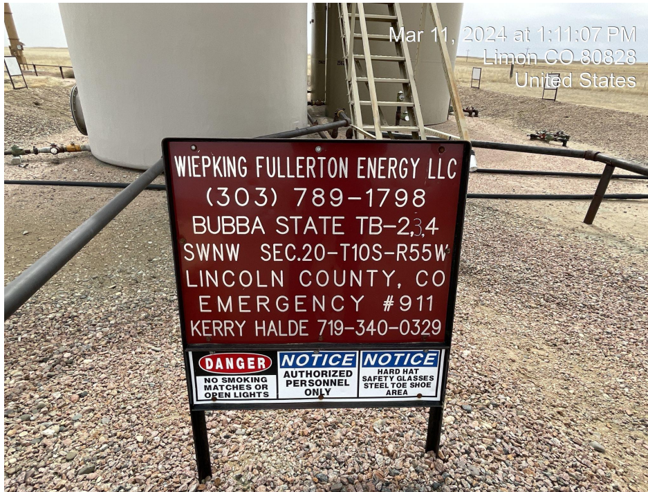
Photo 9. Photo taken facing south of tank battery sign