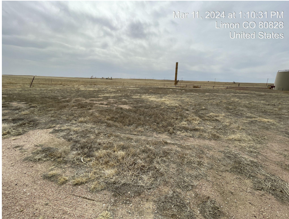
Photo 7. Photo taken facing southeast of vegetation in interim reclamation area.