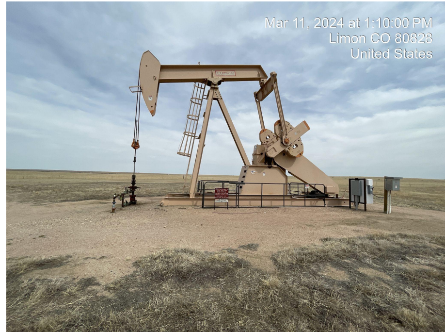
Photo 2. Photo taken facing east of wellhead.