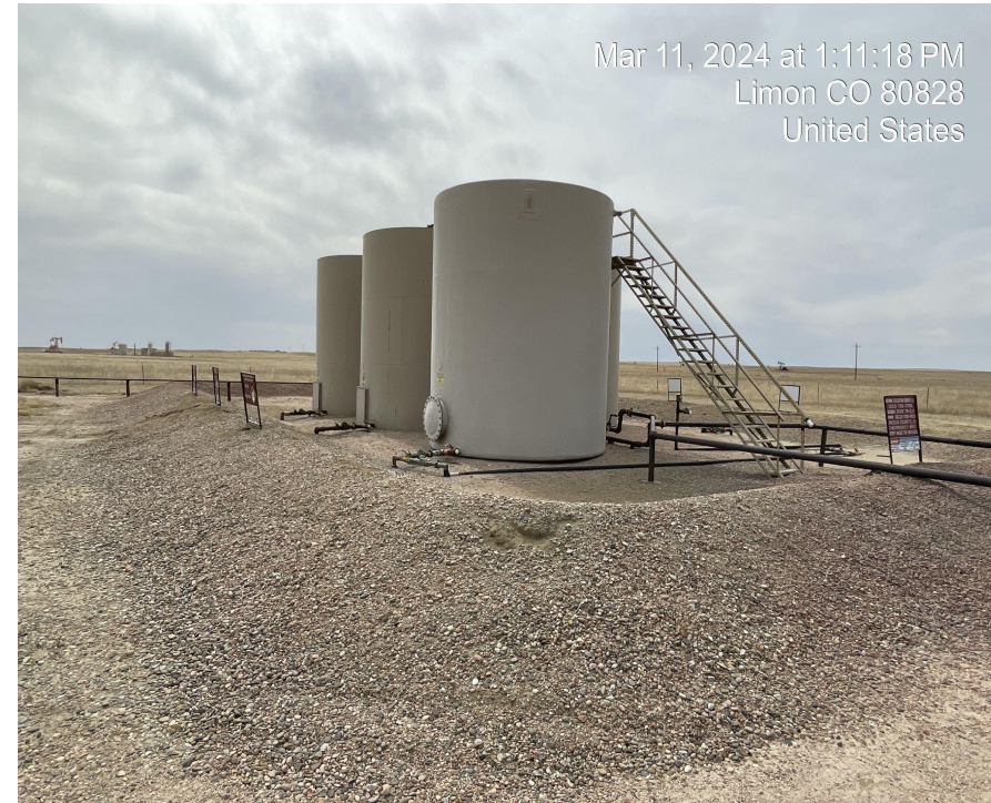
Photo 10. Photo taken facing southwest of tank battery.