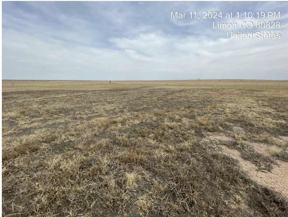
Photo 5. Photo taken facing northwest of mowed vegetation in interim reclamation area.