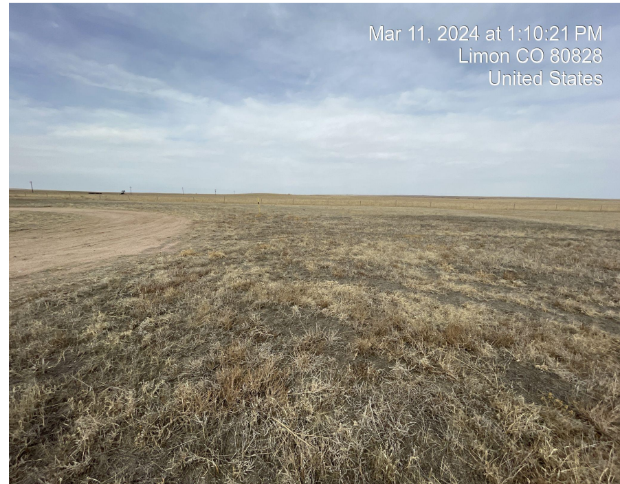
Photo 6. Photo taken facing east of mowed vegetation in interim reclamation area.