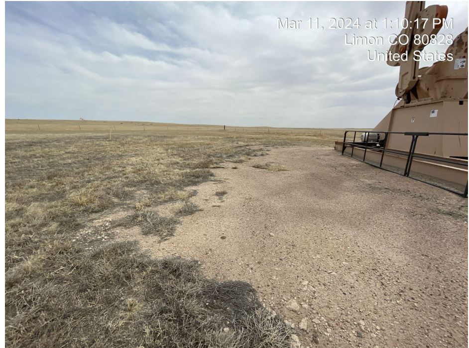
Photo 4. Photo taken facing southeast of mowed vegetation in interim reclamation area.