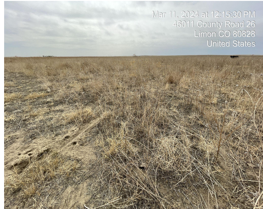
Photo 8. Photo taken facing southeast of vegetation in interim reclamation area.