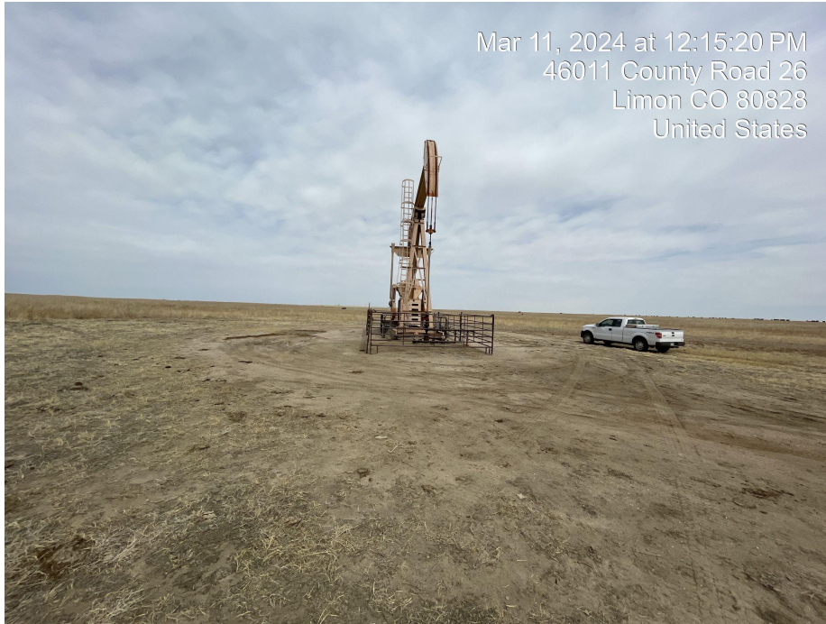
Photo 5. Photo taken facing northeast of reclamation area of mowed vegetation around wellhead.