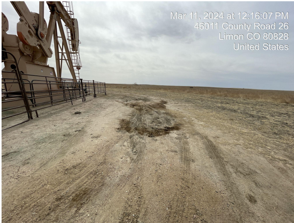
Photo 7. Photo taken facing west of stained soil next to pumpjack.