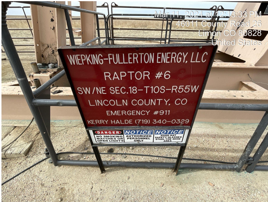
Photo 1. Photo taken of location sign.