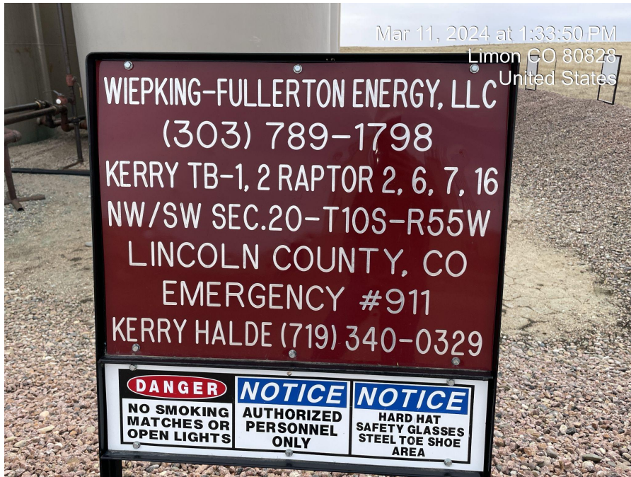
Photo 9. Photo taken facing northwest of tank battery sign off site.