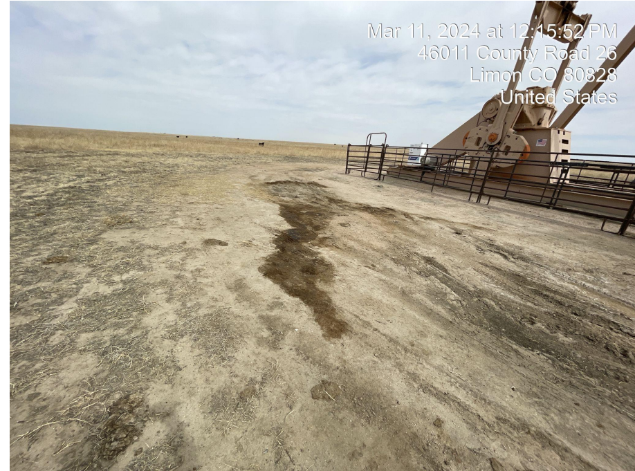
Photo 6. Photo taken facing east of stained soil next to pumpjack.