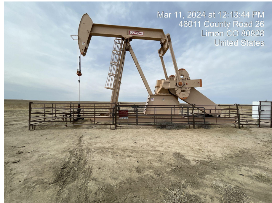
Photo 2. Photo taken facing north of well head.