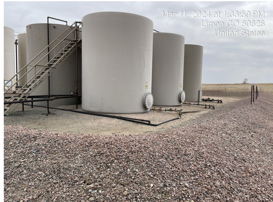
Photo 10. Photo taken facing southwest of tank battery.