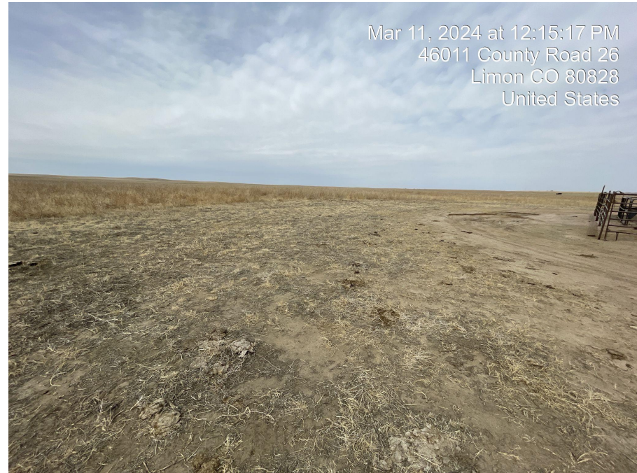
Photo 4. Photo taken facing northw of reclamation area of mowed vegetation.