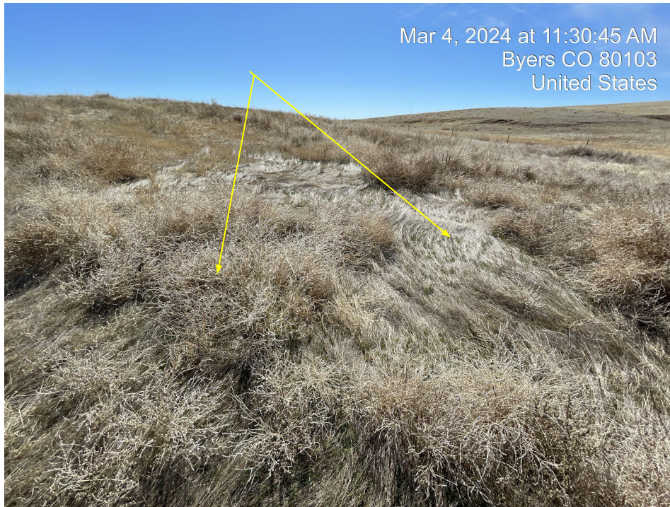
Photo 17. Photo taken facing southeast of pad reclamation area of vegetation and weeds (russian thistle, kochia & cheatgrass). Weeds indicated by yellow arrow.