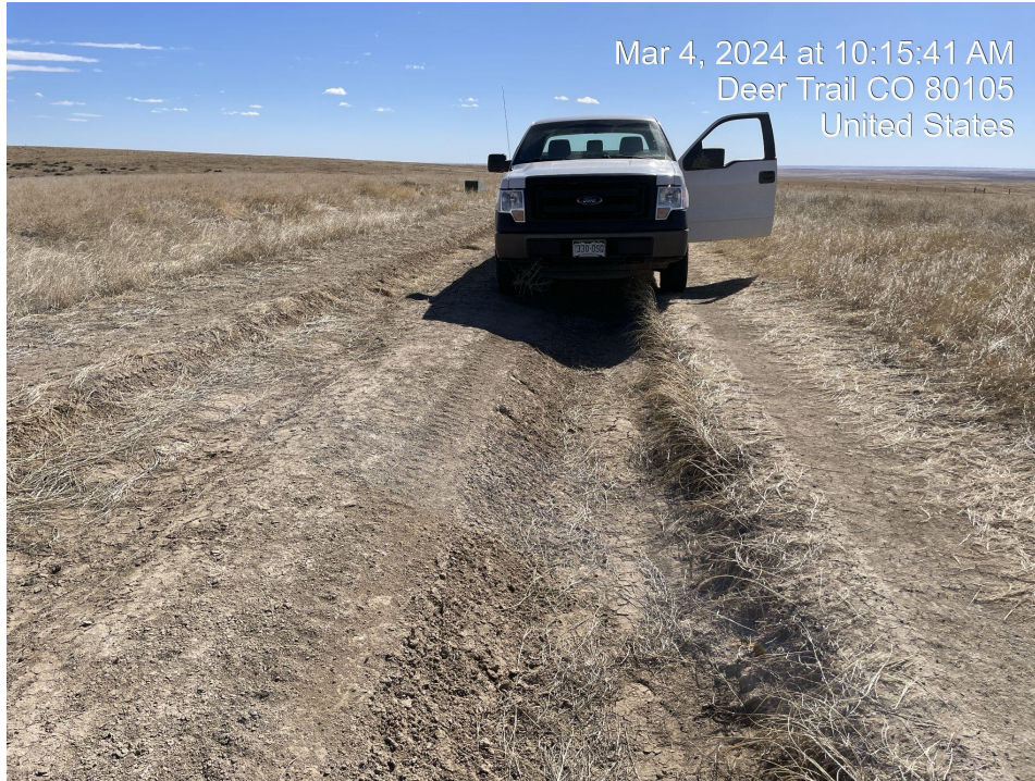
Photo 20. Photo taken facing south of rutted access road.