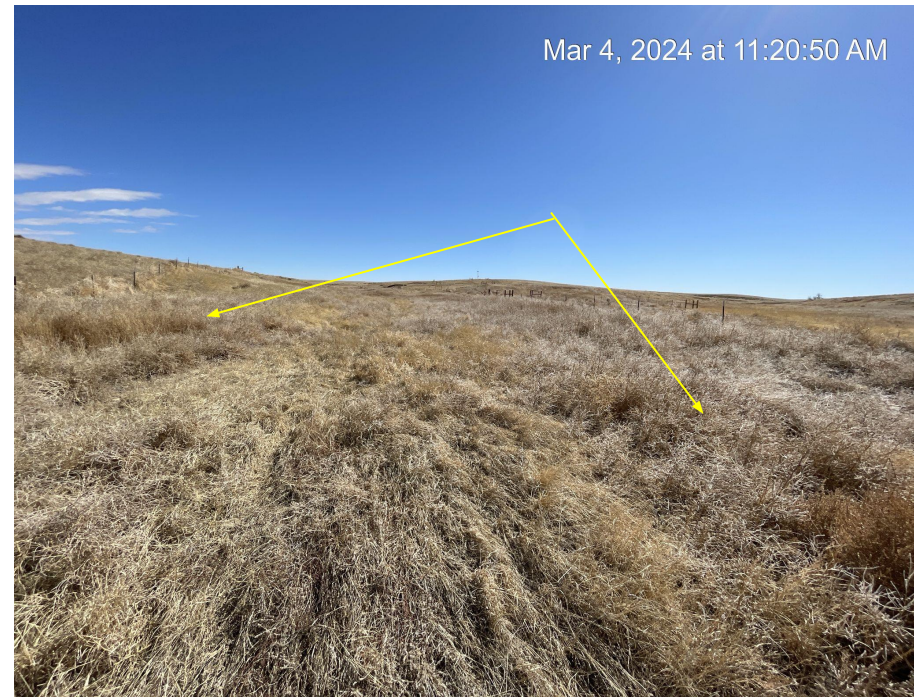
Photo 6. Photo taken facing southeast of pad reclamation area of vegetation and weeds (russian thistle & kochia). Weeds indicated by yellow arrow.