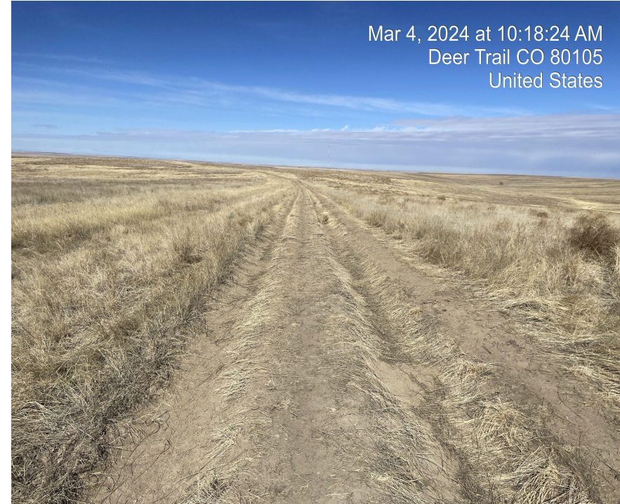
Photo 21. Photo taken facing northwest of rutted access road.