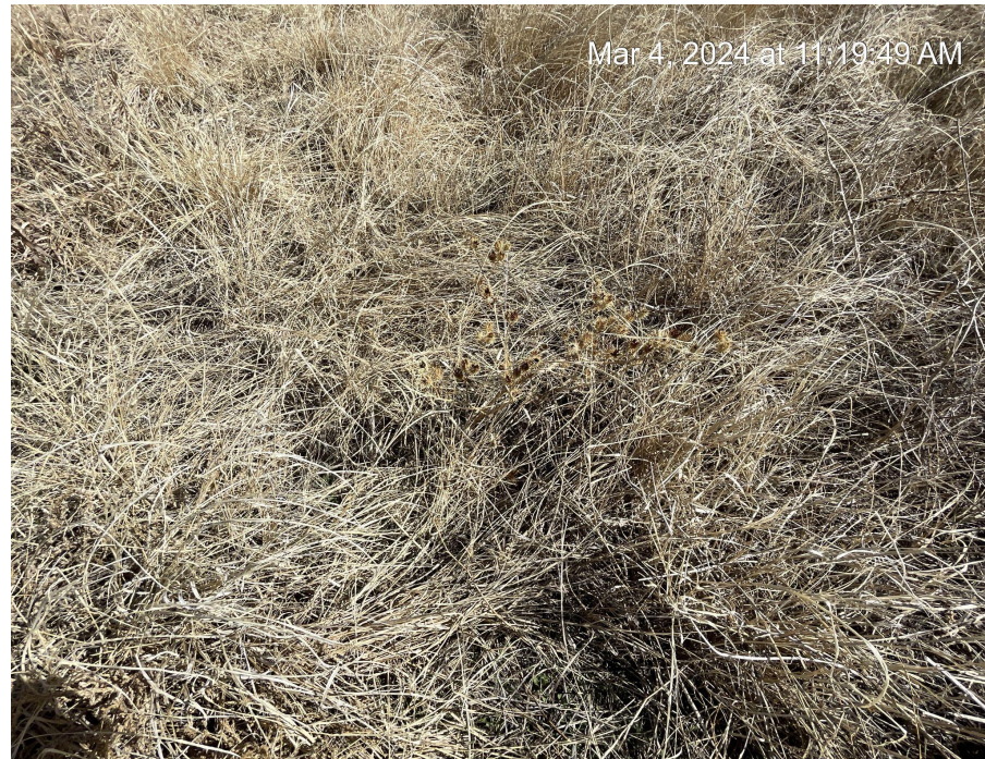
Photo 4. Photo taken facing north of close up of weeds (russian thistle & bull thistle).