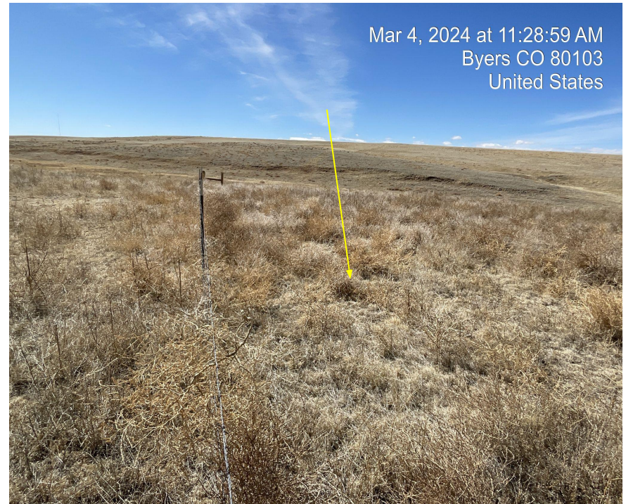
Photo 14. Photo taken facing southwest of pad reclamation area of vegetation and weeds (russian thistle & kochia). Weeds indicated by yellow arrow.