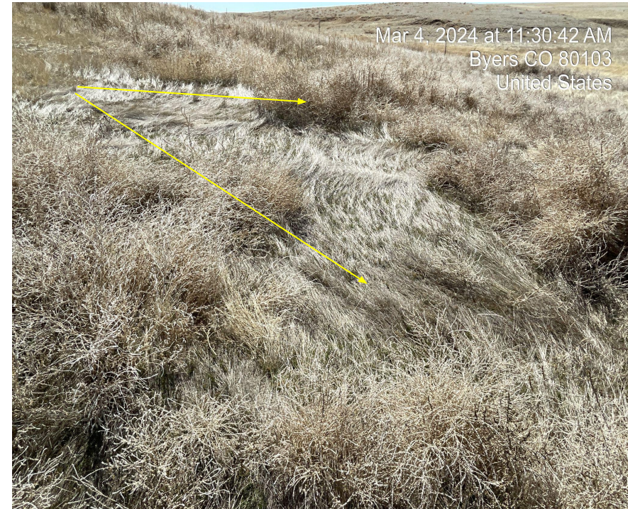
Photo 18. Photo taken facing southeast of pad reclamation area of vegetation and weeds (russian thistle, kochia & cheatgrass). Weeds indicated by yellow arrow.