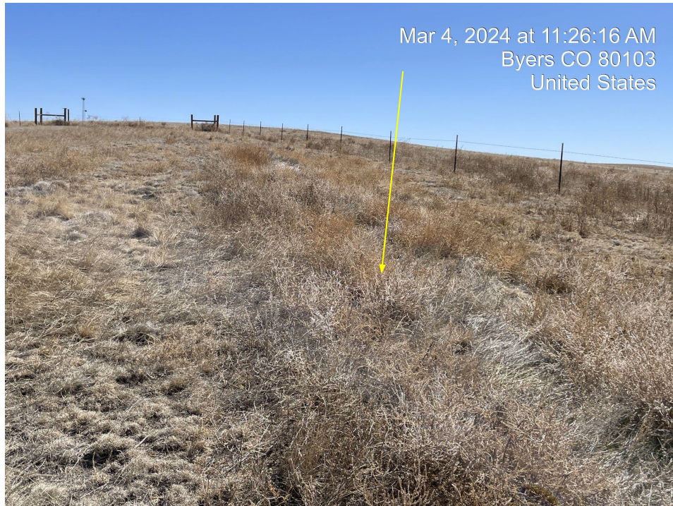
Photo 13. Photo taken facing southwest of access road to pad reclamation area of vegetation and weeds (russian thistle & kochia). Weeds indicated by yellow arrow.