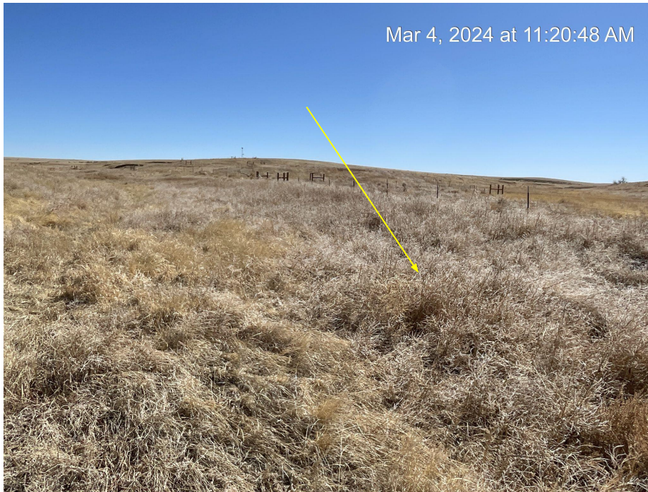
Photo 5. Photo taken facing southeast of reclamation area of vegetation and weeds (russian thistle, bull thistle & kochia). Weeds indicated by yellow arrow.