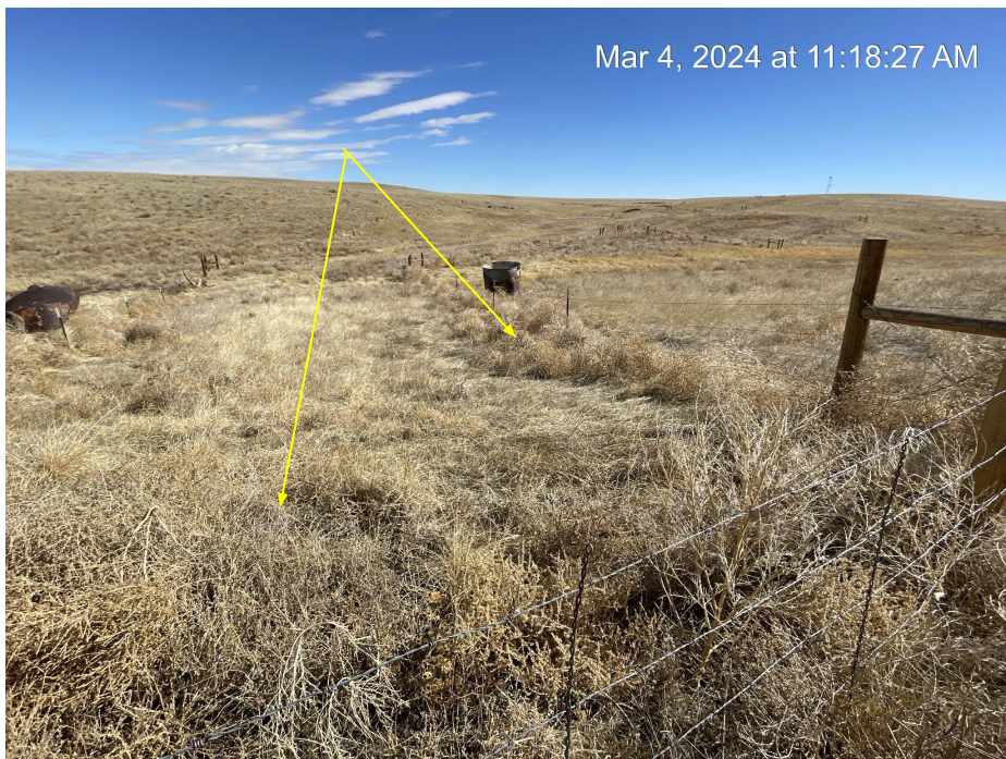
Photo 3. Photo taken facing east of reclaimed area vegetation and weeds (russian thistle & kochia). Weeds indicated by yellow arrow.