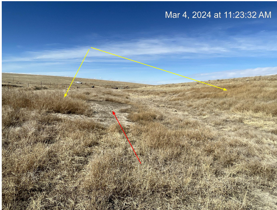
Photo 11. Photo taken facing west of weeds (russian thistle, & kochia)( yellow arrow) and bare soil (Red arrow) in reclaimed area. Red arrow indicating bare soil is an example of bare area from salt kill.