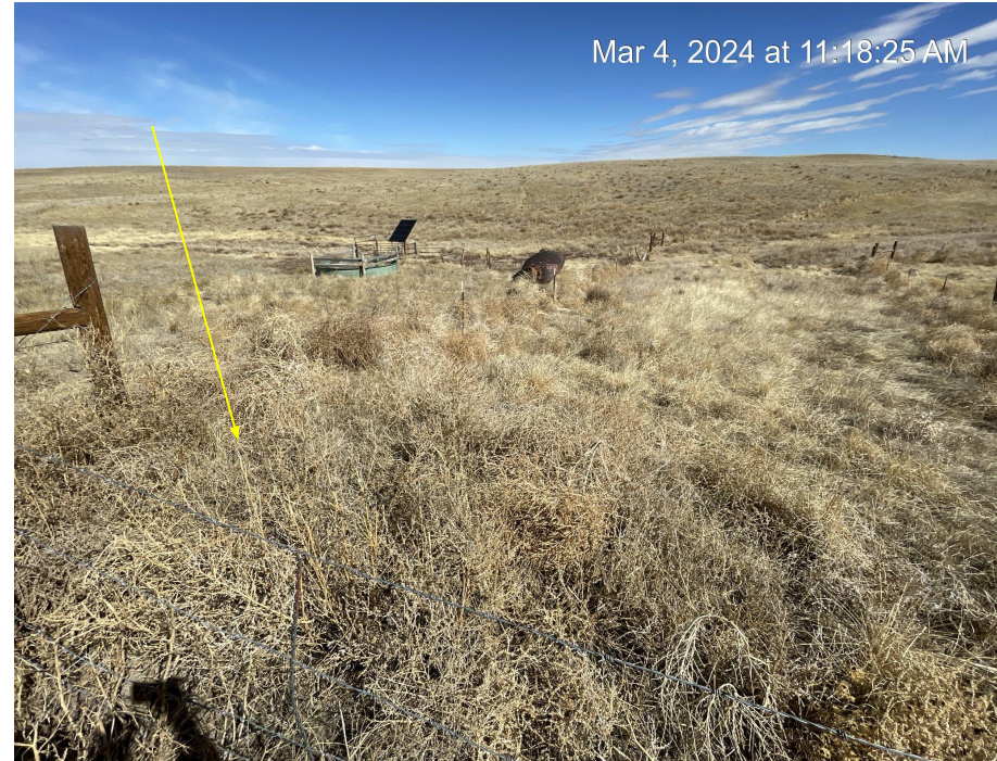
Photo 1. Photo taken facing northeast of perimeter fence of reclaimed area vegetation and weeds (koachia & russian thistle).