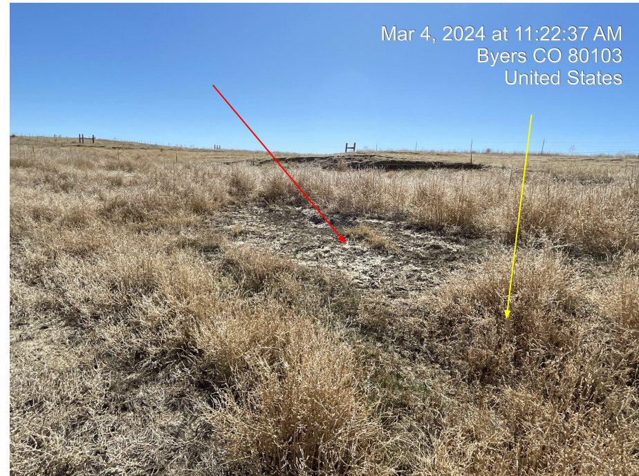
Photo 7. Photo taken facing west of pad reclamation area of vegetation and weeds (russian thistle, bull thistle & kochia). Weeds indicated by yellow arrow.

Mar 4, 2024 at 11:22:37 AM Byers CO 80103 United States