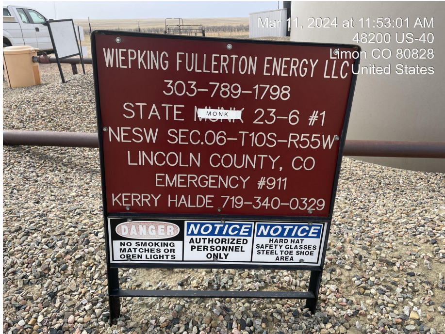
Photo 1. Photo taken of location sign.