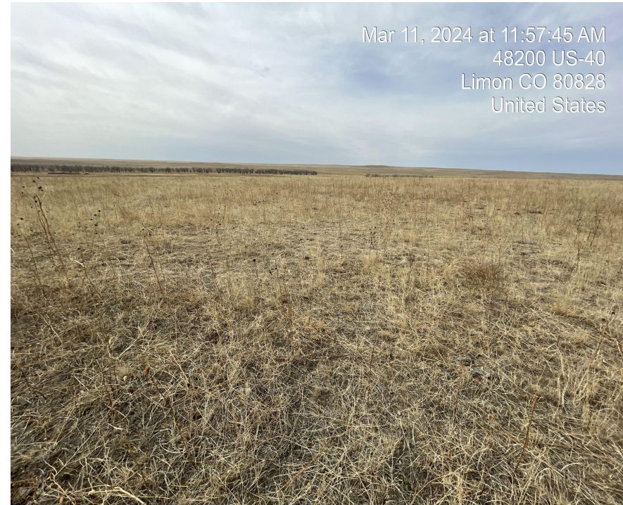
Photo 12. Photo taken facing south of pad reclamation area vegetation.