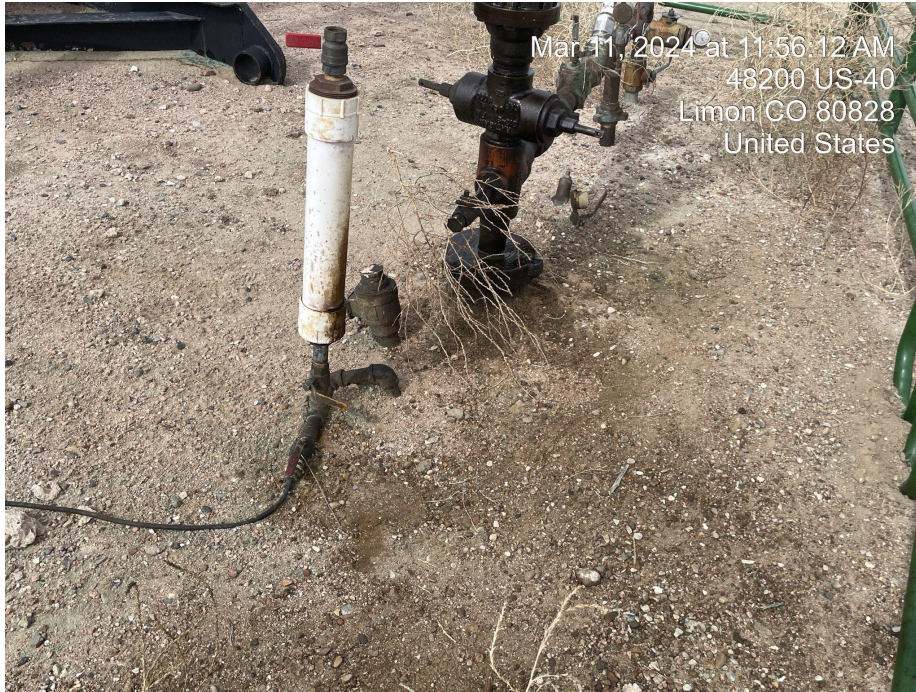
Photo 7. Photo taken facing southwest of wellhead and staining of soil.