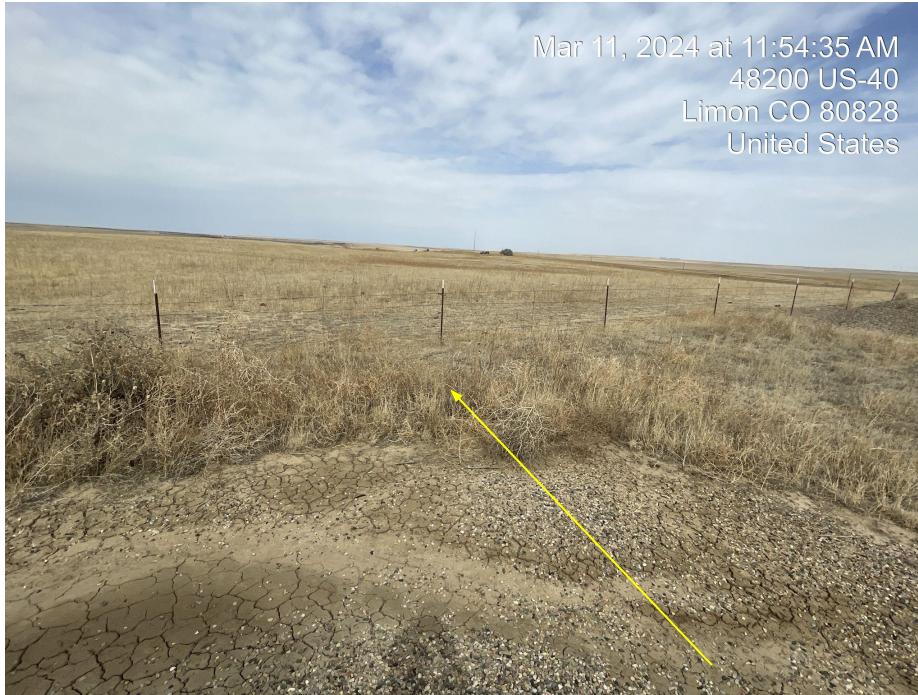
Photo 5. Photo taken facing north of reclamation area of vegetation and weeds (Russian thistle & Kochia). Weeds indicated by yellow arrow.