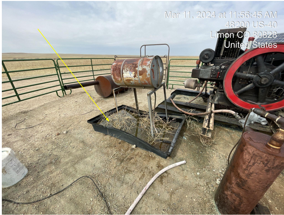
Photo 9. Photo taken facing north of secondary containment lacking wildlife protection, indicated by yellow arrow.