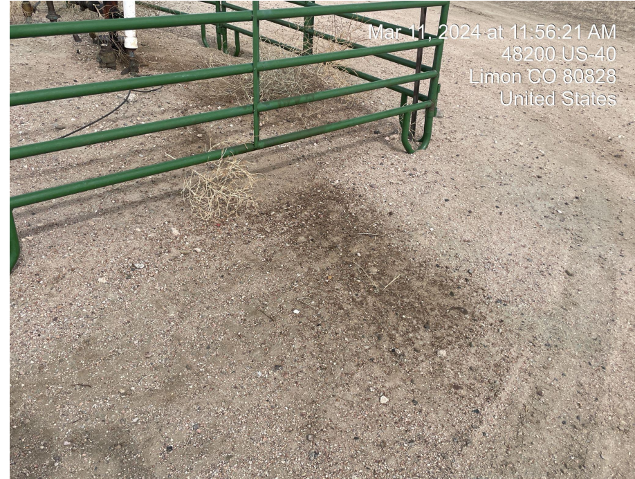
Photo 8. Photo taken facing west of stained soil around wellhead.