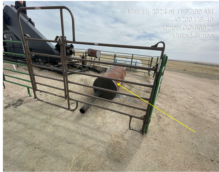
Photo 10. Photo taken facing southeast of unused equipment on site, indicated by yellow arrow.