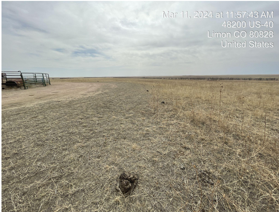
Photo 11. Photo taken facing east of pad reclamation area of mowed vegetation.