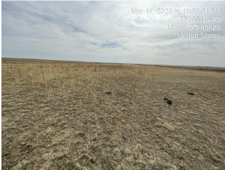
Photo 13. Photo taken facing north of interim reclamation area.