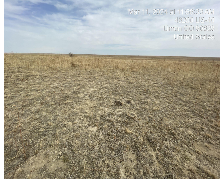
Photo 14. Photo taken facing west of interim reclamation area.