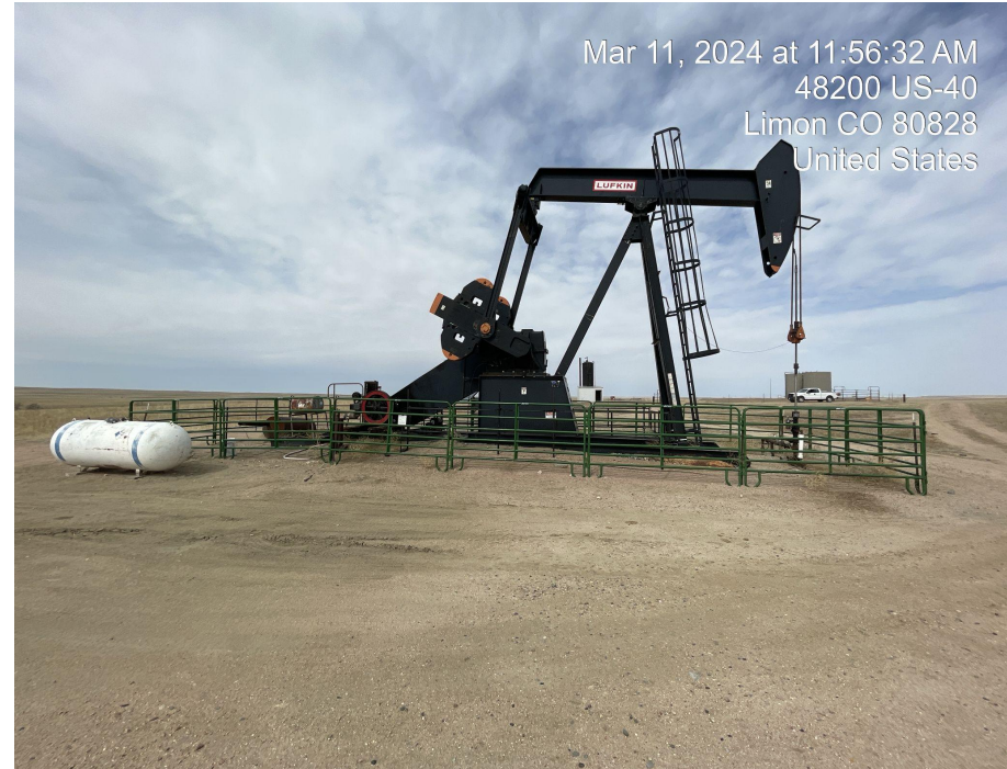
Photo 2. Photo taken facing northwest of well head.