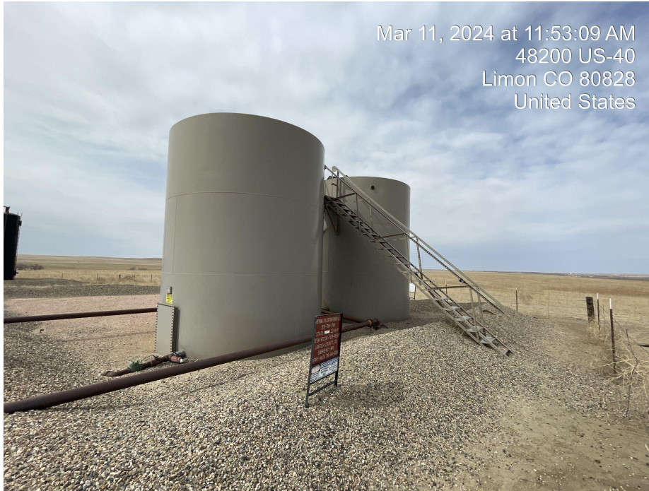
Photo 3. Photo taken facing northwest of tank battery on site.