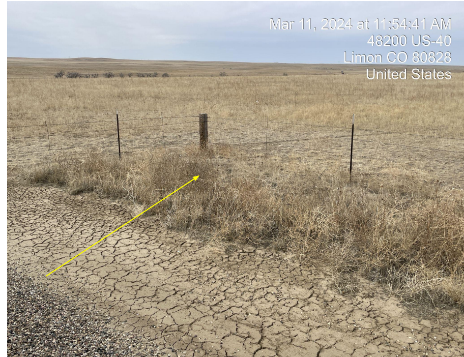
Photo 6. Photo taken facing northwest of reclamation area of vegetation and weeds (Russian thistle & Kochia). Weeds indicated by yellow arrow.