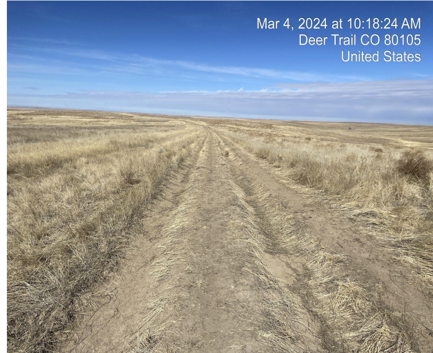
Photo 15. Photo taken facing northwest of rutted access road.