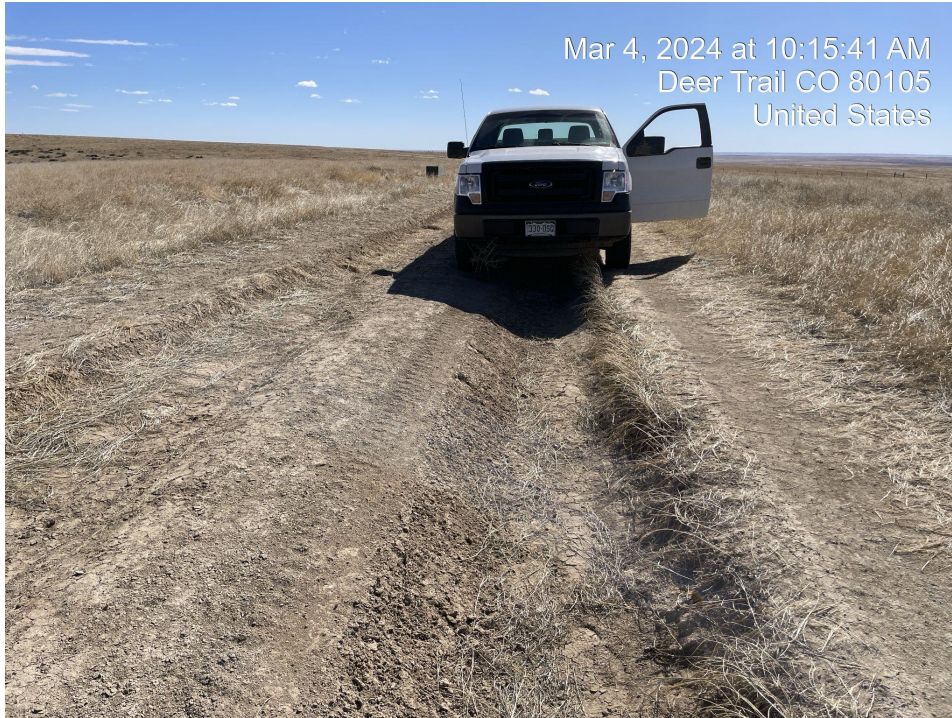
Photo 14. Photo taken facing south of rutted access road.