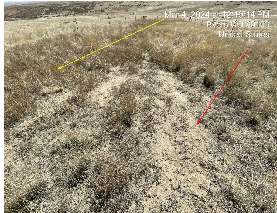
Photo 4. Photo taken facing south of reclamation area of vegetation, weeds (russian thistle & kochia) and bare soil. Weeds indicated by yellow arrow, bare soil indicated by red arrow.