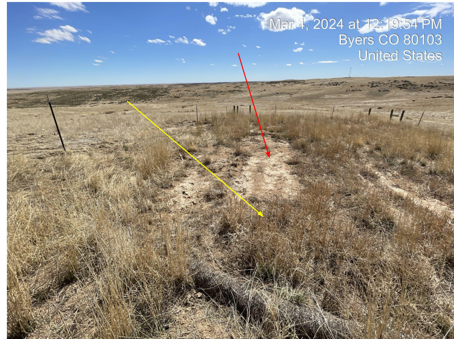
Photo 8. Photo taken facing southwest of pad reclamation area of vegetation, weeds (russian thistle & kochia) and bare soil. Weeds indicated by yellow arrow, bare soil indicated by red arrow.