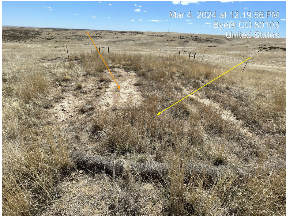
Photo 9. Photo taken facing south of reclamation area of vegetation, weeds (russian thistle & kochia) and bare soil. Weeds indicated by yellow arrow, bare soil indicated by red arrow.