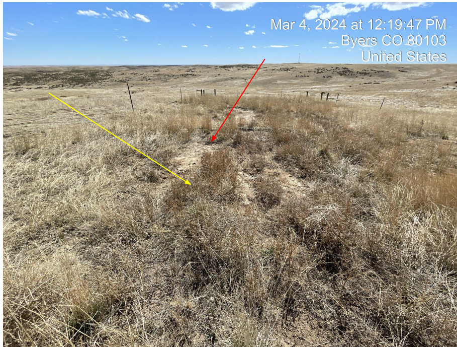
Photo 7. Photo taken facing southwest of reclamation area of vegetation, weeds (russian thistle & kochia) and bare soil. Weeds indicated by yellow arrow, bare soil indicated by red arrow.