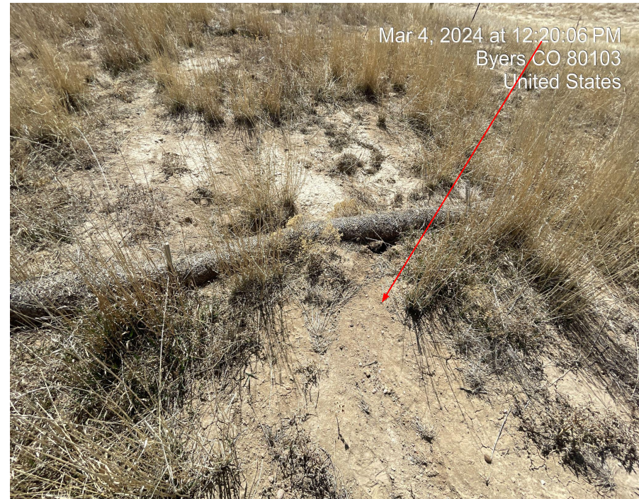
Photo 10. Photo taken facing south of reclamation area of vegetation, bare soil and stormwater erosion under BMP. Bare soil indicated by red arrow.