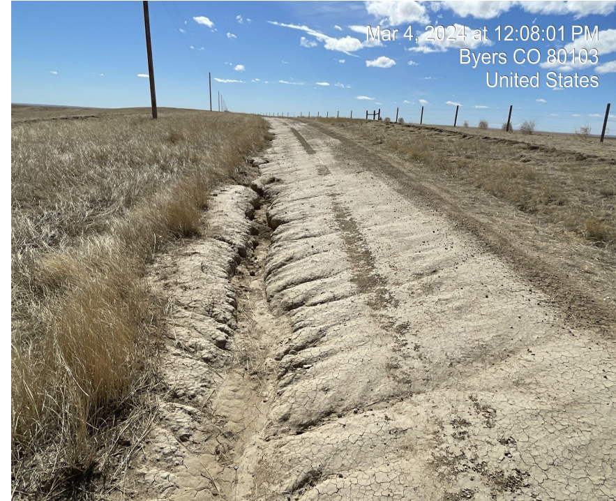
Photo 17. Photo taken facing northwest of rutted access road with stormwater erosion. .