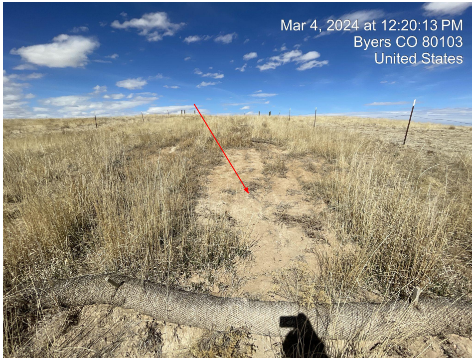
Photo 11. Photo taken facing north of pad reclamation area of vegetation and bare soil. Bare soil indicated by red arrow.