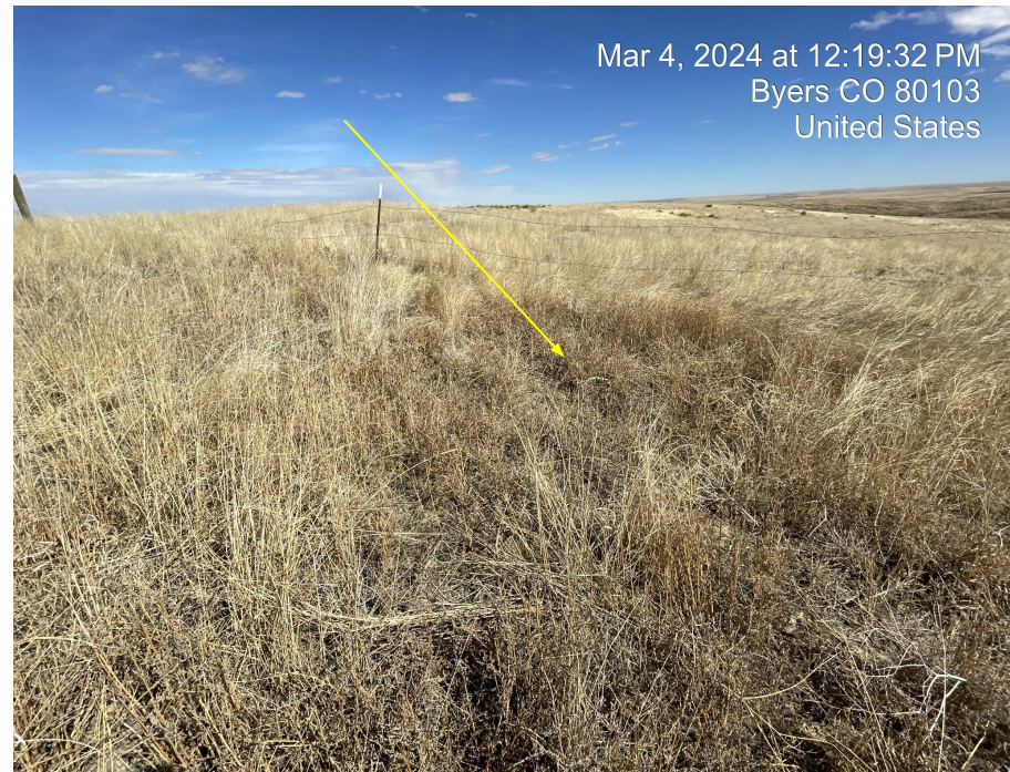
Photo 6. Photo taken facing northeast of reclamation area of vegetation and weeds (russian thistle & kochia). Weeds indicated by yellow arrow.