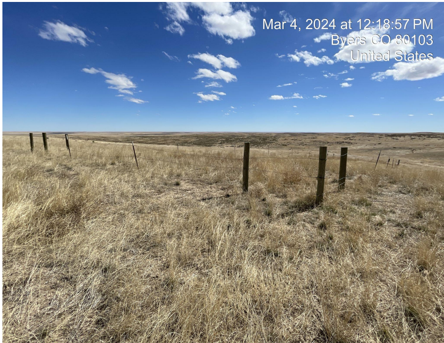
Photo 1. Photo taken facing southeast of reclaimed area.