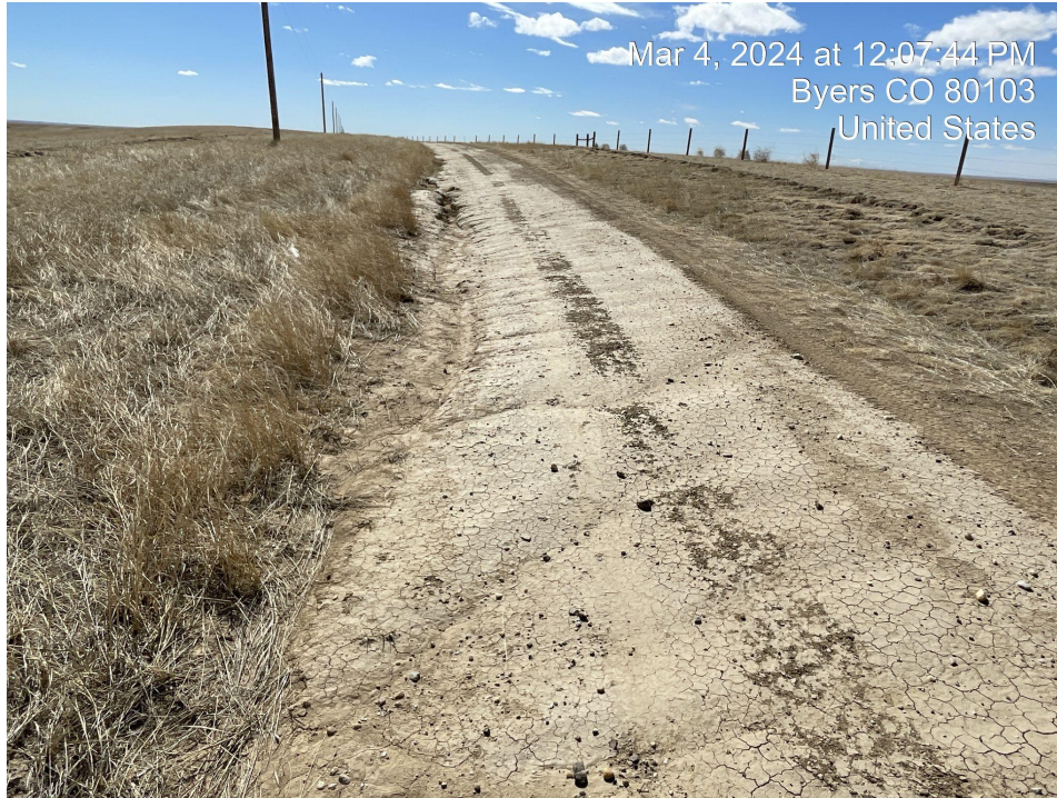
Photo 16. Photo taken facing southwest of rutted access road with stormwater erosion..