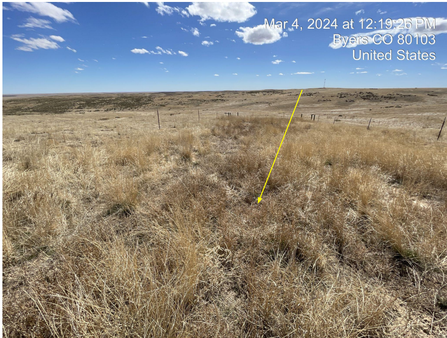
Photo 5. Photo taken facing southeast of reclamation area of vegetation and weeds (russian thistle & kochia). Weeds indicated by yellow arrow.