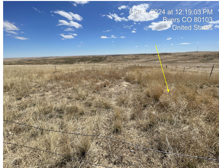
Photo 2. Photo taken facing south of pad reclamation area of vegetation and weeds (Russian thistle & Kochia). Weeds indicated by yellow arrow.