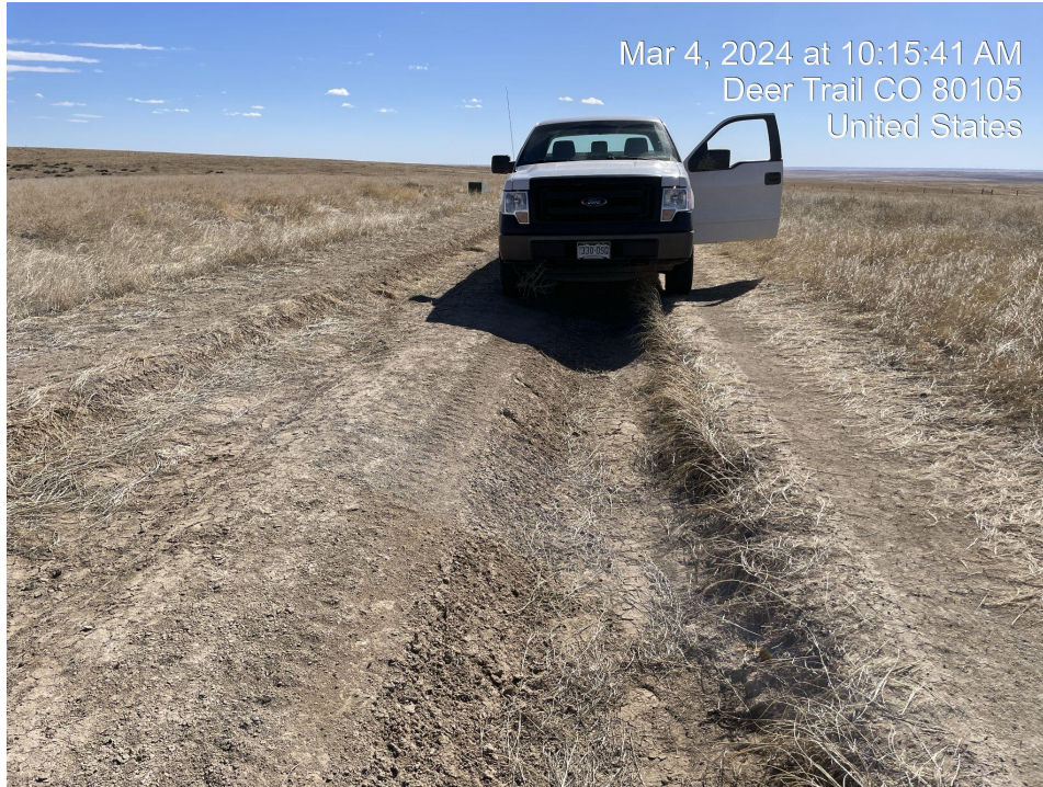
Photo 14. Photo taken facing south of rutted access road.