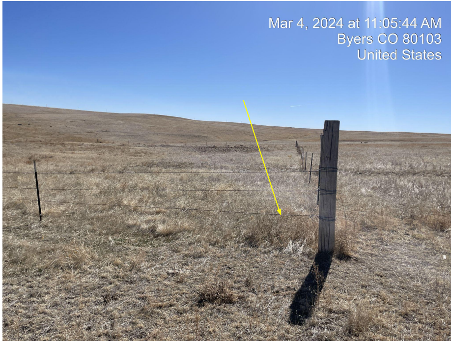
Photo 3. Photo taken facing east of reclaimed pad perimeter fence, vegetation and weeds (russian thistle & kochia). Weeds indicated by yellow arrow.