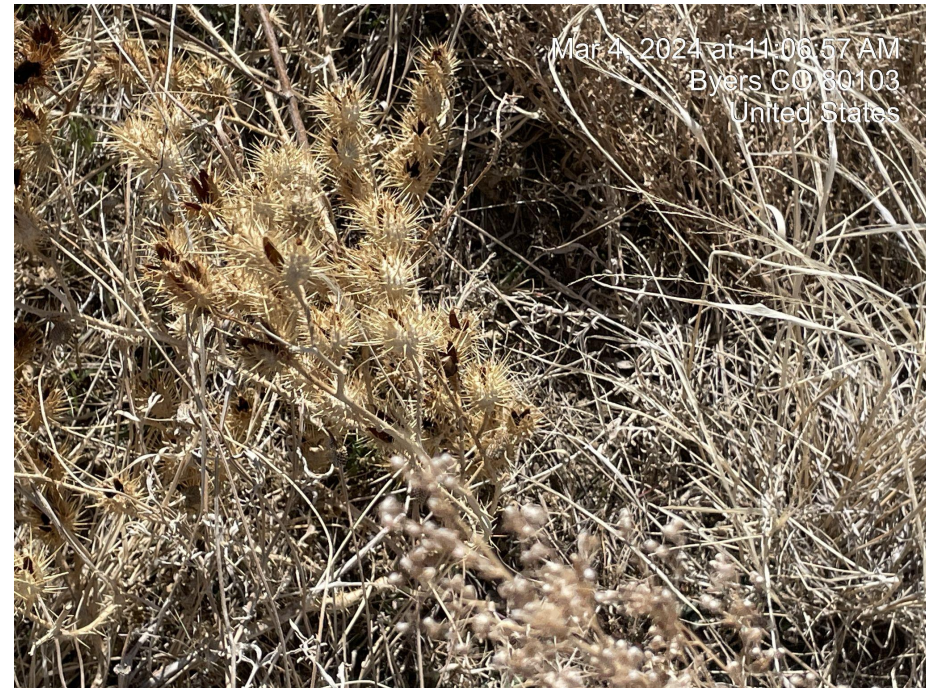
Photo 8. Photo taken facing northeast of close up of weeds (bull thistle).