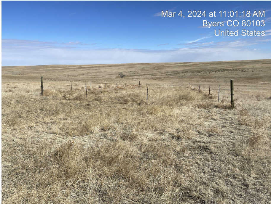
Photo 1. Photo taken facing northeast of perimeter fence of reclaimed access road. The access road meet final reclamation standards of 80% native vegetation, weed management will need to continue.