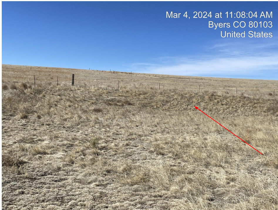
Photo 11. Photo taken facing southwest of pad reclamation area of vegetation and weeds (russian thistle & kochia) and cut slope not recontoured to native landscape (indicated by red arrow).