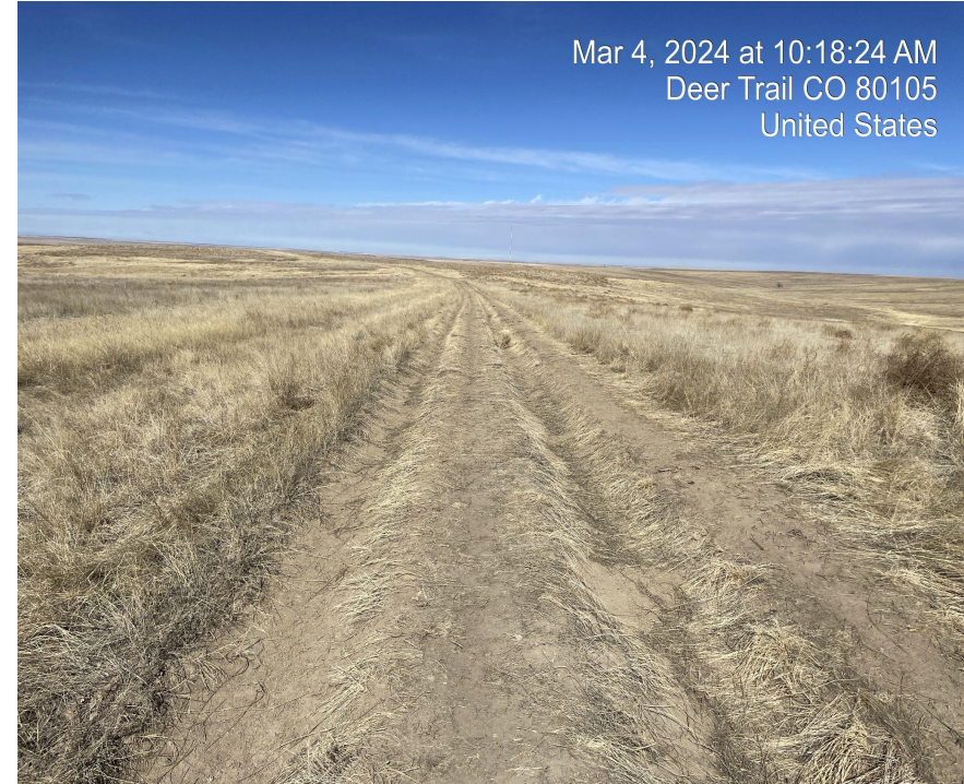
Photo 15. Photo taken facing northwest of rutted access road.