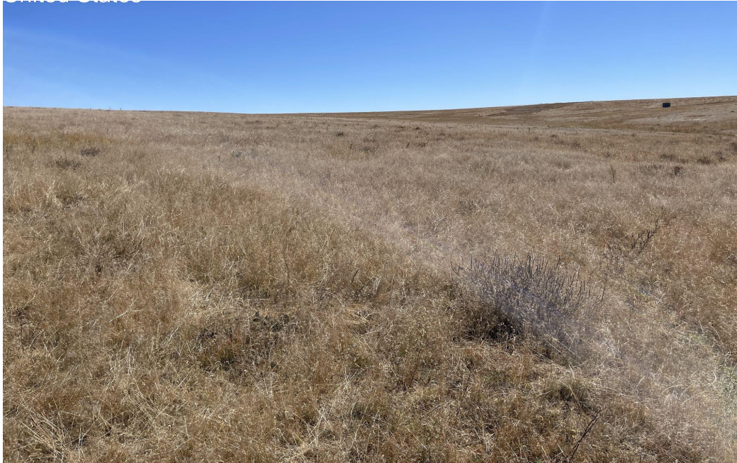
Photo 13. Photo taken facing southwest of native vegetation for reference.