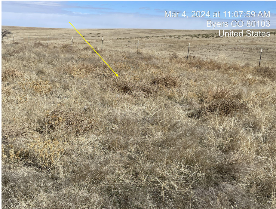
Photo 5. Photo taken facing southeast of reclamation area of vegetation and weeds (russian thistle, bull thistle & kochia). Weeds indicated by yellow arrow.