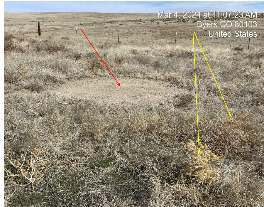
Photo 10. Photo taken facing west of pad reclamation area of bare soil, vegetation and weeds (russian thistle, bull thistle & kochia). Weeds indicated by yellow arrow, Red arrow indicates bare soil.