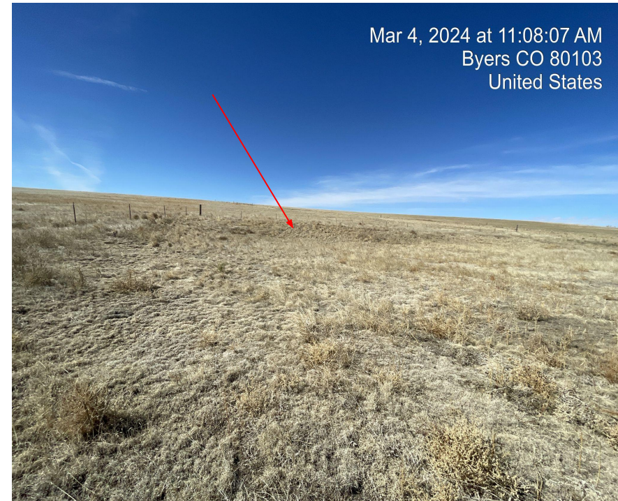
Photo 12. Photo taken facing southwest of pad reclamation area of vegetation and weeds (russian thistle & kochia) and cut slope not recontoured to native landscape (indicated by red arrow).