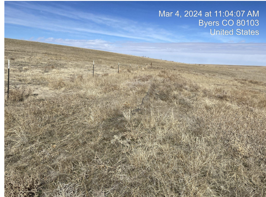
Photo 2. Photo taken facing northeast of reclaimed access road. The access road meet final reclamation standards of 80% native vegetation, weed management will need to continue.