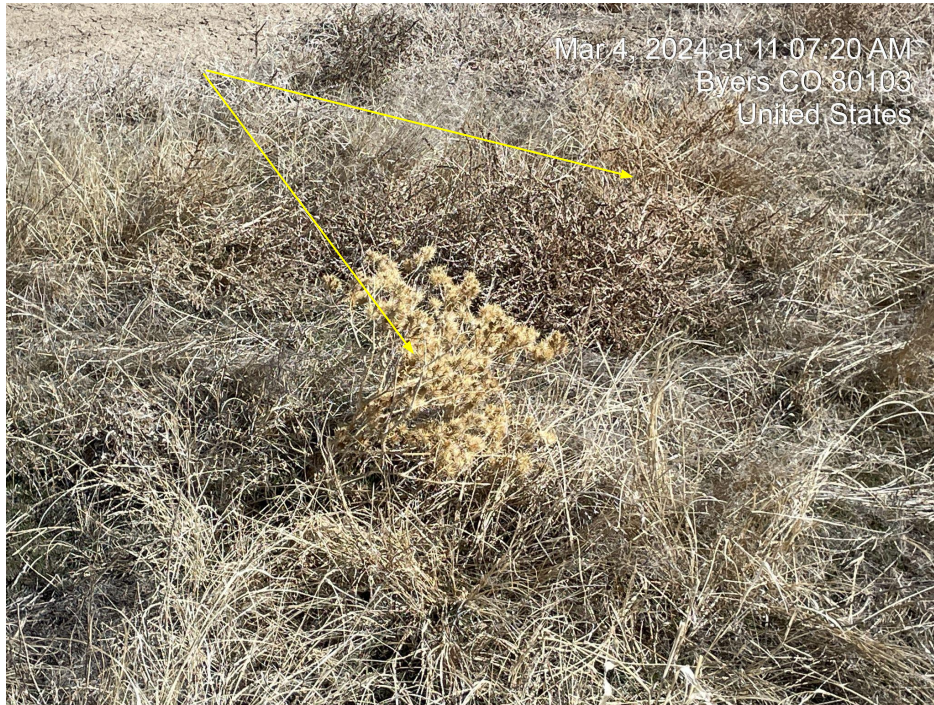
Photo 9. Photo taken facing east of pad reclamation area of vegetation and weeds (russian thistle, bull thistle & kochia). Weeds indicated by yellow arrow.