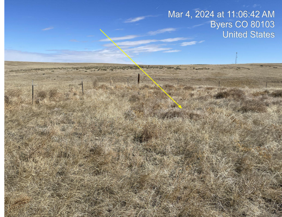
Photo 6. Photo taken facing southwest of pad reclamation area of vegetation and weeds (russian thistle & kochia). Weeds indicated by yellow arrow.