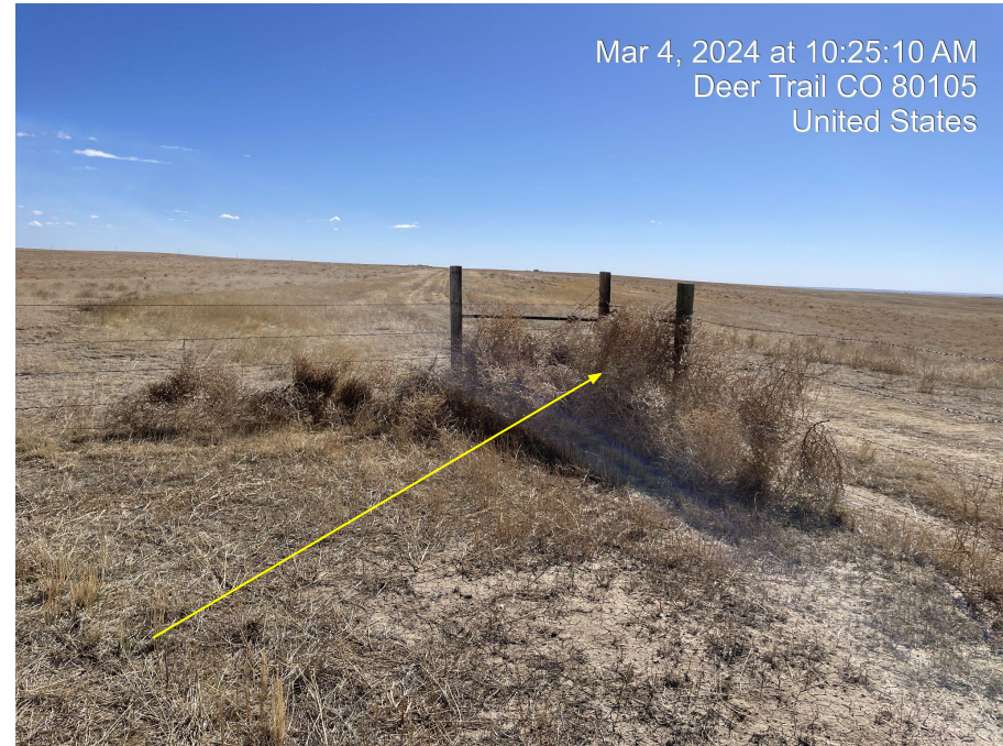
Photo 4. Photo taken facing east of perimeter fence of reclamation area. The reclaimed area has been mowed, Russian thistle debris was observed in the fence. Weed debris indicated by yellow arrow. Perennial vegetation is not apparent.