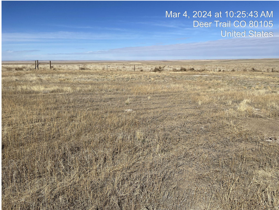
Photo 5. Photo taken facing northwest of mowed vegetation in reclamation area. Perennial vegetation is not apparent.