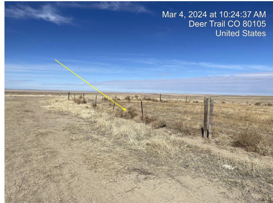
Photo 2. Photo taken facing west of perimeter fence of reclamation area. The reclaimed area has been mowed, Russian thistle debris was observed in the fence. Weed debris indicated by yellow arrow.