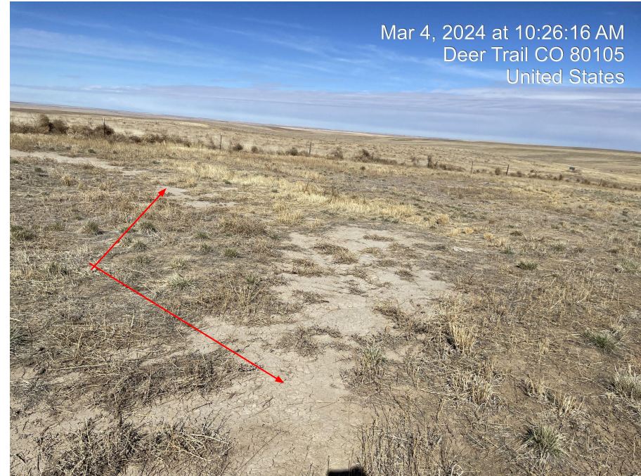
Photo 6. Photo taken facing west of mowed vegetation and bare soil in reclamation area. Red arrow indicates bare soil.