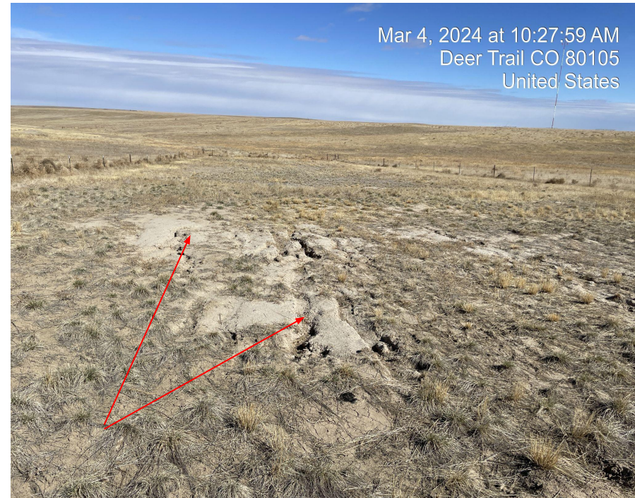
Photo 10. Photo taken facing north of mowed vegetation and eroding bare soil in reclamation area. Red arrow indicates bare soil.