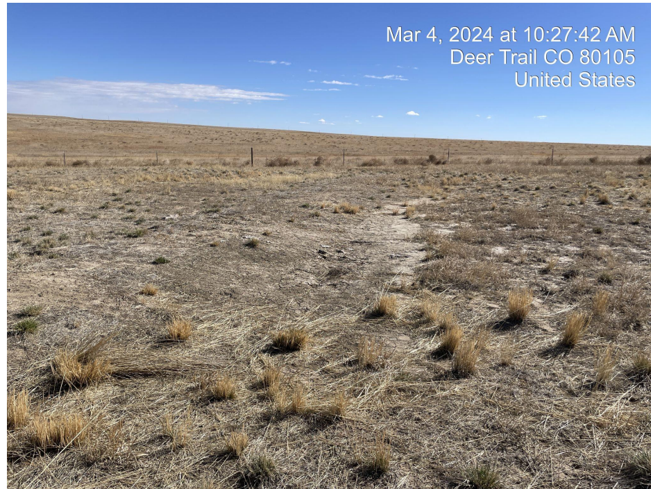
Photo 9. Photo taken facing northwest of mowed vegetation in reclamation area. Perennial vegetation is not apparent.