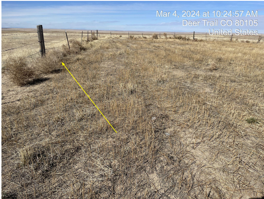
Photo 3. Photo taken facing west of perimeter fence of reclamation area. The reclaimed area has been mowed, Russian thistle debris was observed in the fence. Weed debris indicated by yellow arrow. Perennial vegetation is not apparent.