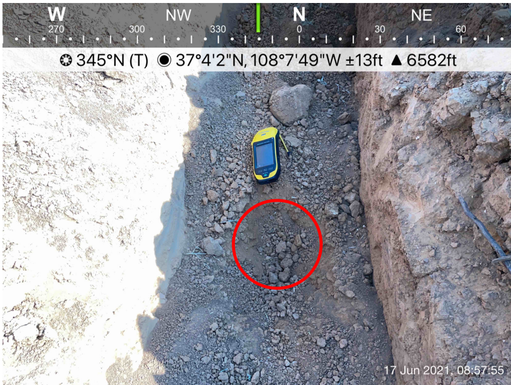
Photo 2: SS02 collected from a flowline segment at the Ferguson (OWP) #2F-12Y, 6/17/2021.