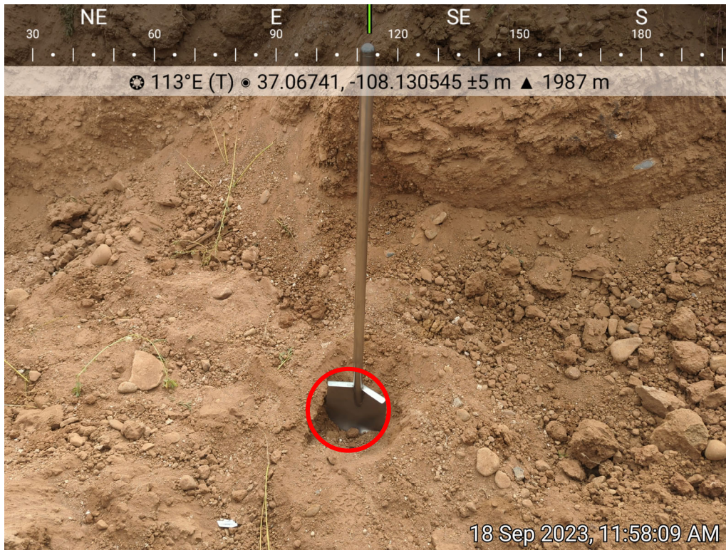
Photo 7: SS06 collected from base of wellhead excavation, 9/18/2023.