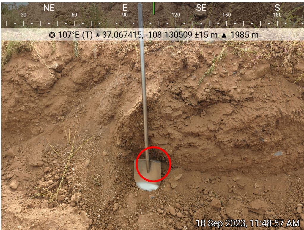
Photo 4: SS02 collected from east sidewall of excavation, 9/18/2023.