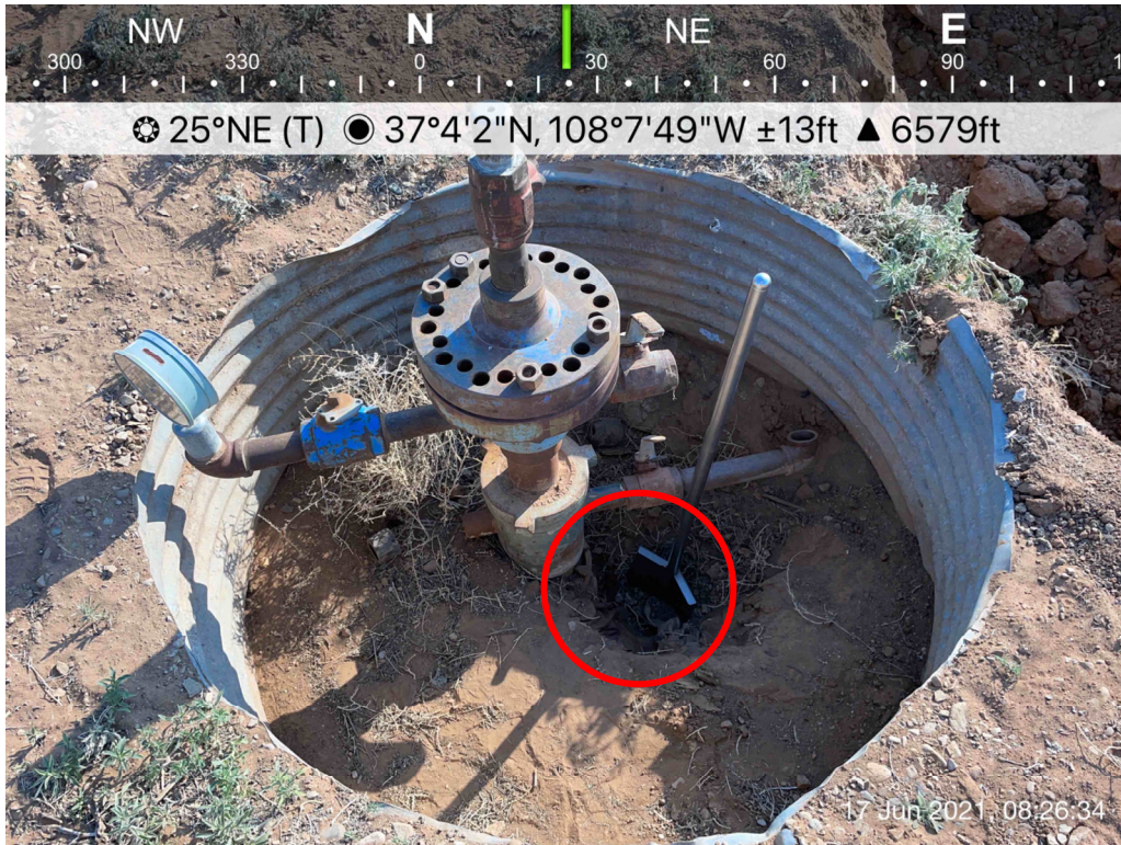
Photo 1: SS01 collected adjacent to Ferguson (OWP) #2F-12Y wellhead, 6/17/2021.