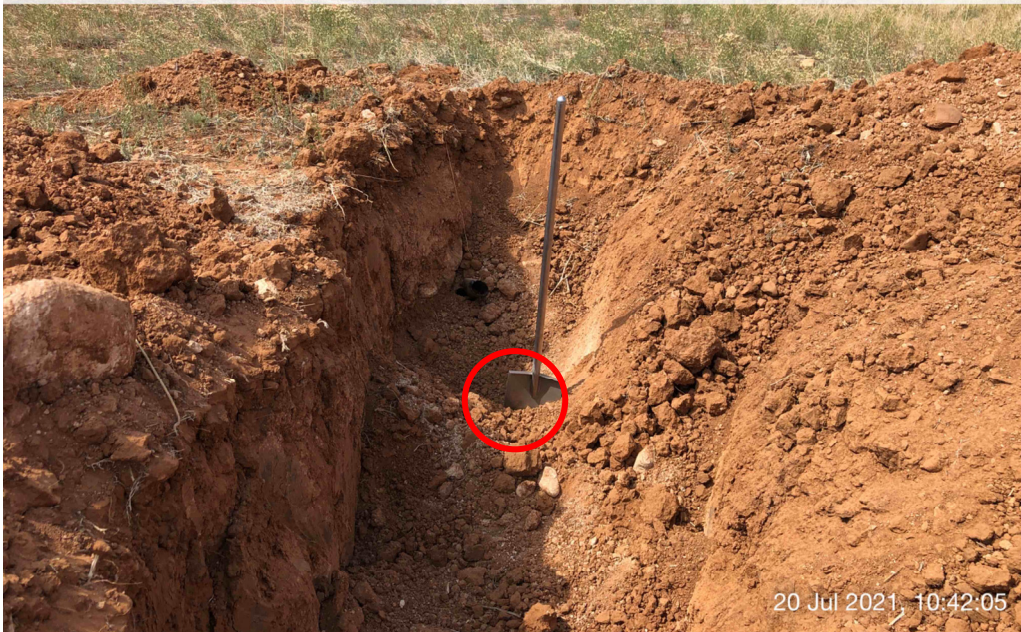
Photo 2: SS02 collected from a flowline segment at the Haun-Delaney (OWP) #1, 7/20/2021.

☀ 210°SW (T) ● 37°6'33"N, 108°7'0"W ±16ft ▲ 6741ft