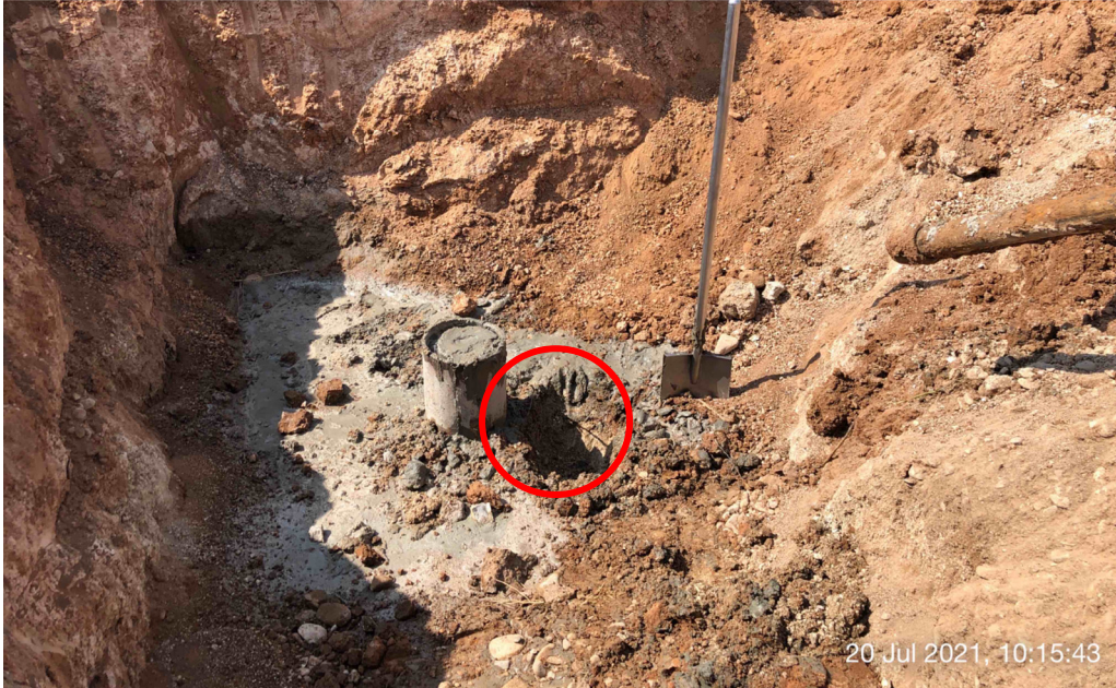
Photo 1: SS01 collected adjacent to Haun-Delaney (OWP) #1 wellhead, 7/20/2021.

☀ 196°S (T) ● 37°6'34"N, 108°7'0"W ±16ft ▲ 6738ft