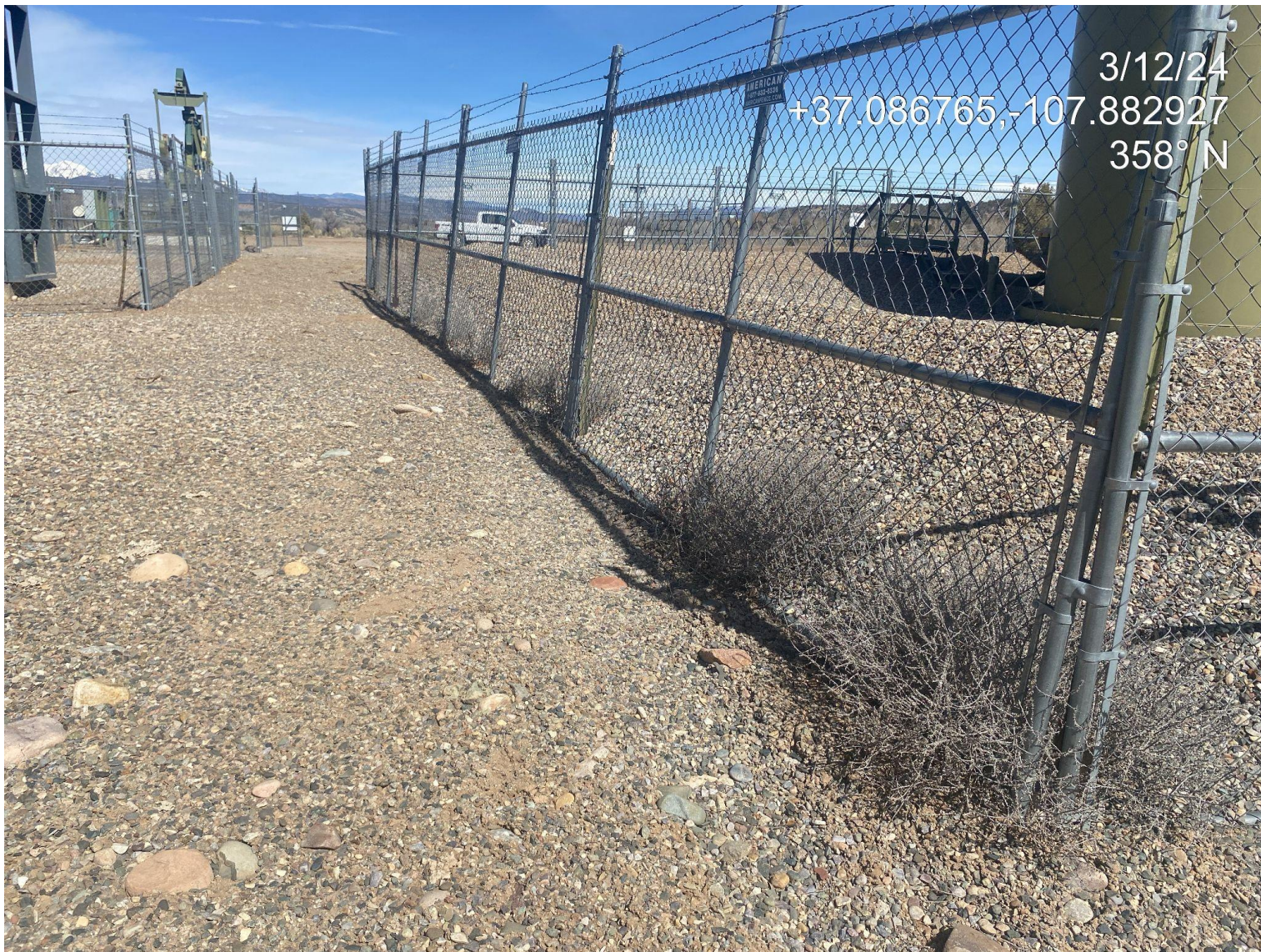
Photo 3. View of weedy kochia debris that remain on location.

Inspection Photos Location Name: Ute C 1, C 3 Location ID: 333788