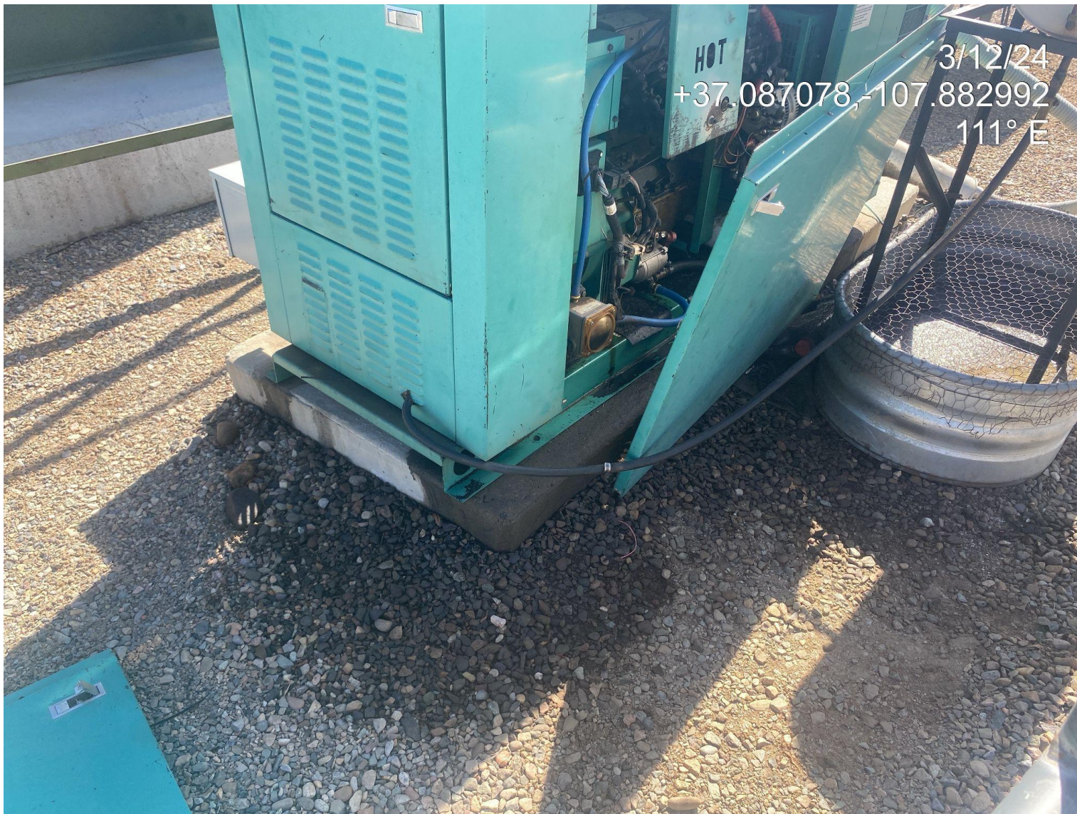
Photo 4. View of impacted surface material at the compressor.

Inspection Photos Location Name: Ute C 1, C 3 Location ID: 333788