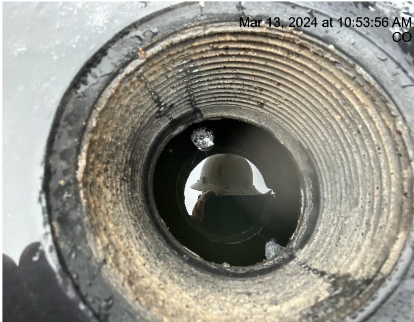
Photo # 9692 Chemical tank containment full of fluid/Failure to maintain chemical BMP/BMP insufficient to contain possible spill.