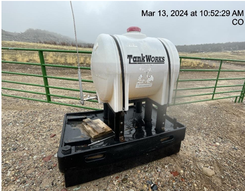
Photo # 9694 Chemical tank & containment are also unused equipment