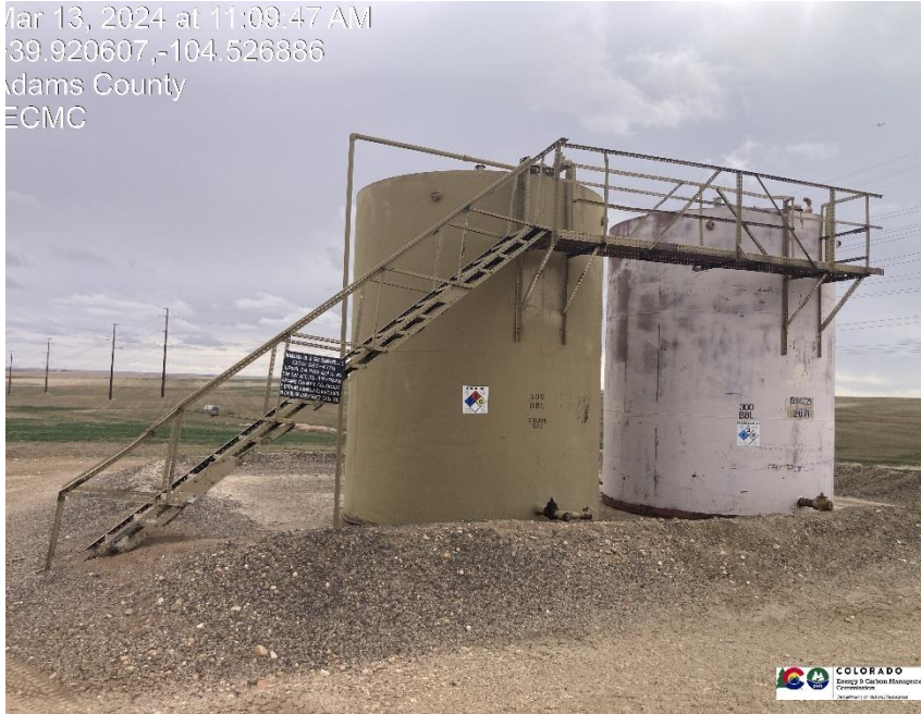
Pic 3 Tanks

Mar 13, 2024 at 11:09:47 AM 39.920607,-104.526886 Adams County ECMC