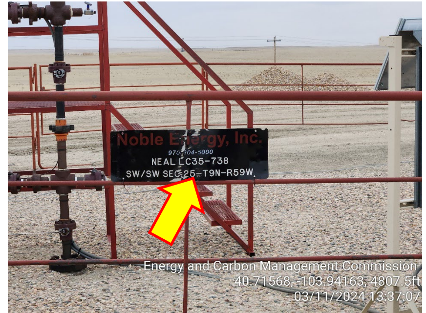
Photo 4 – LC35-738 Wellhead – Section # not adequate – Well PAD is in Section 26 not Section 25