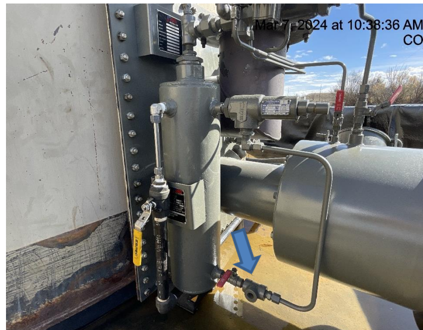
Photo # 9019 PRV vent line does not comply with CECMC pressure safety device rules & also terminates in an unsafe manner

Photo # 9018 PRV vent line does not comply with CECMC pressure safety device rules & also terminates in an unsafe manner