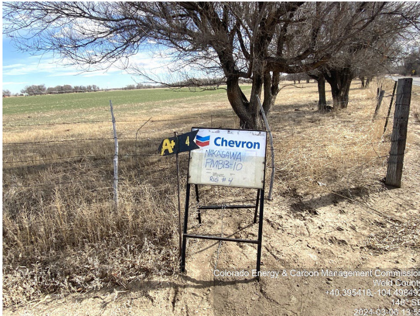
Photo #3 Nakagawa PM B 13-10 Wellsite Plugged & Abandoned | PA Plugging Ops; Workover: initial plug Wellsite entrance