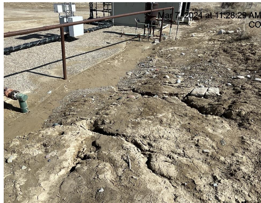
Photo # 9063 Failure to minimize erosion & transport of sediment onto location/insufficient BMP's