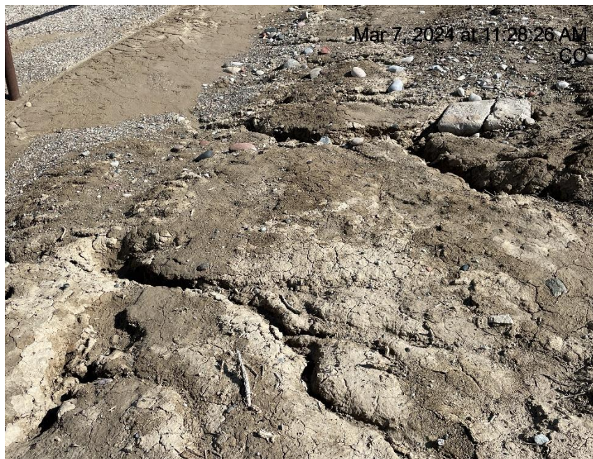
Photo # 9062 Failure to minimize erosion & transport of sediment onto location/insufficient BMP's