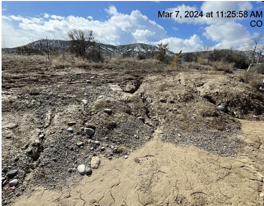
Photo # 9060 Failure to minimize erosion & transport of sediment onto location/insufficient BMP's