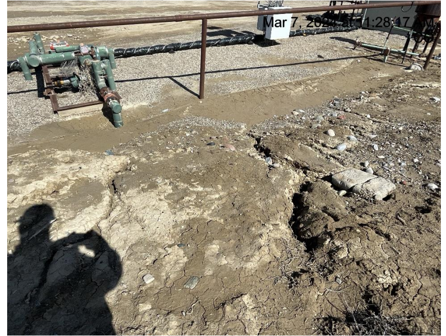
Photo # 9061 Failure to minimize erosion & transport of sediment onto location/insufficient BMP's