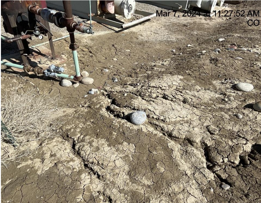
Photo # 9064 Failure to minimize erosion & transport of sediment onto location/insufficient BMP's