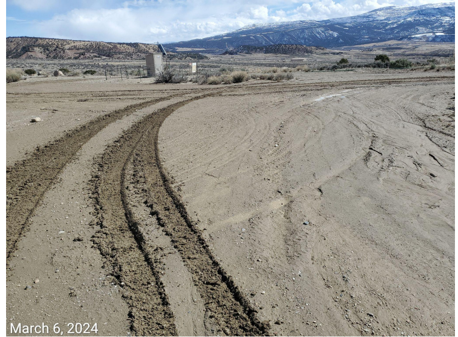
Photo 1: Photos taken from the west end of the Location. Photos provide an overview of the Location from east to southeast. Photos examples showing Stormwater and erosion control BMPs remain missing or insufficient; working pad surface lacks stabilization; tracking and erosion degradation observed.