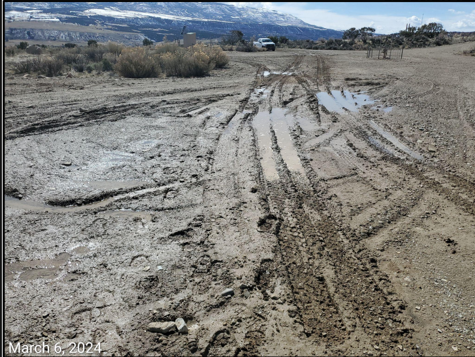
Photo 2: Photos right from the 4/25/2023 inspection #708900354, and show erosion degradation and tracking at the working pad surface. Photo left taken 3/6/2024 taken from the same area as photos right, and show BMPs to stabilize the working pad surface had not been installed or maintained; degradation and tracking has persisted.

Inspection P Operator Name: TEP ROCKY M Location ID: