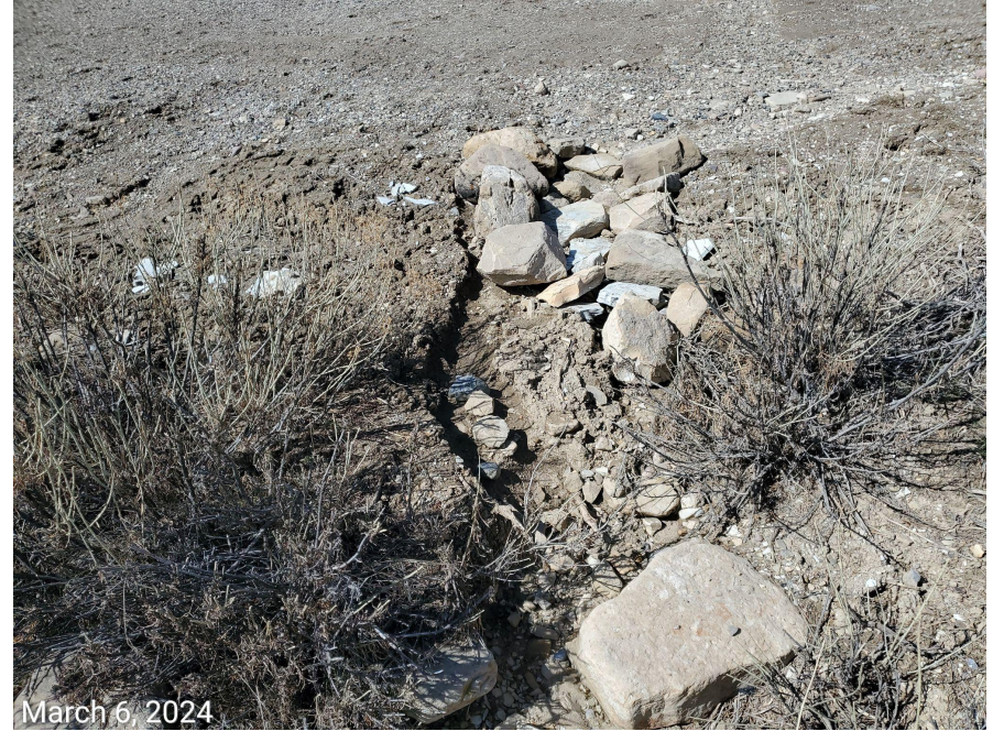
Photo 3: Photo taken from the edge of the working pad surface on the south end of the Location. Photos show operator has implemented rip-rap material within areas where stormwater runoff is resulting in erosion degradation; outlet has not been installed per good engineering practices or maintained in proper functioning condition; erosion degradation has persisted in these areas.