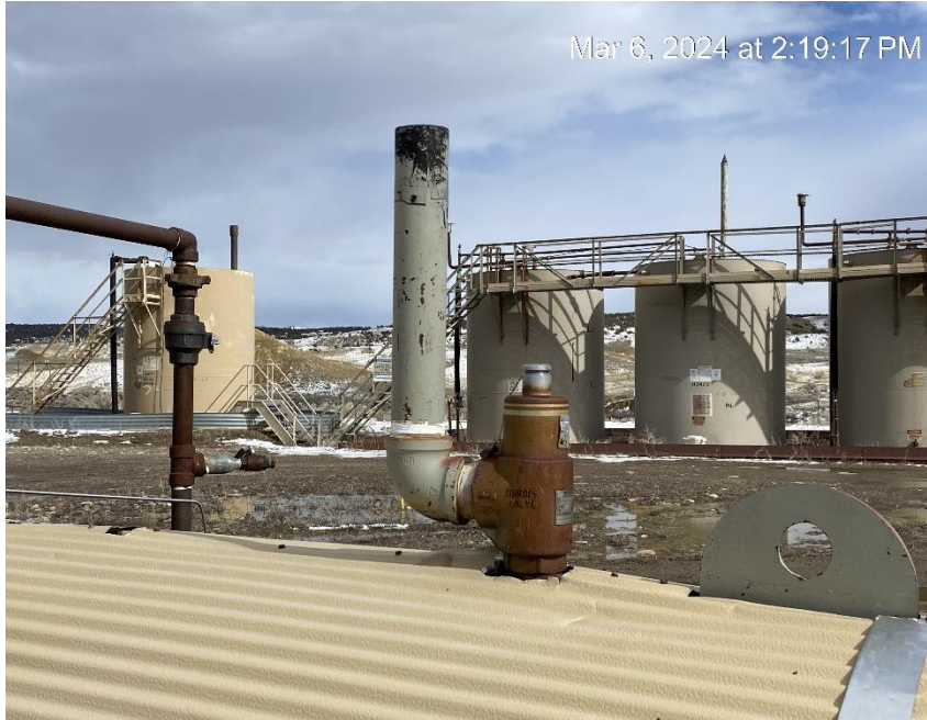
Missing riser rain protection