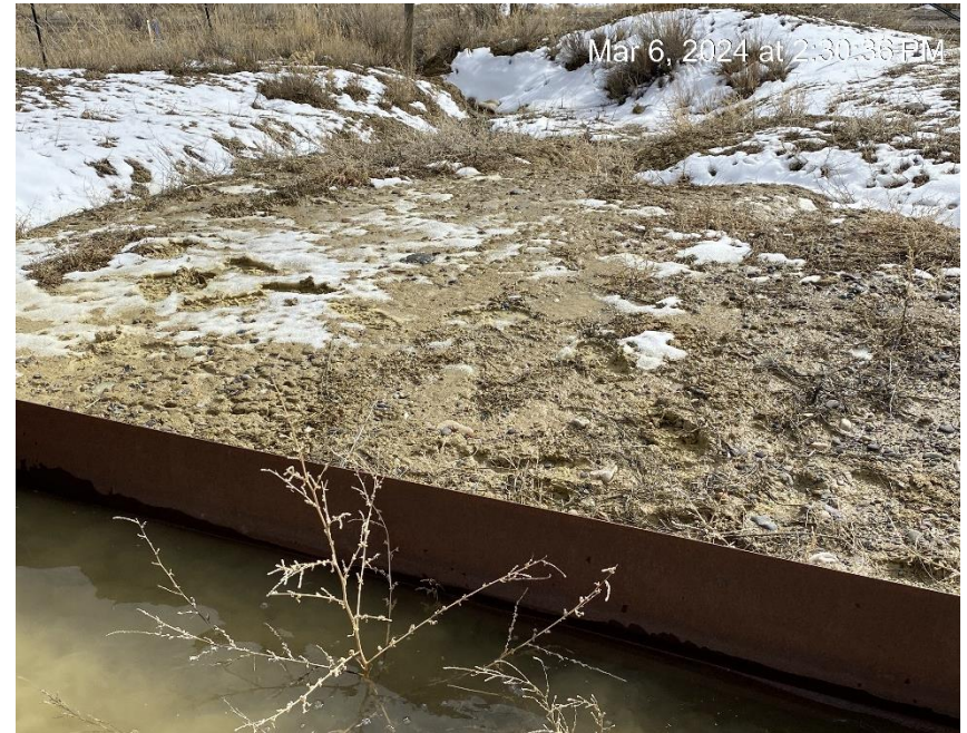
Erosion and sediment migration