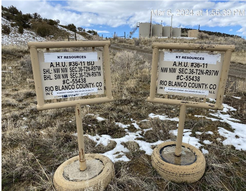
When replaced additional information is required