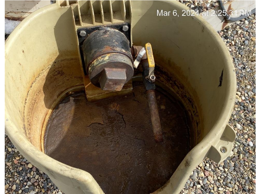
Open end load line. Valve left open