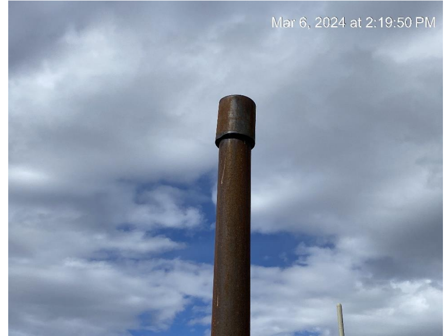
Unable to verify bird protection