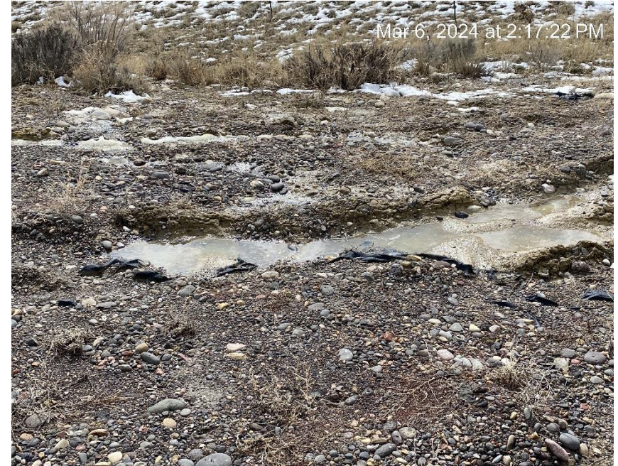
Erosion and sediment migration