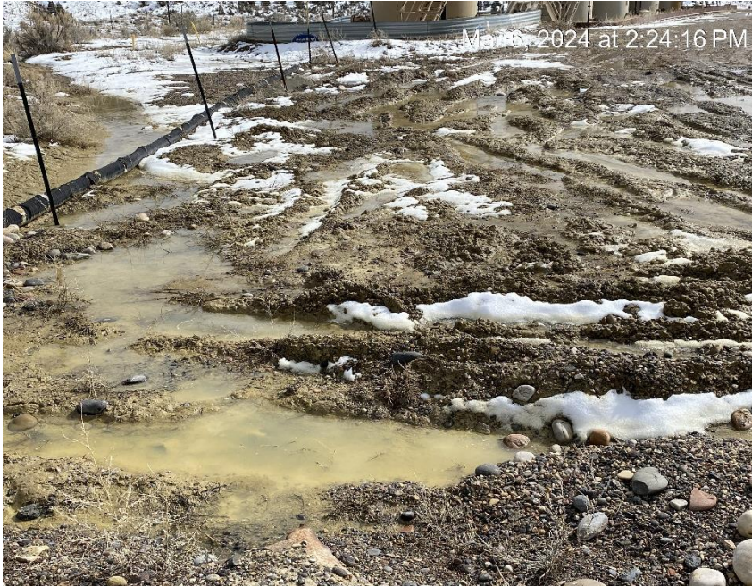
Lack of compaction and stabilization