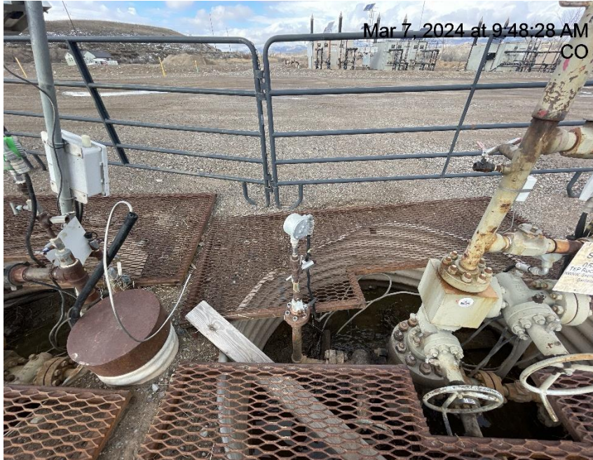
Photo # 8989 Cellar not properly covered/wildlife & personnel hazard