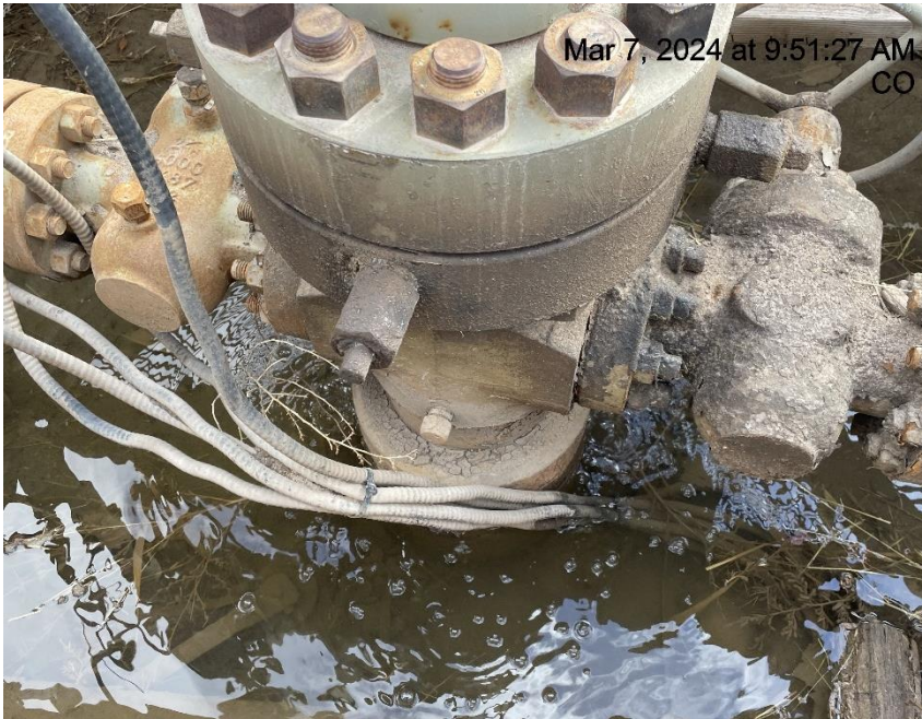
Photo # 8983 Possible wellhead leak/gas bubbling up around wellhead through water in cellar