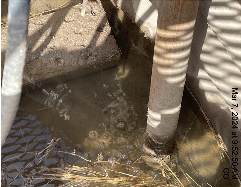
Photo # 8985 Possible leak/gas bubbling up through water in cellar around bradenhead line