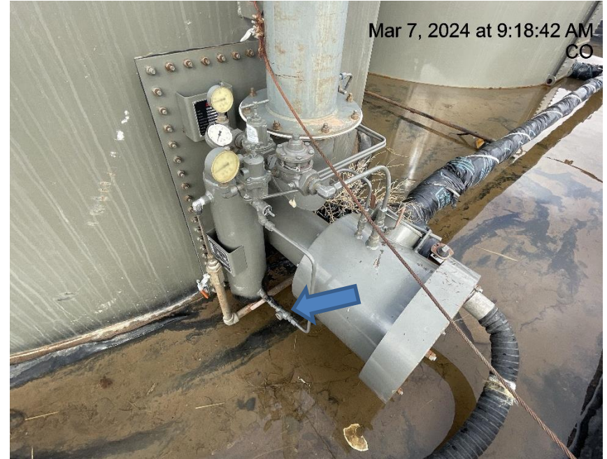
Photo # 8990 PRV vent line terminates in an unsafe manner/does not comply with CECMC pressure safety device rules & general safety rules