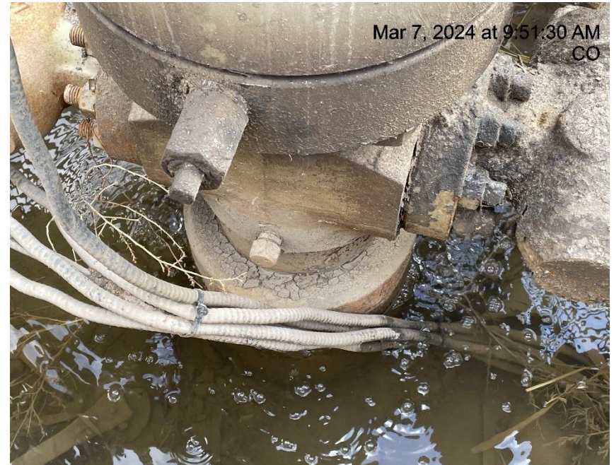
Photo # 8984 Possible wellhead leak/gas bubbling up around wellhead through water in cellar