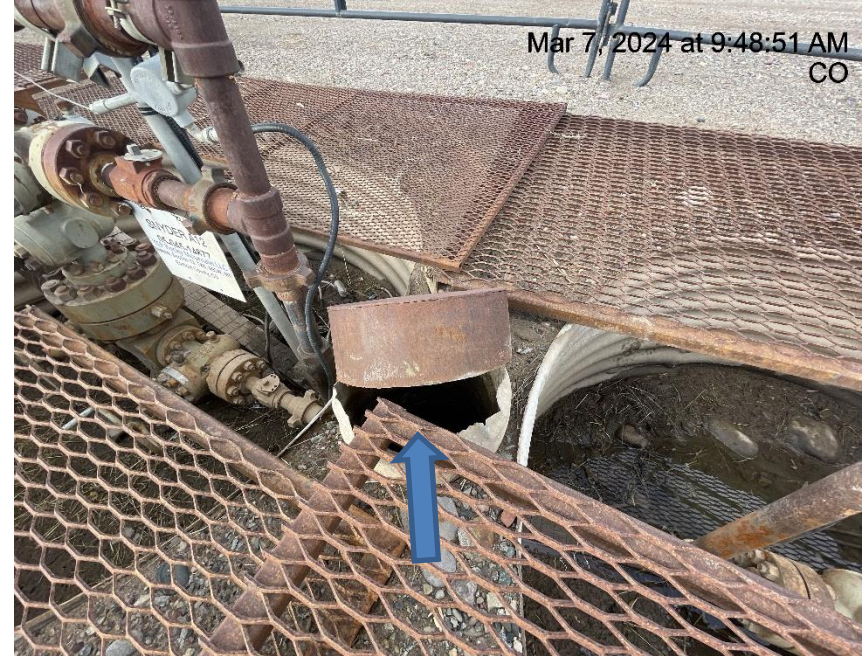
Photo # 8986 Mouse hole not properly covered & open to entry by wildlife/wildlife hazard