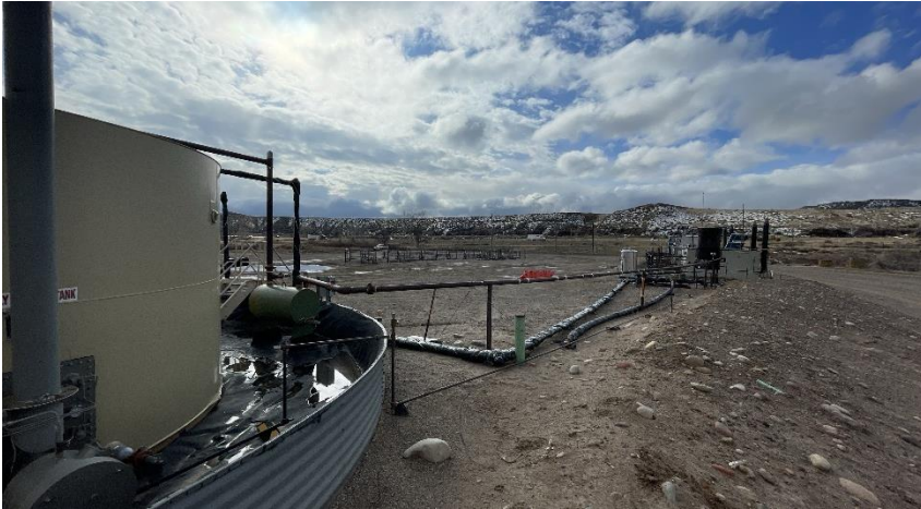
North West corner of location.