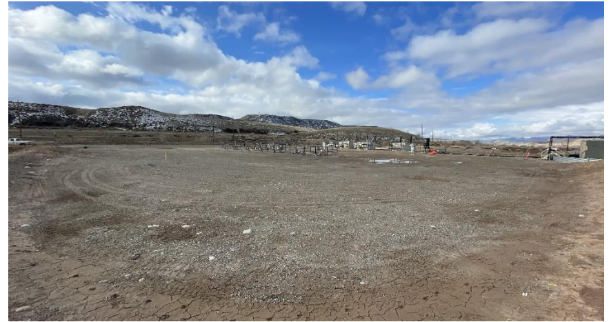
North East corner of location.