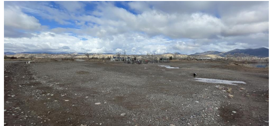
South East corner of location.