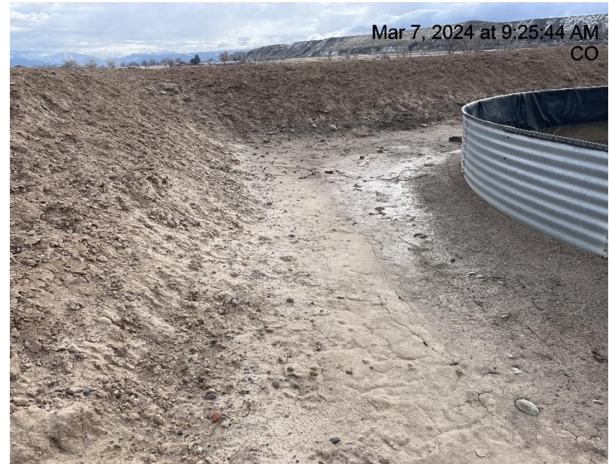
Photo # 9008 Erosion & transport of sediment onto location/insufficient BMP's