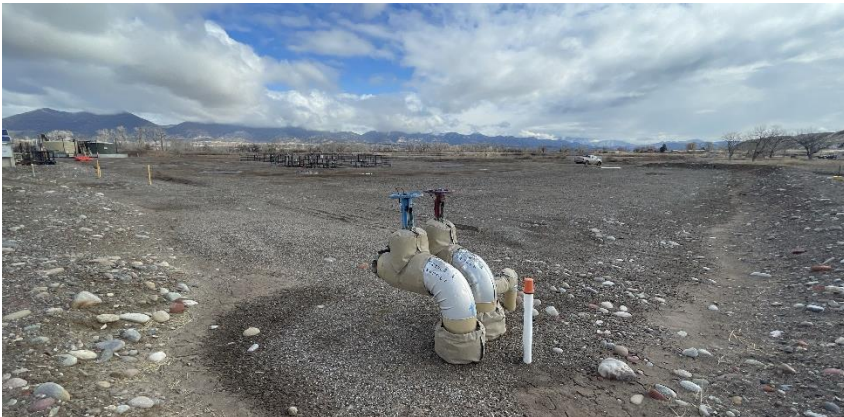
South West corner of location.