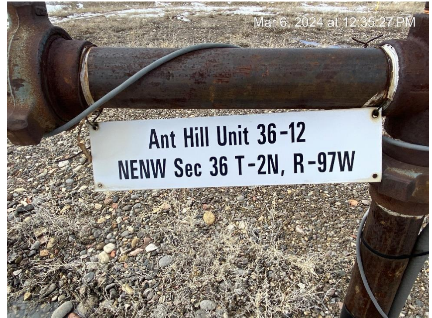
As signs are replaced additional information is required