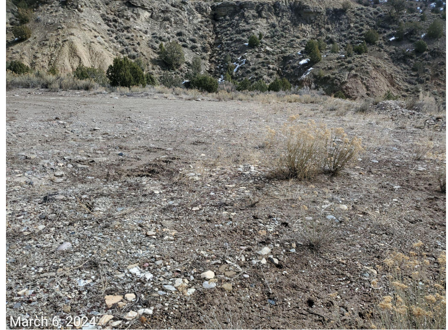
Photo 3: Photos taken from the southend of the well pad, facing northeast and east. Photos examples showing areas on the south end of the well pad Location not reasonably needed for production. Areas require reclamation pursuant to 1003 rules.