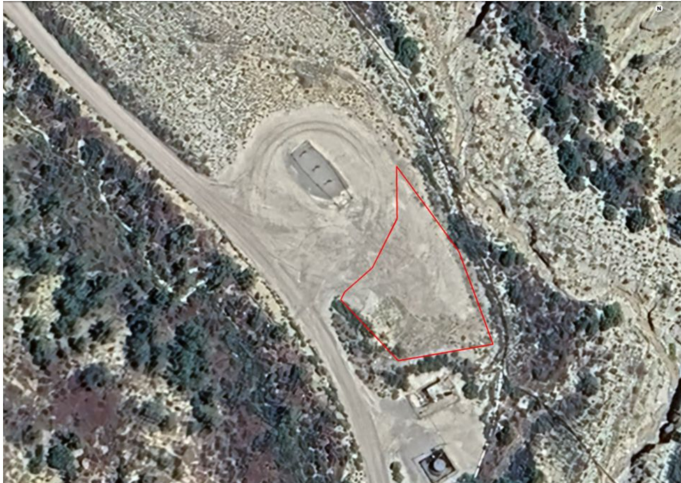
Photo 4: Google Earth aerial image. Red polygon represent approximate areas of the well pad not reasonable necessary for production activities.