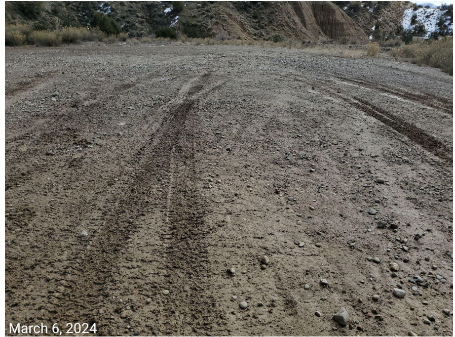
Photo 1: See comments under photo 1. Photo right also example showing areas of the southern well pad not reasonable needed for production.