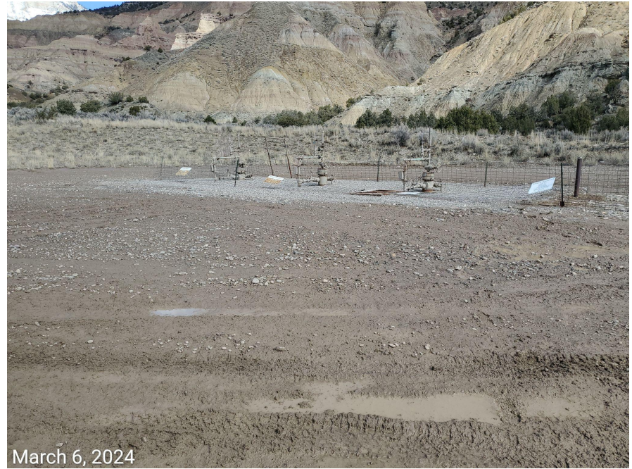
Photo 1: Photos 1-2 taken from the east end of the well pad. Photos provide an overview of the location from northwest, north, northeast to southeast.