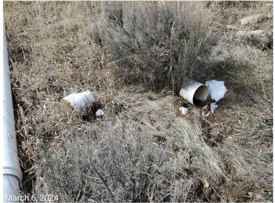
Photo 7: Photos taken from the east end of the Location. Photos examples showing various trash debris observed along unused pipe.