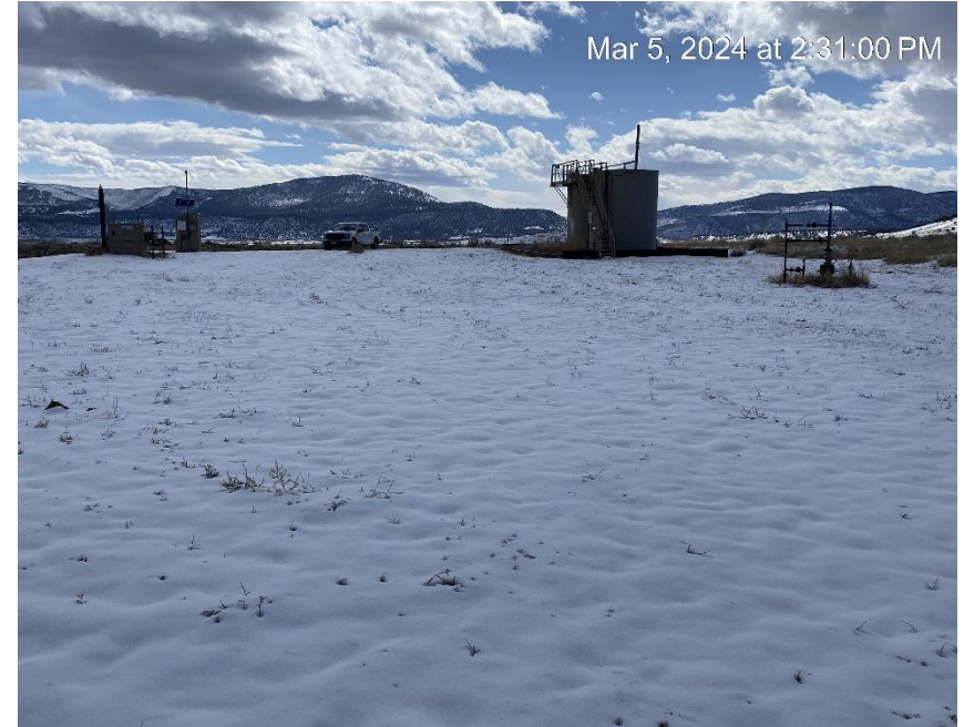
Location from Northeast corner