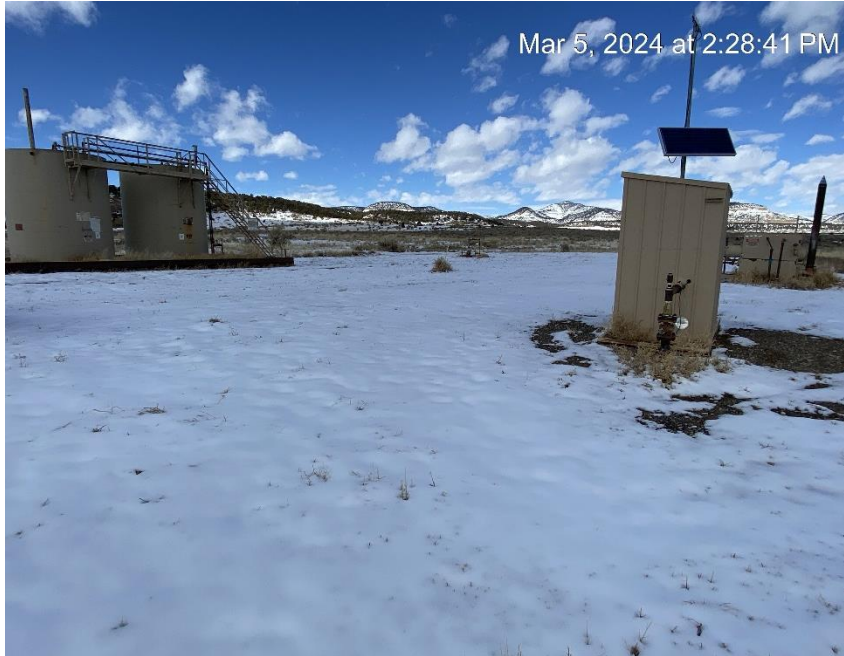
Location from Southeast corner