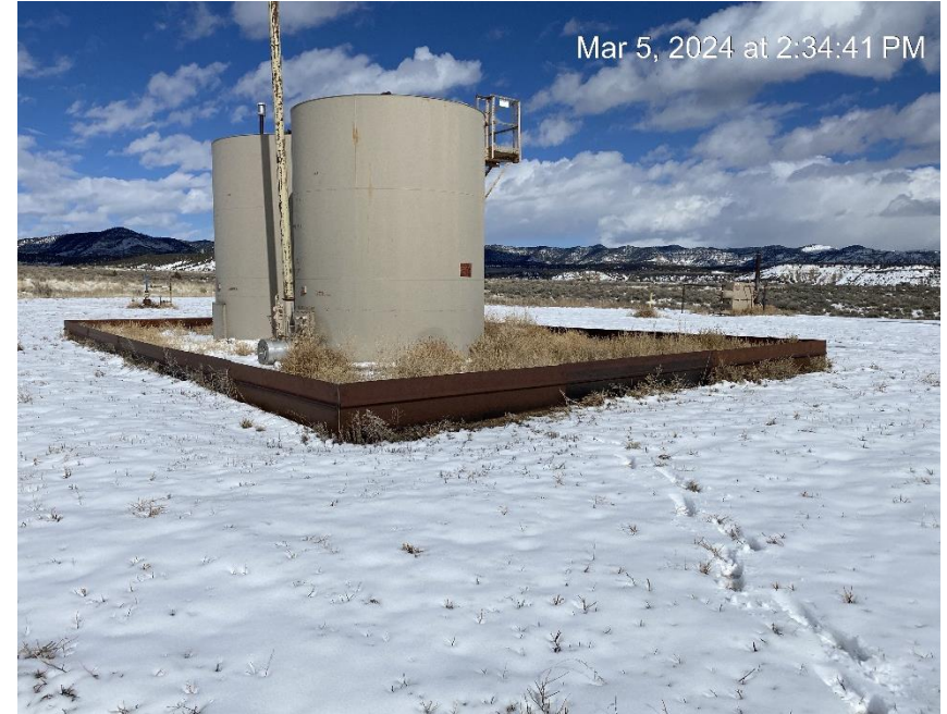
Location from Southwest corner