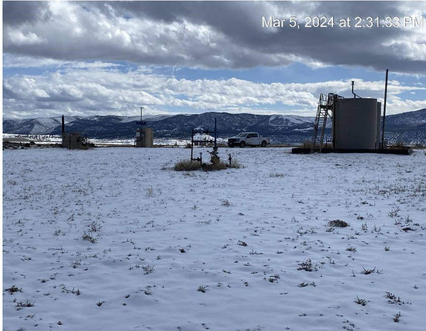
Location from Northwest corner