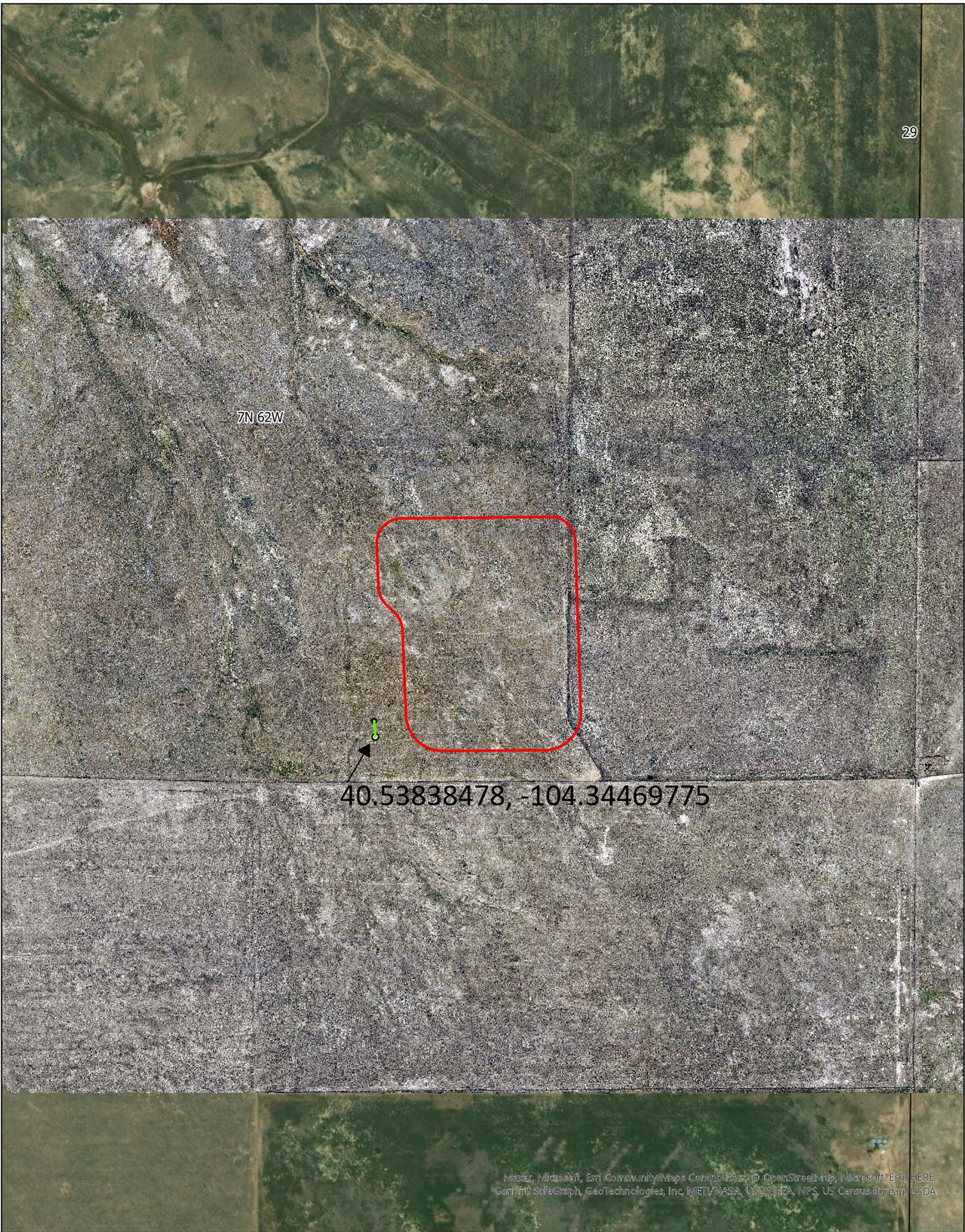
REFERENCE AREA MAP FIGURE 2