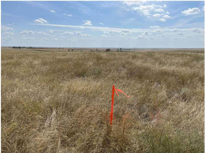
VIEW 4 – SOUTHEAST