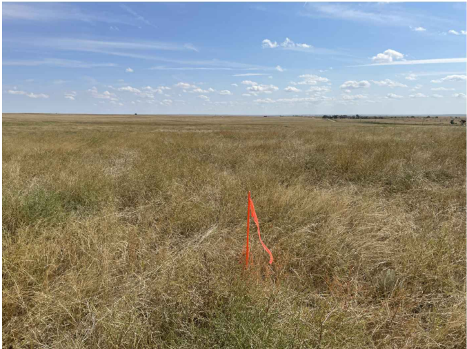
VIEW 3 – EAST