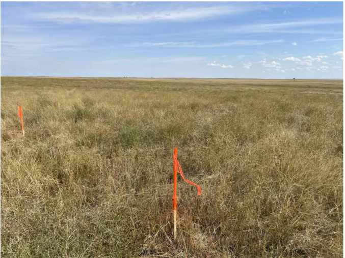
VIEW 2 – NORTHEAST