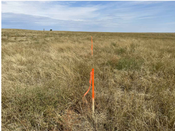
VIEW 1 – NORTH

Q: SW/4 SECTION: 33 TOWNSHIP: 7N RANGE: 62W 6TH. P.M. WELD COUNTY, CO DATE: 9/14/2023