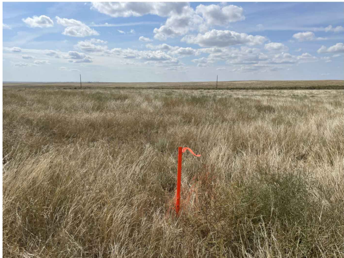
VIEW 5 – SOUTH