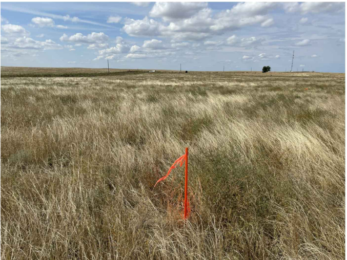
VIEW 6 – SOUTHWEST