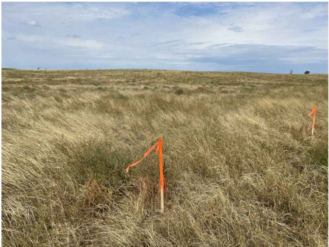
VIEW 8 – NORTHWEST