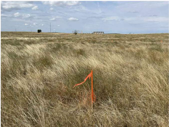
VIEW 7 – WEST