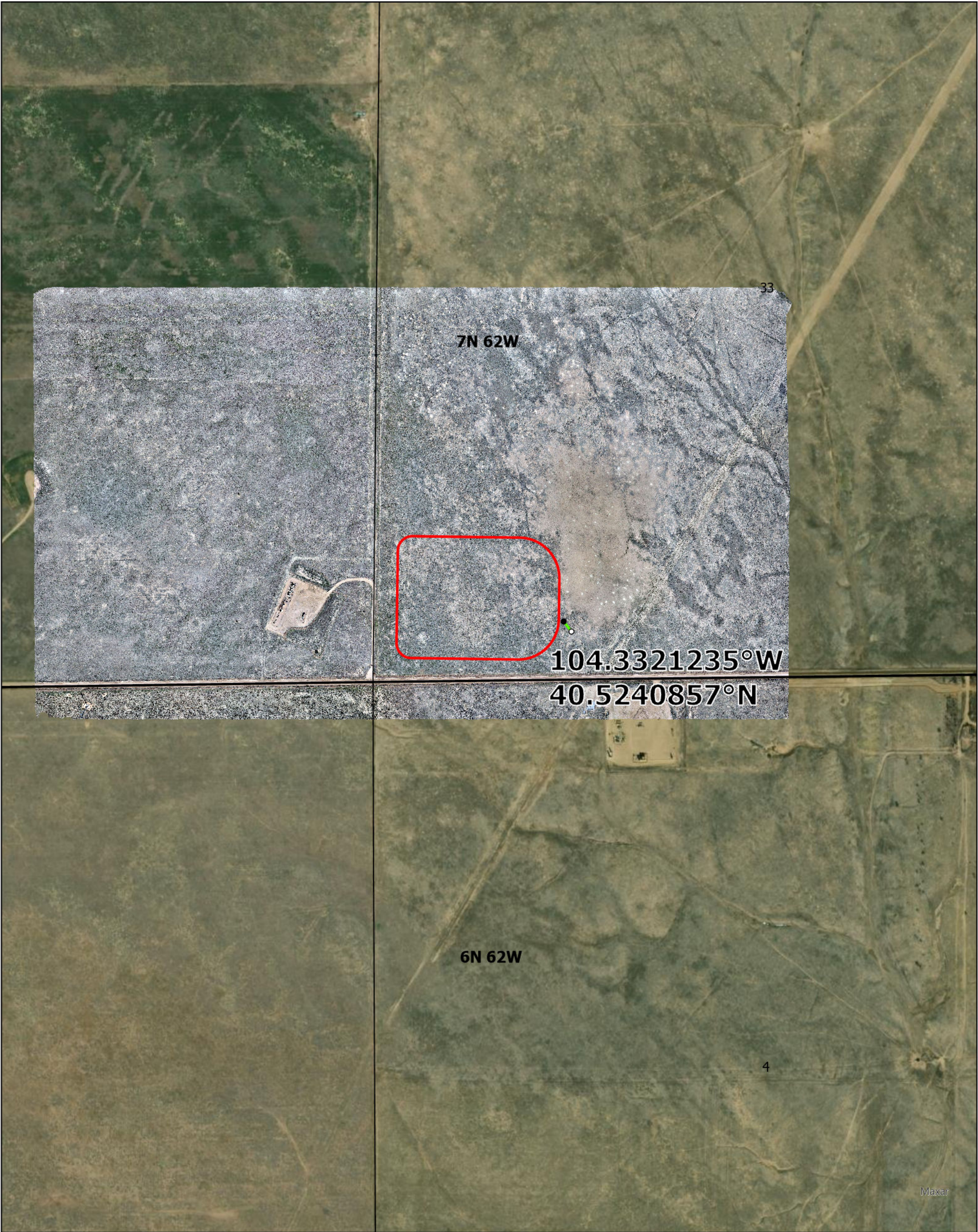
REFERENCE AREA MAP FIGURE 2