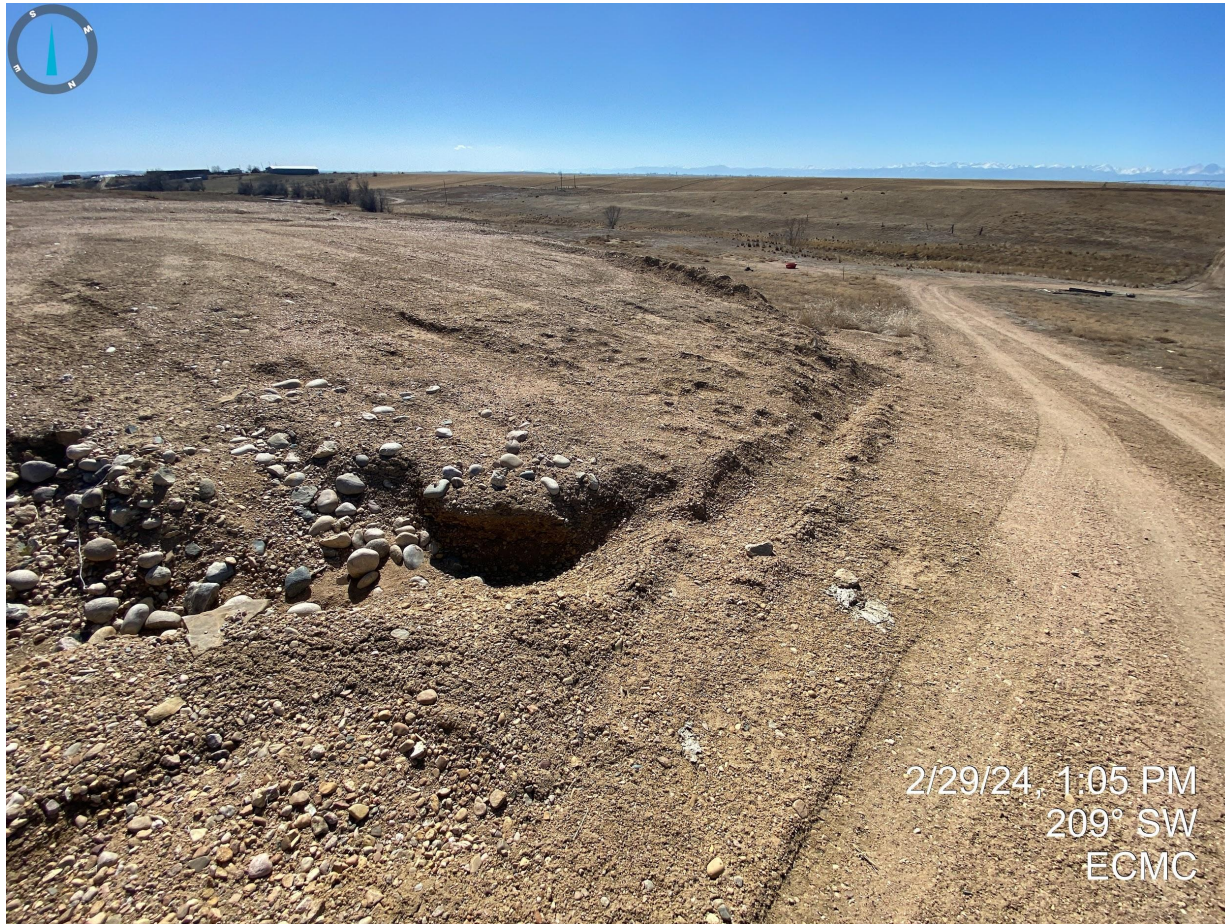
Photo 1. Gully erosion on the north side of the former tank battery location.