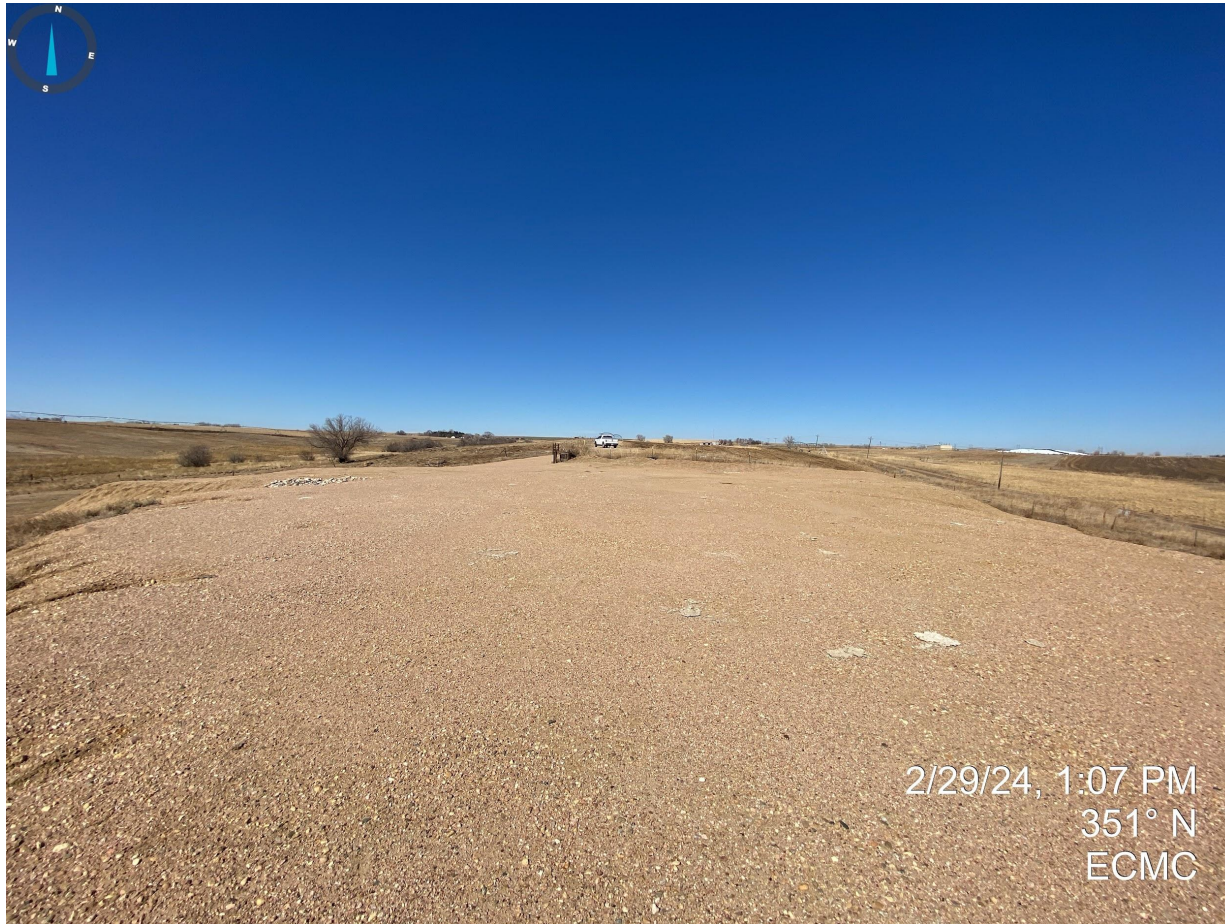
Photo 7. Taken from the southern end of the former tank battery location. The location does not appear to have been reclaimed per Rule 1004.