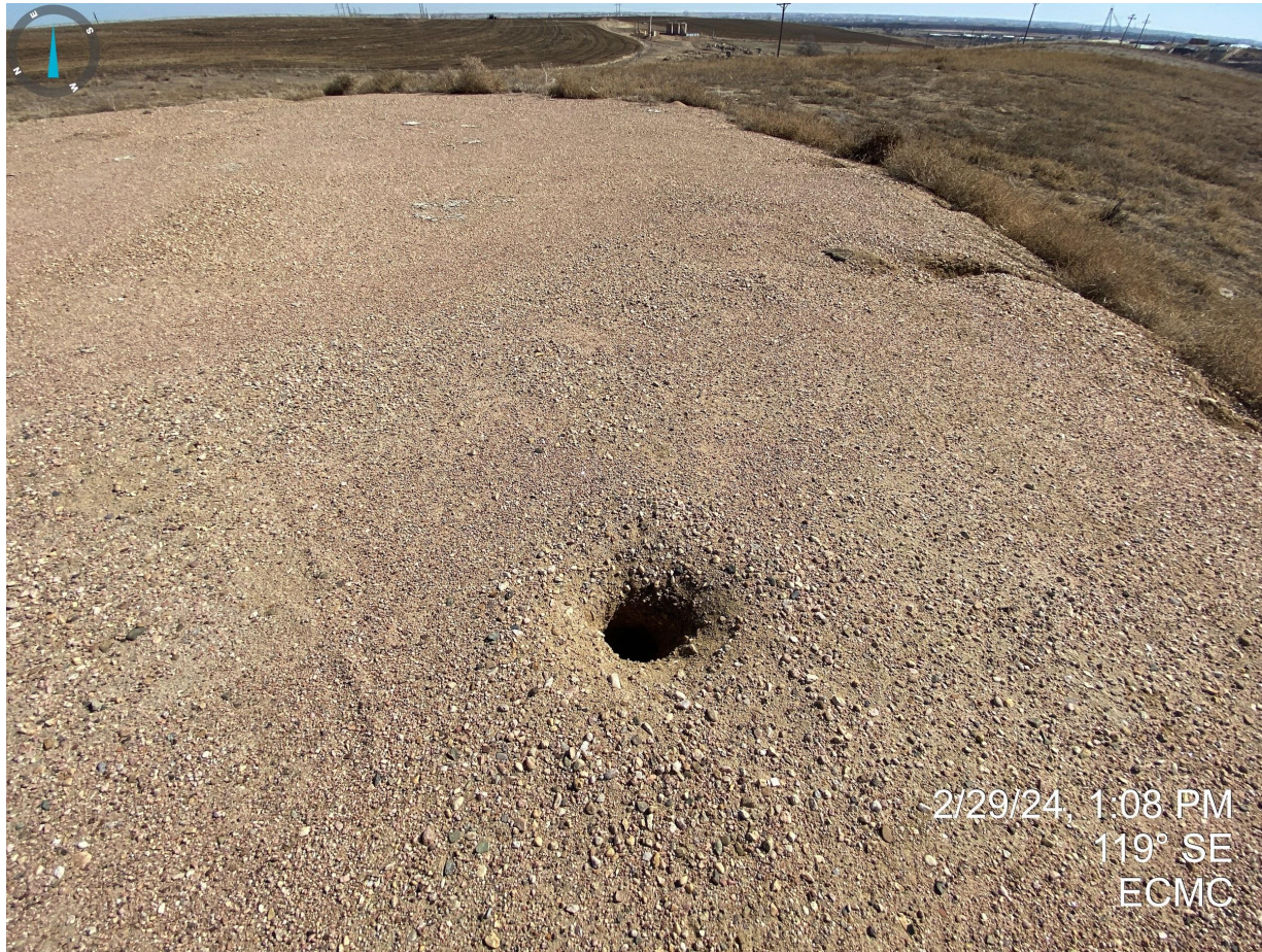
Photo 9. Mouse/rat holes not backfilled, located on the southwest portion of the location.