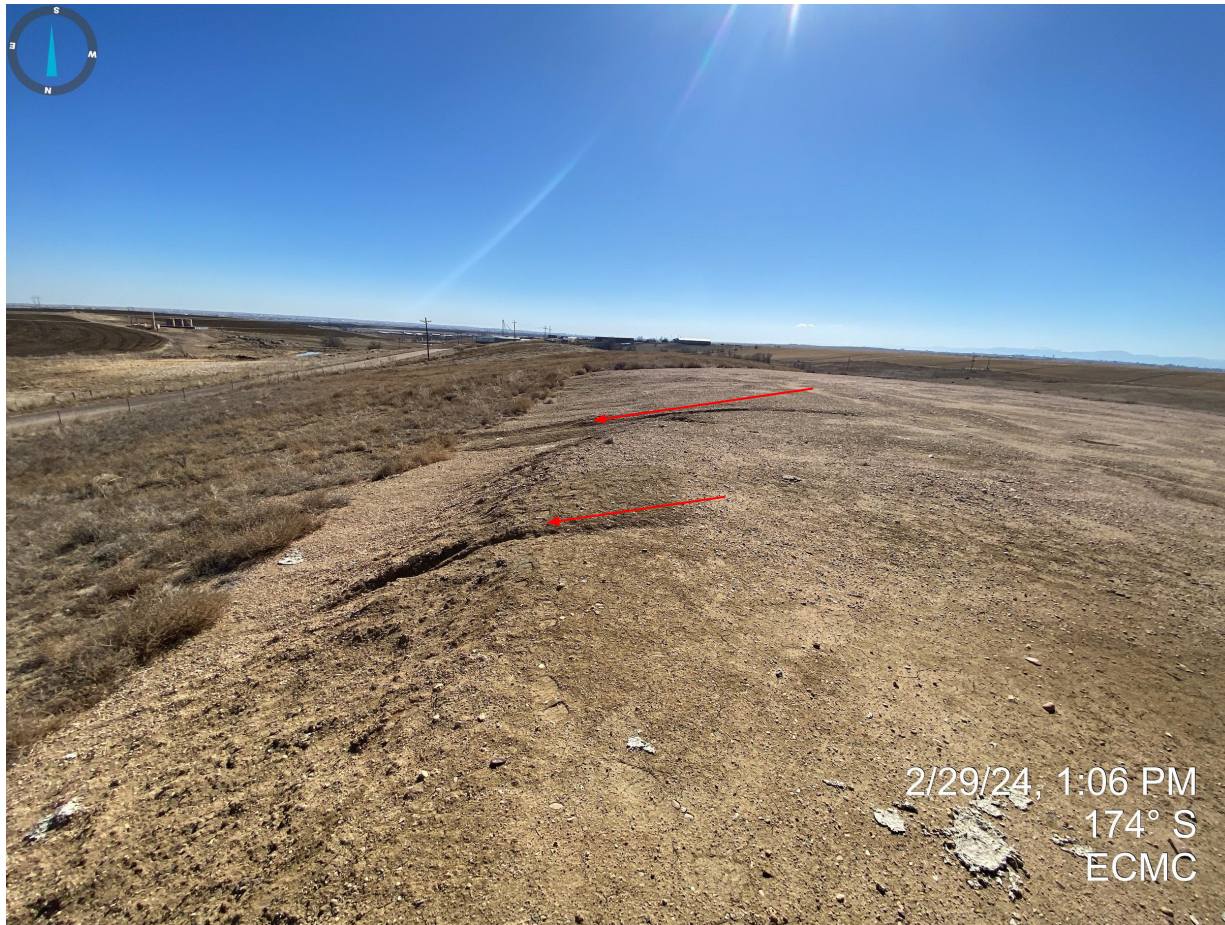
Photo 3. Eastern side of the former tank battery location. Erosion degradation pictured.