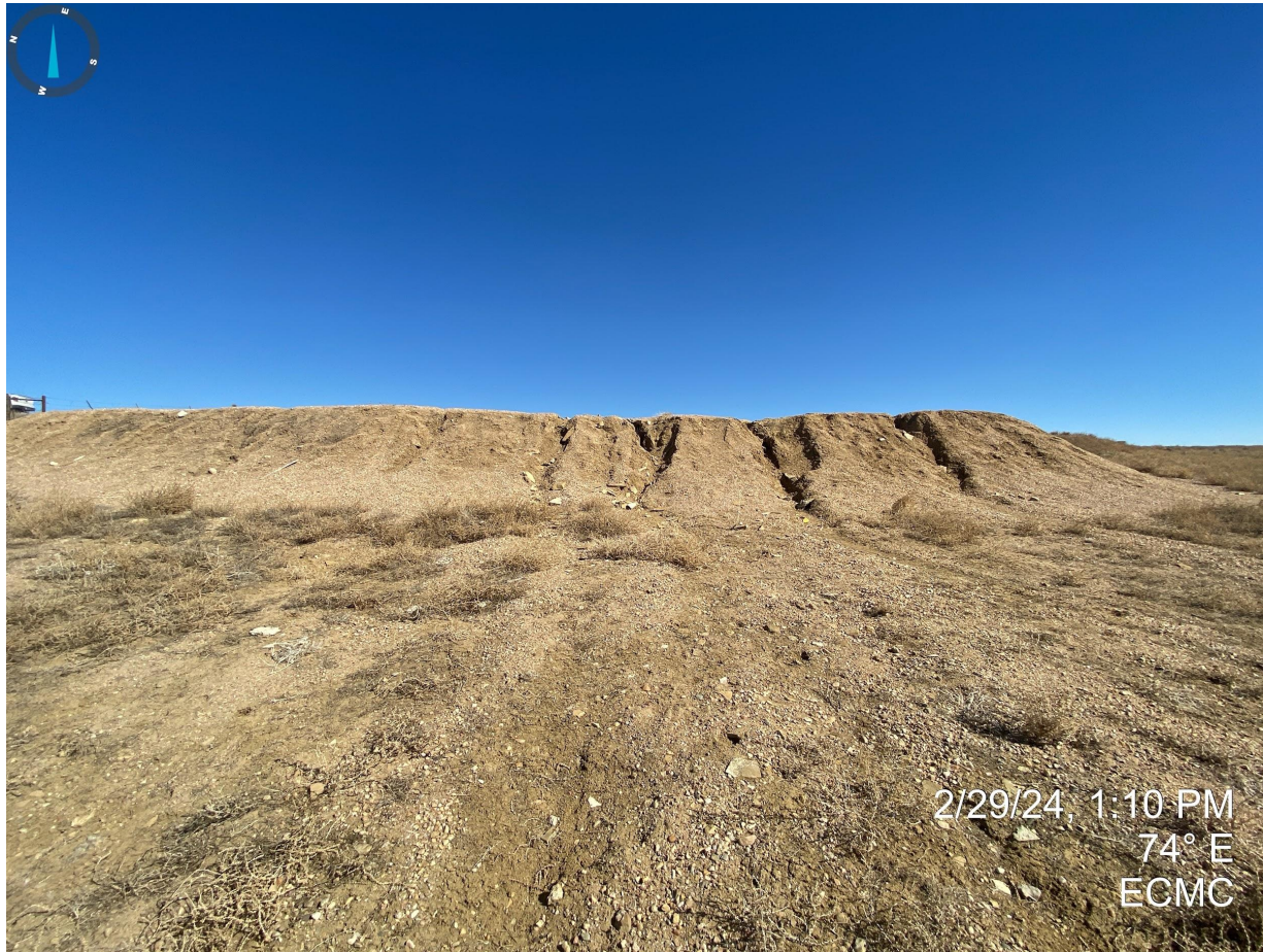
Photo 13. Erosion degradation occurring on the western portion of the location.