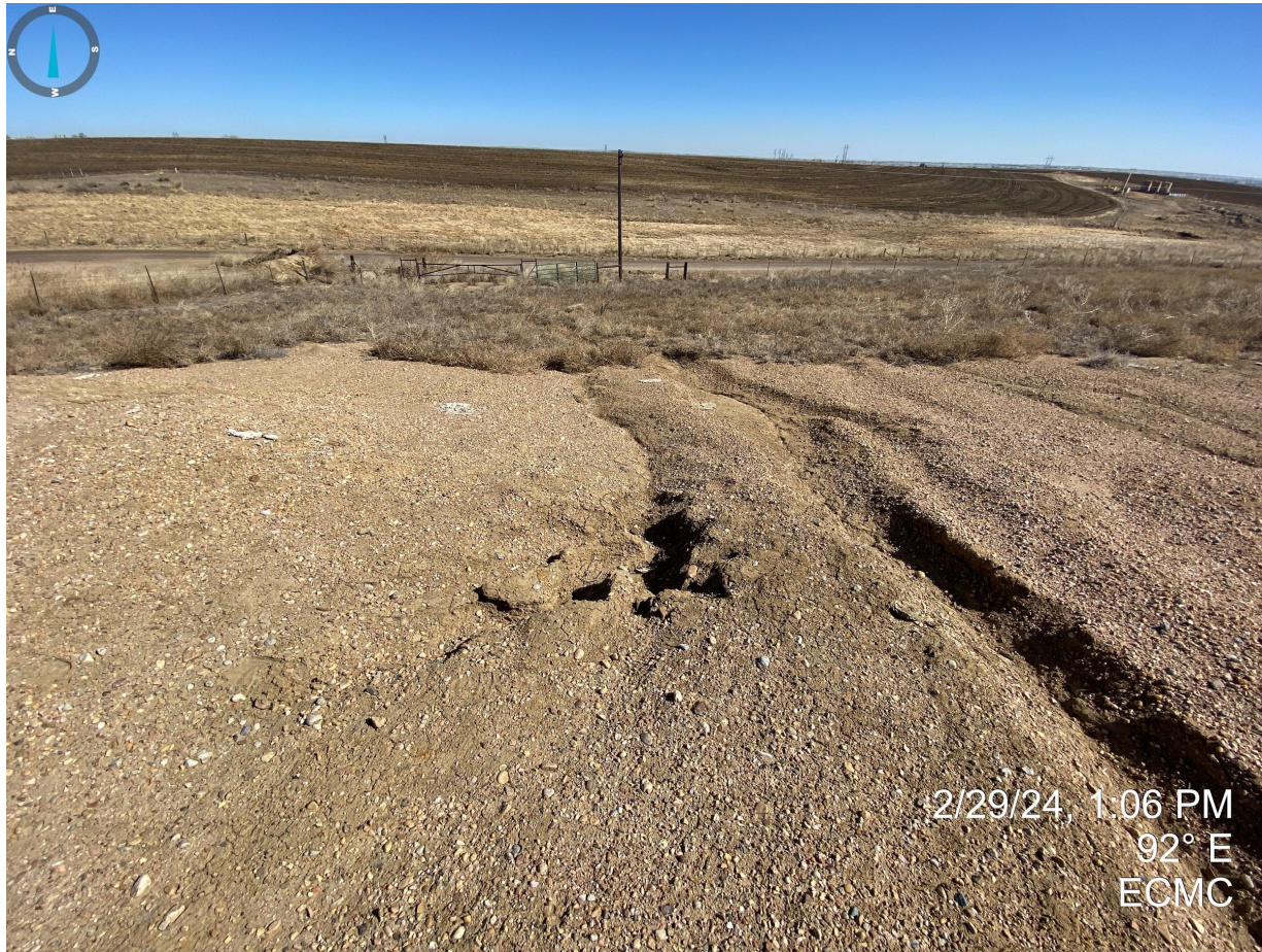
Photo 5. Close up of erosion degradation on the east side of the location.