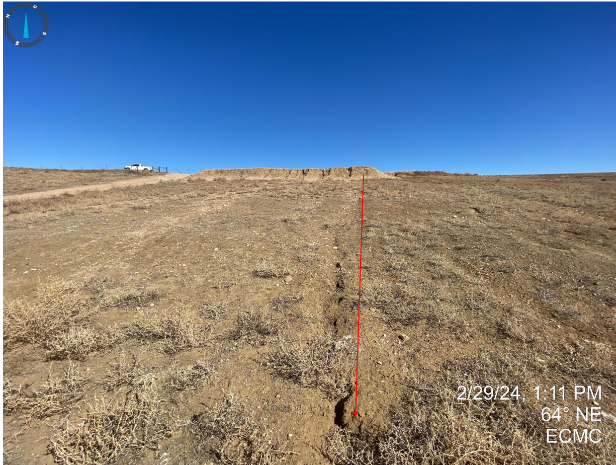
Photo 14. Taken feast of the former location. Erosion degradation occurring outside of the permitted location will need to be properly stabilized and repaired.