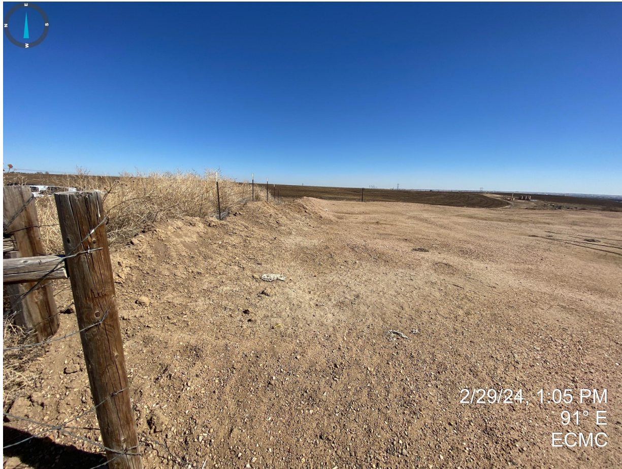
Photo 2. The former tank battery does not appear to have been reclaimed per Rule 1004.