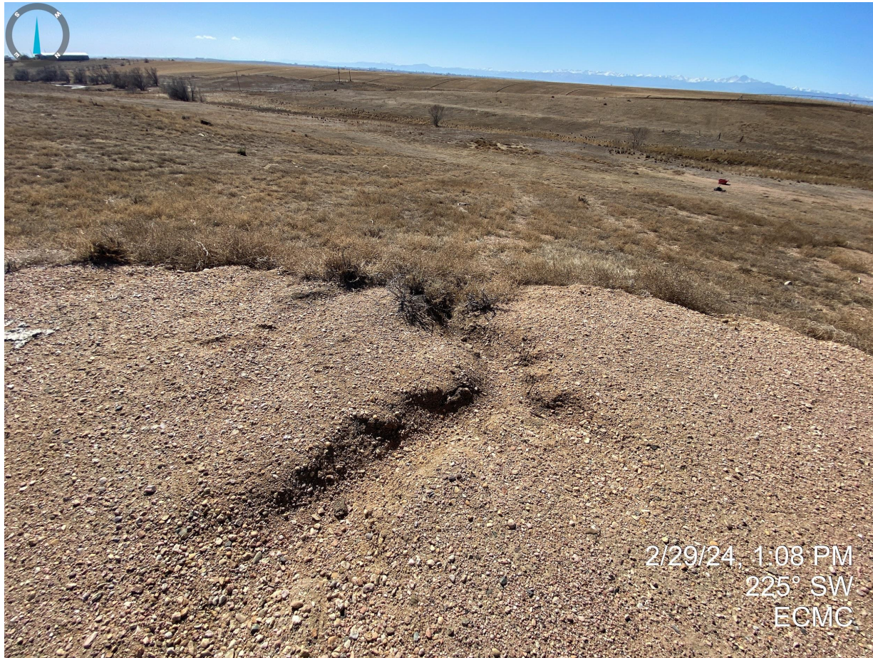
Photo 8. Erosion degradation occurring on the southwest corner of the location.