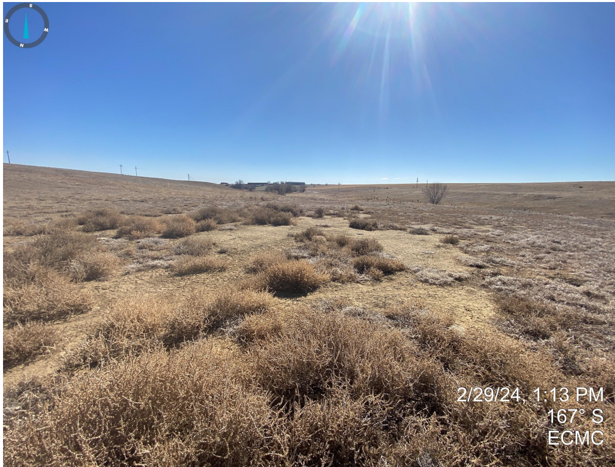
Photo 16. Taken from the northern portion of the former well location. It does not appear the well location has been reclaimed per Rule 1004 with evidence of bare soils and undesirable vegetation.