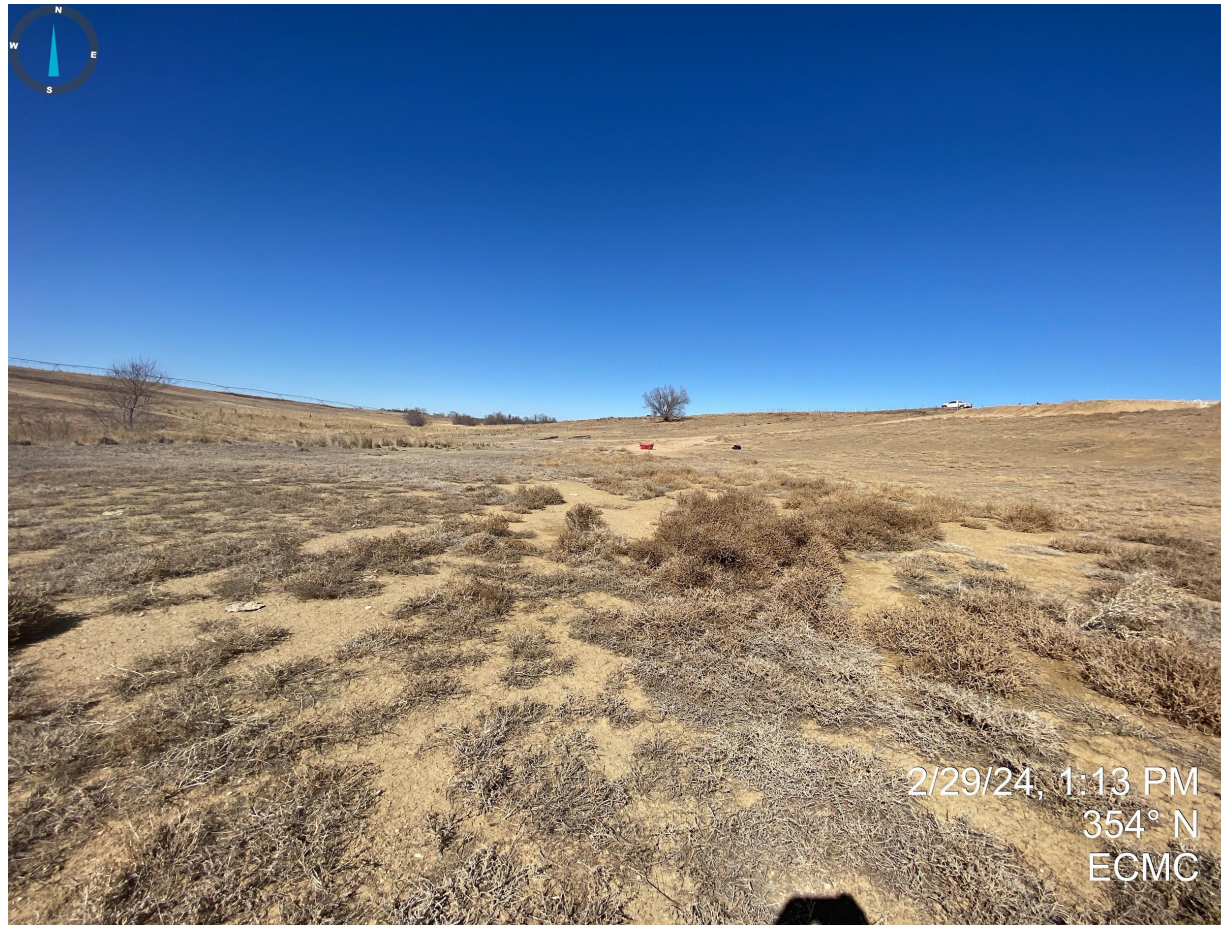
Photo 17. Taken from the southern portion of the former well location; see comments in Photo 16.