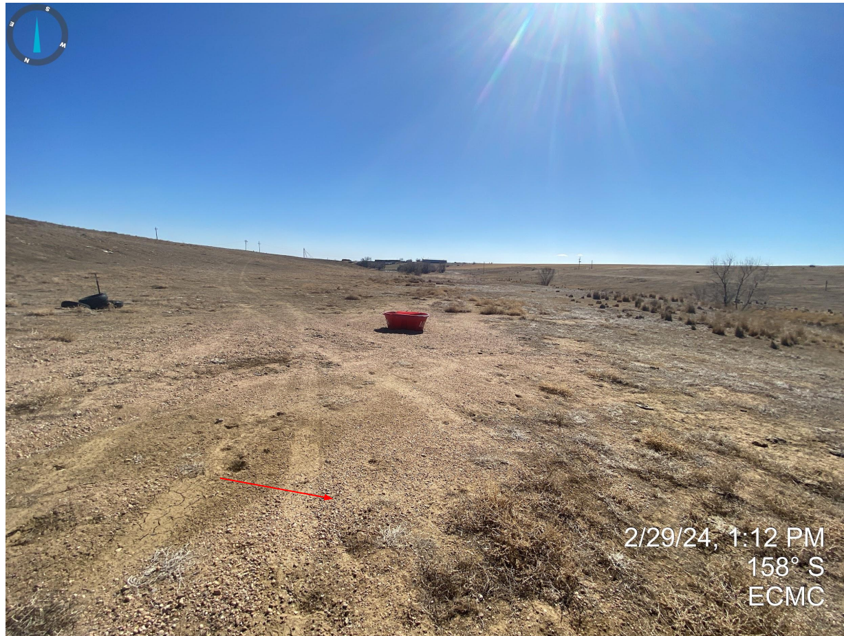
Photo 15. Road base material observed within the former access road footprint.