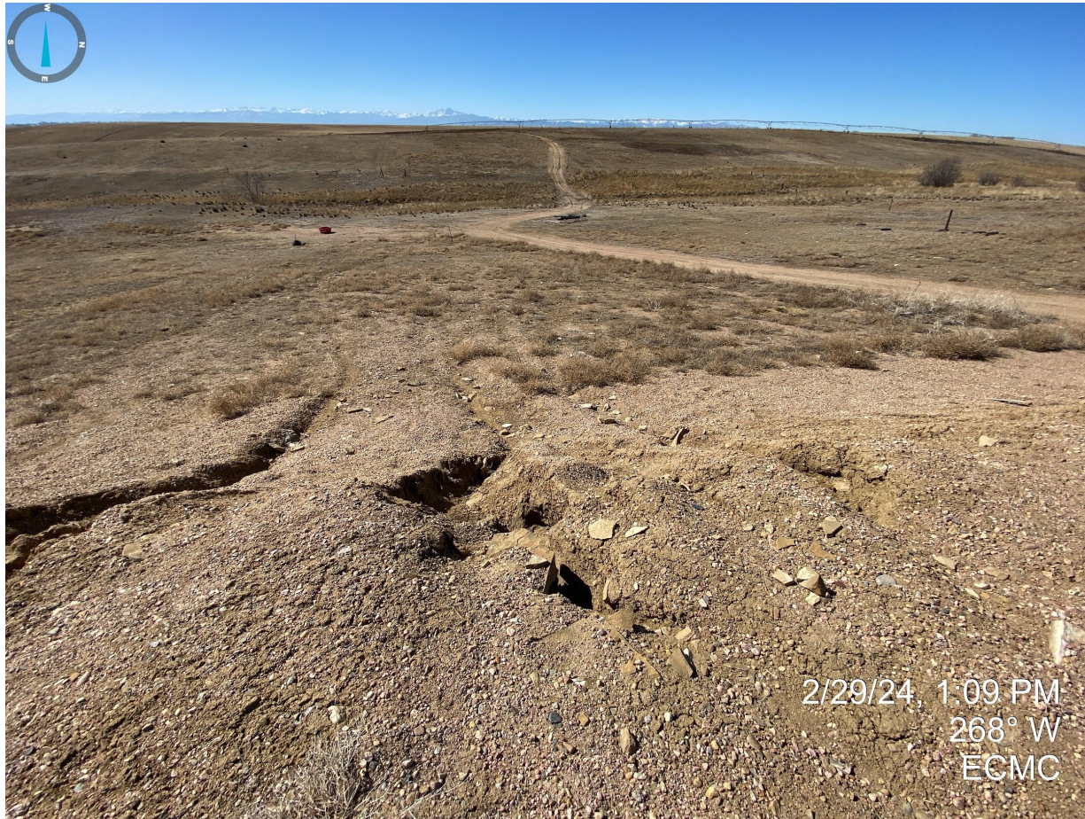
Photo 12. Continued from Photo 11. Erosion degradation occurring on the western portion of the location.