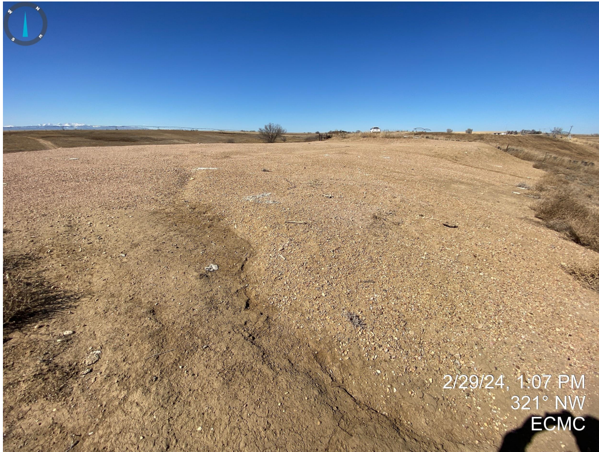
Photo 6. Erosion degradation occurring on the southeast corner of the location.