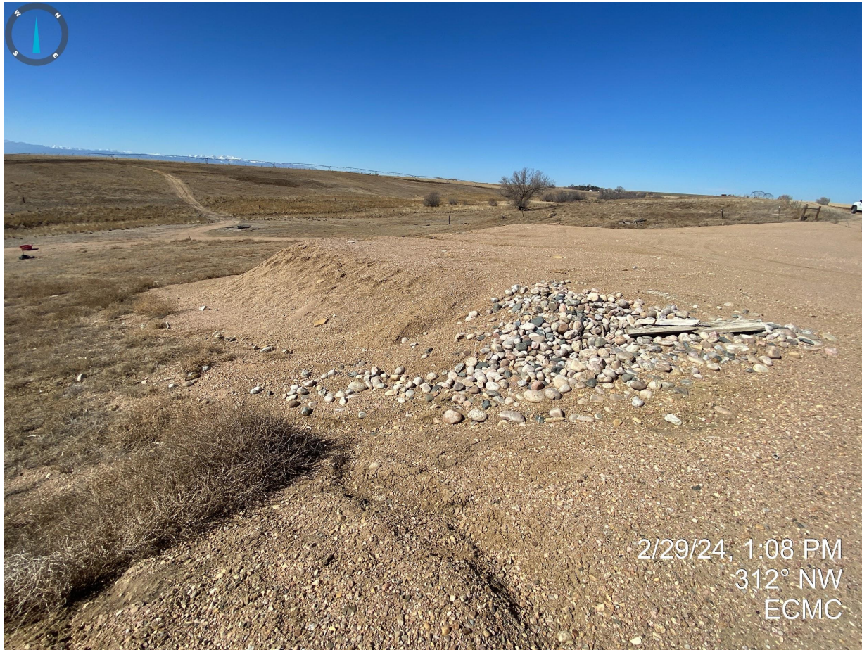
Photo 10. Erosion degradation occurring on the western portion of the location.