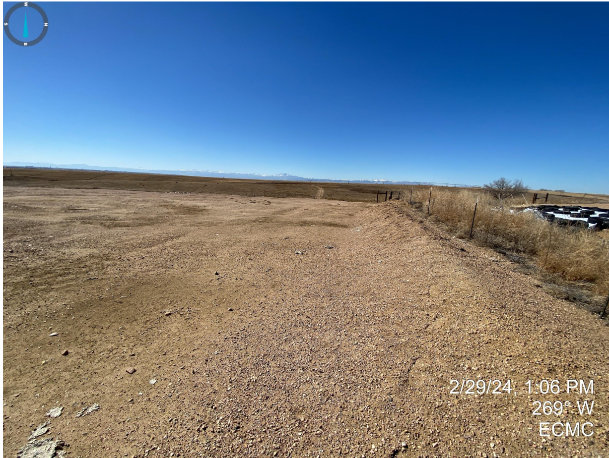
Photo 3. The former tank battery does not appear to have been reclaimed per Rule 1004.