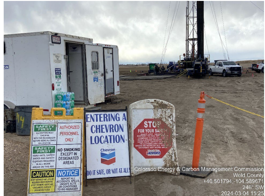
Colorado Energy & Carbon Management Commission Weld County +40.501794, -104.589671 246° SW 2024-03-04 15:25