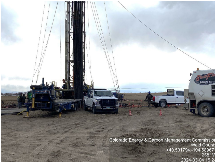
Colorado Energy & Carbon Management Commission Weld County +40.501794, -104.589671 258° W 2024-03-04 15:24