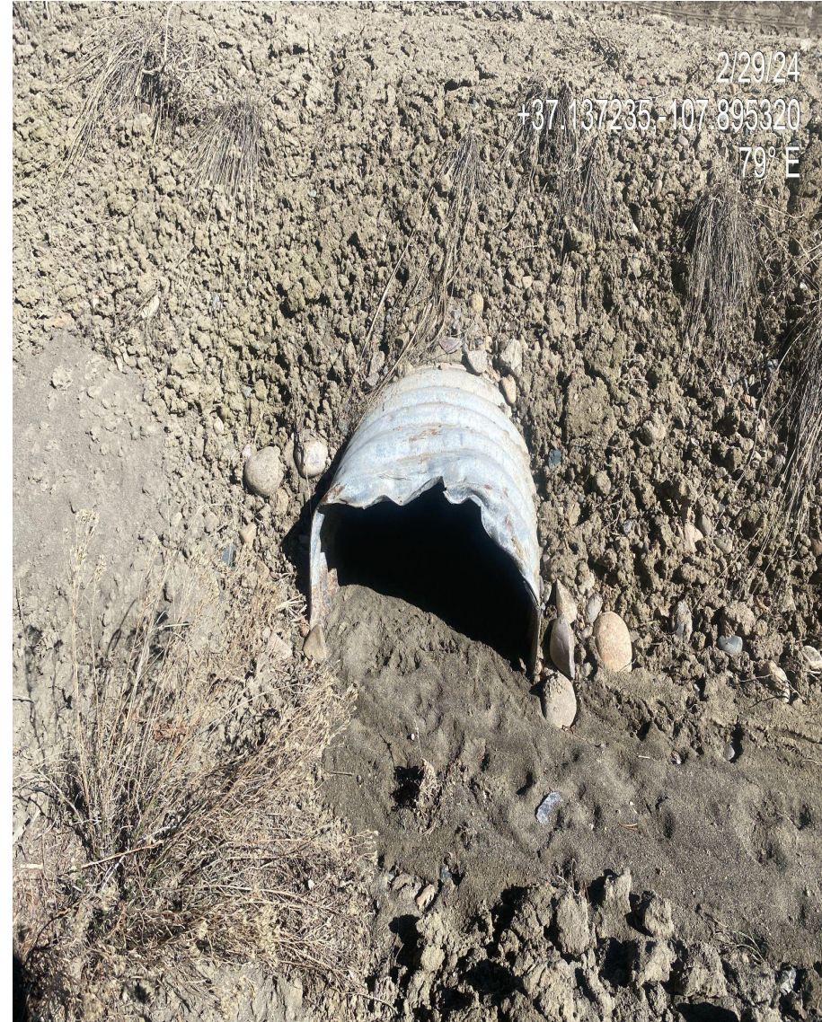
Photo 8. View of culvert that is full of sediment and has not been installed or maintained in accordance with good engineering practices and causing erosion moving east off of the access road.