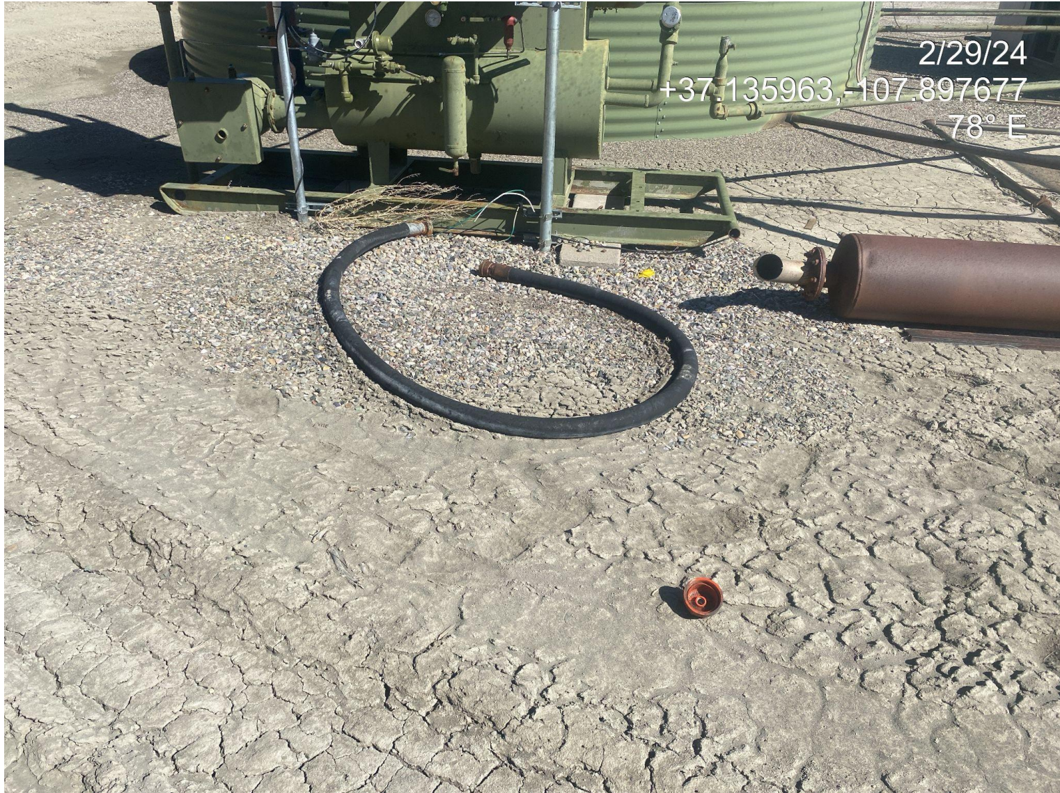
Photo 5. View of unused equipment observed on location.