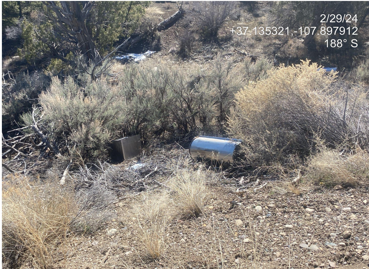
Photo 2. View of trash observed in the southern interim reclamation/fill slope area.