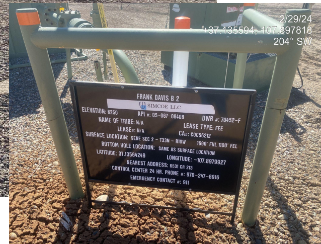
Photo 1. View of the disturbance facing center from the entrance.