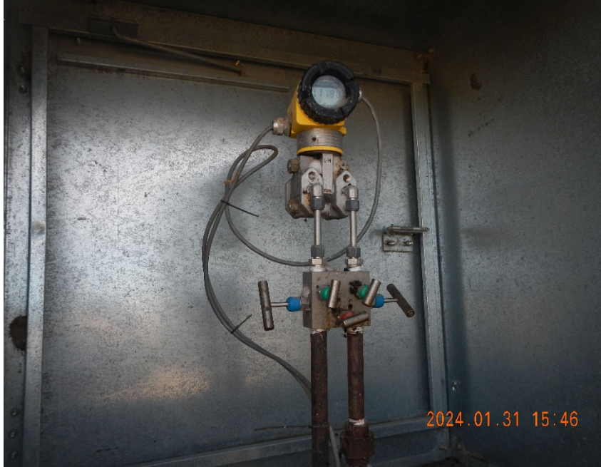
5. Digital gas meter inside meter box.