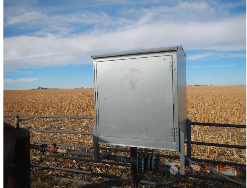
4. Flowline mounted gas meter box.