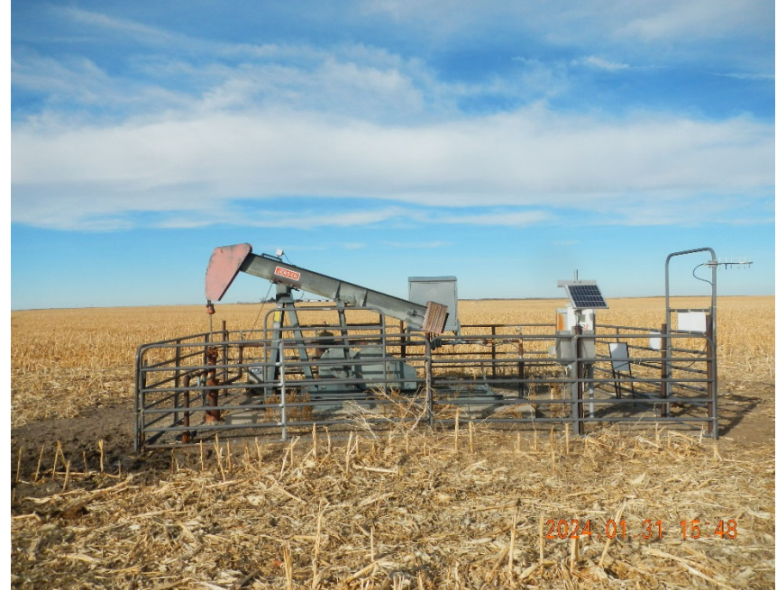
6. Location overview.