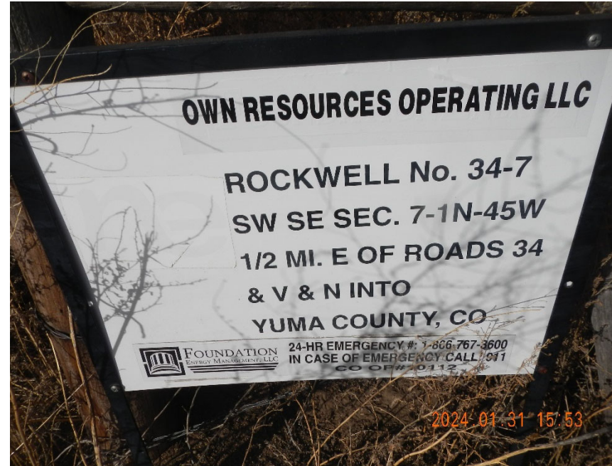
2. Well sign at CR and access road. Incorrect emergency contact number.