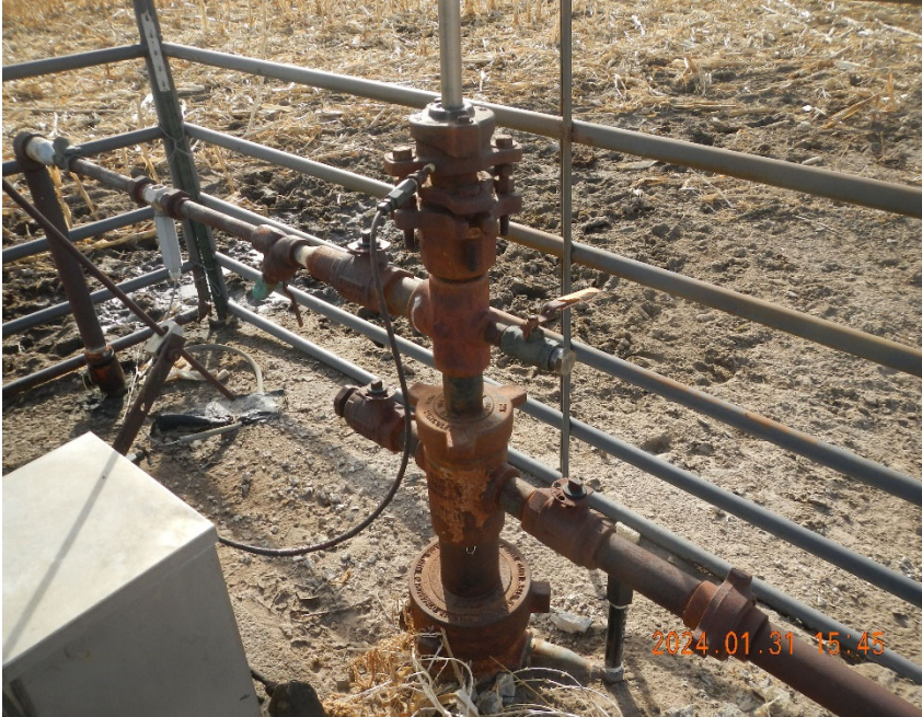
3. View of wellhead.