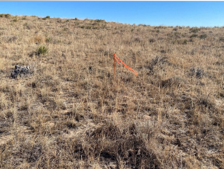
Prairie Ridge #1 • East View