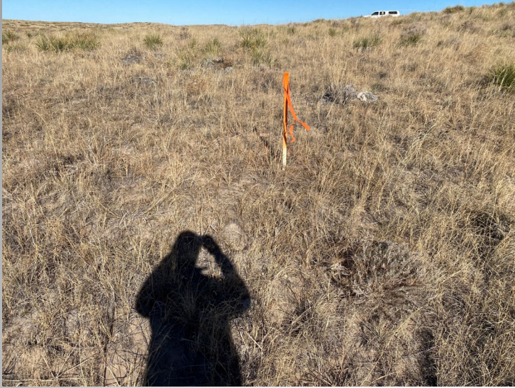
Prairie Ridge #1 • North View

SHL: NE-1/4 of SE-1/4 Section 13-T03S-R50W-6 th PM Washington County, Colorado