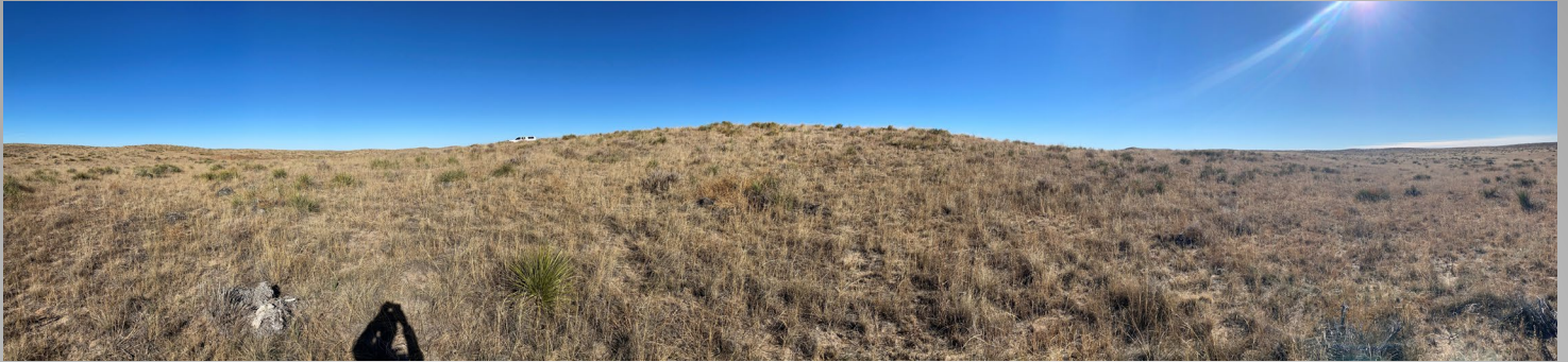
Prairie Ridge#1 • North-East-South

SHL: NE-1/4 of SE-1/4 Section 13-T03S-R50W-6 th PM Washington County, Colorado