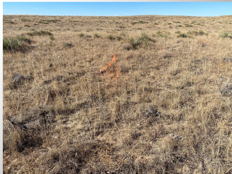
Prairie Ridge #1 • West View