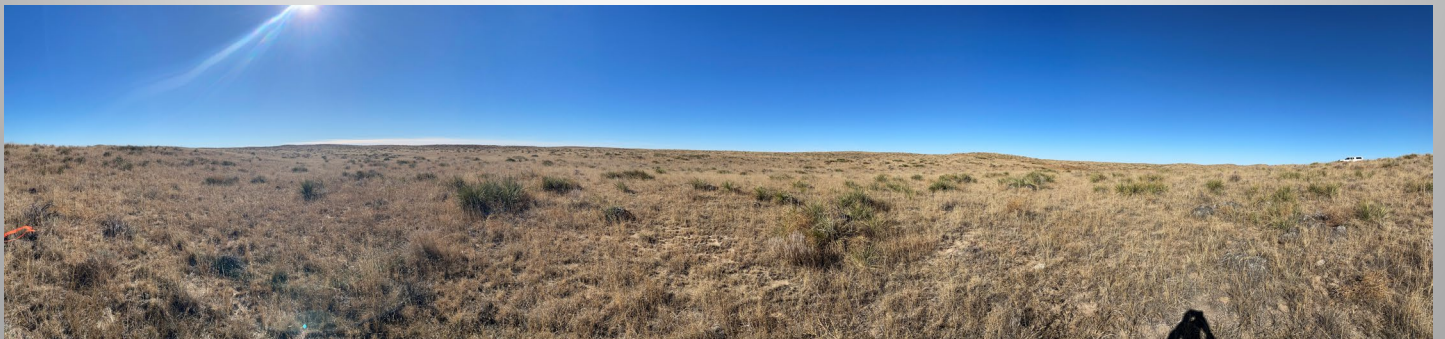
Prairie Ridge #1 • South-West-North