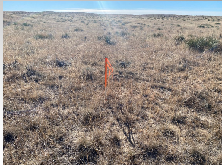
Prairie Ridge #1 • South View