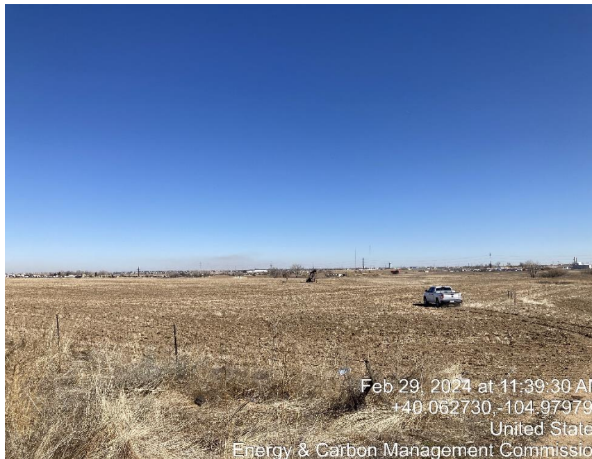
Photo 1 Entrance to location