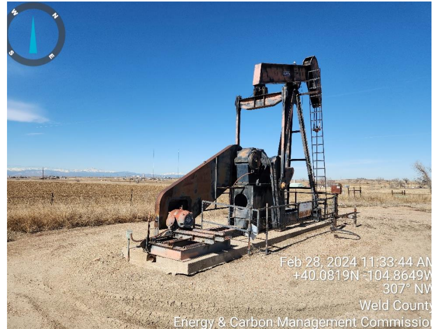
Photo 2 well head and equipment