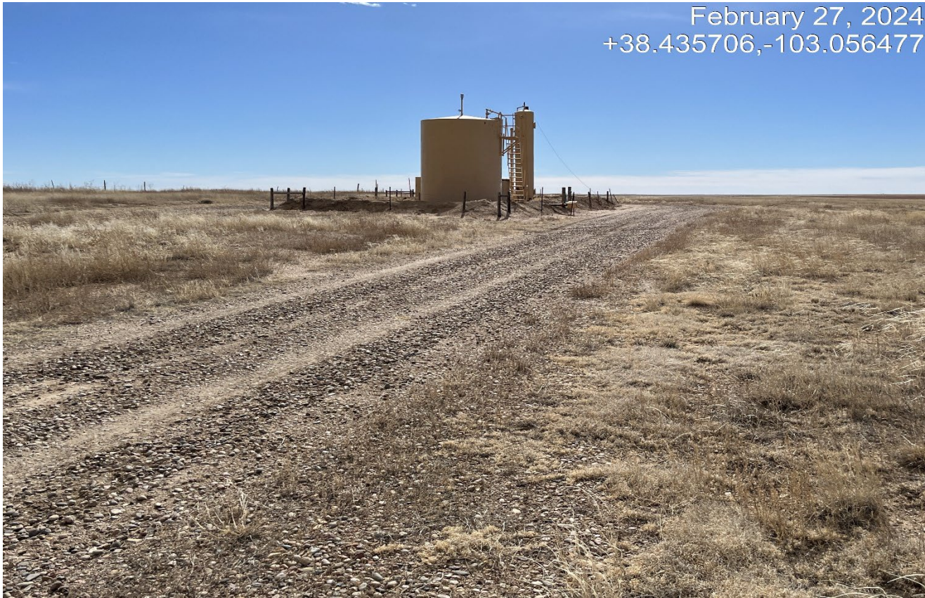
Photo 2. Facing east toward the tank battery.