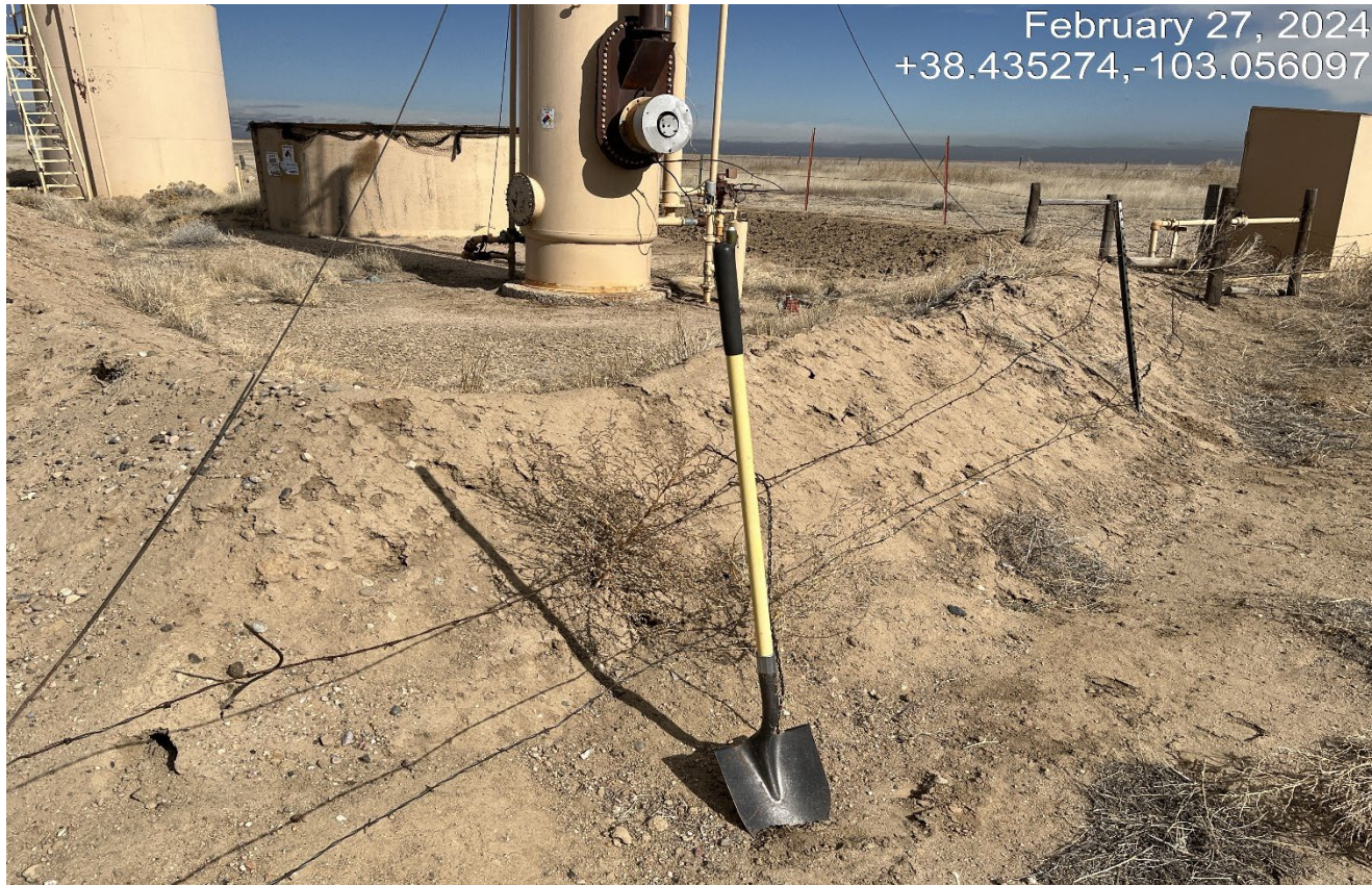
Photo 4. The 4 ft shovel shows loose wires are low only about 2 ft. which livestock can step over and into the fenced area.