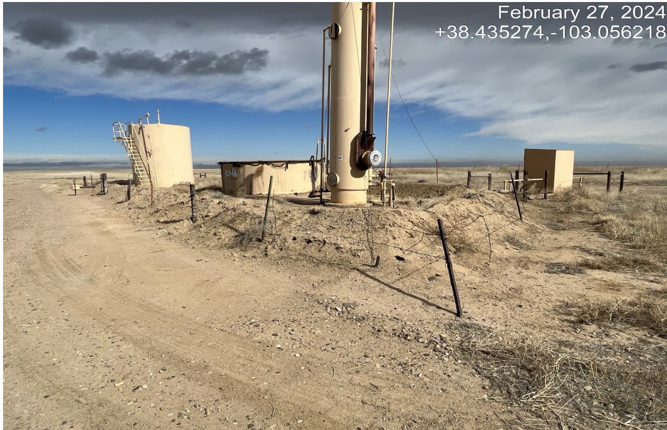
Photo 3. The fence around the tank battery is inadequate to prevent livestock entry and is not maintained. Previous corrective action was not completed.