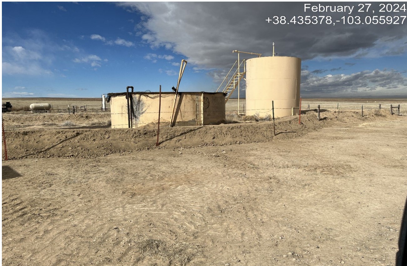
Photo 5. The berm at the open top tank has been rebuilt for containment.