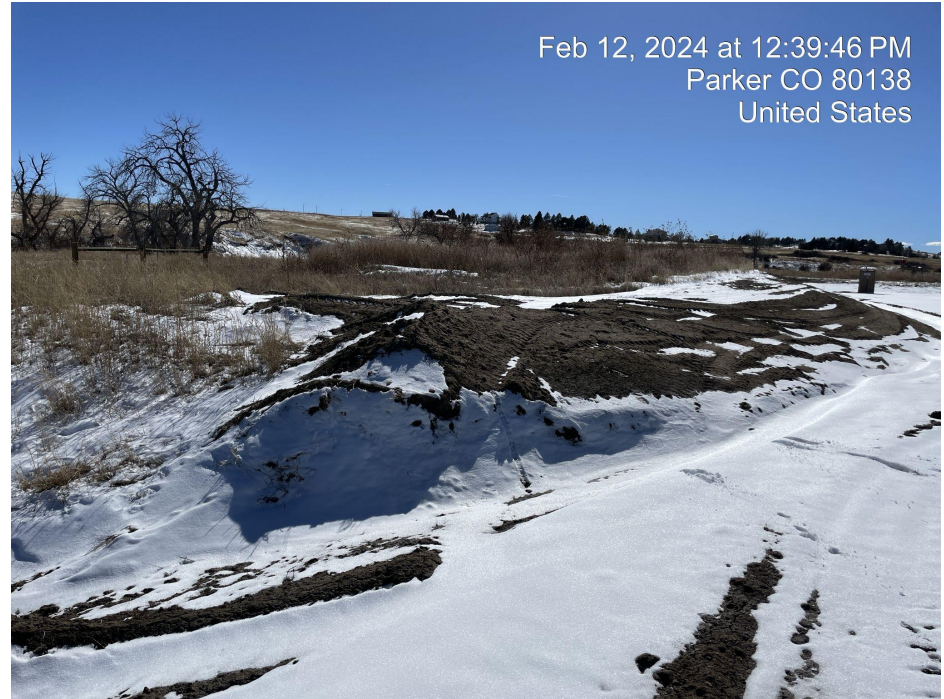
Photo 6. Photo taken of bare soil on topsoil stockpile in interim reclaimed area of well pad. Photo taken facing southeast.