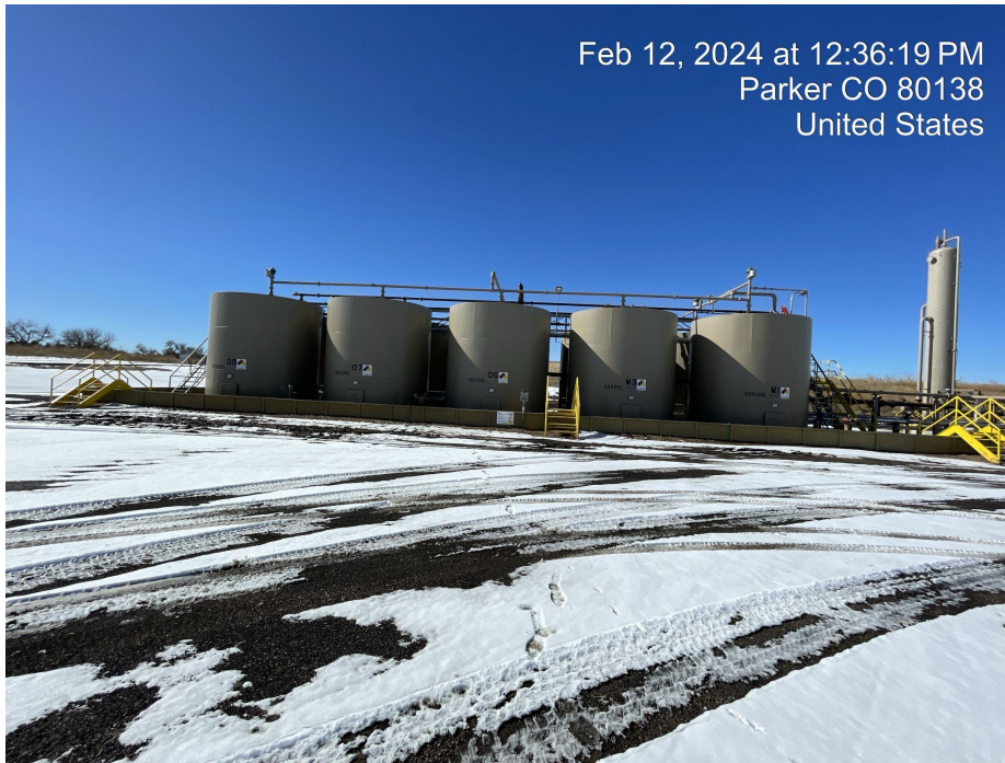
Photo 3. Photo taken of tank battery on site. Photo taken facing west.