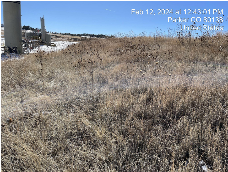
Photo 9. Photo of vegetation and weeds (kochia) on the west side of site. Photo tank facing south.