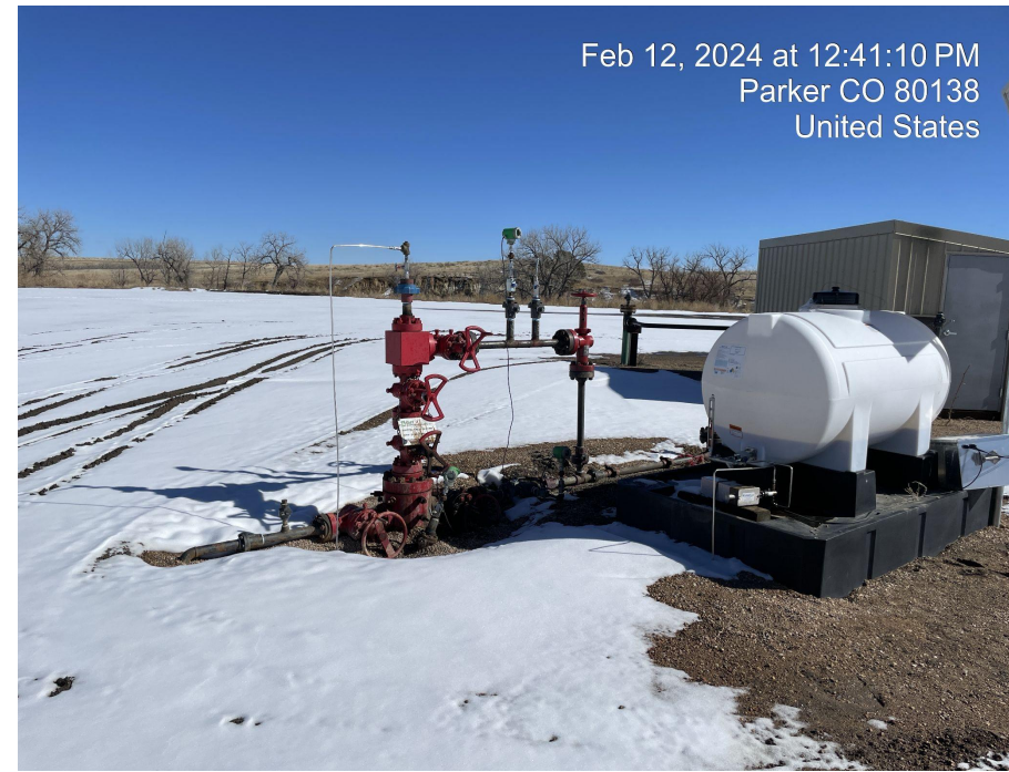
Photo 2. Photo taken of wellhead on site. Photo taken facing northeast.