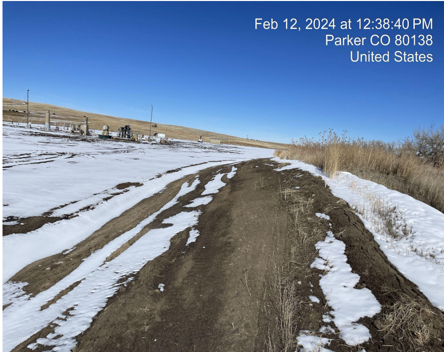
Photo 5. Photo taken of bare soil on topsoil stockpile in interim reclaimed area of well pad. Photo taken facing north.