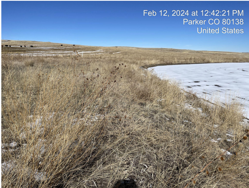
Photo 7. Photo of vegetation and weeds (kochia) on the west side of site. Photo tank facing north.