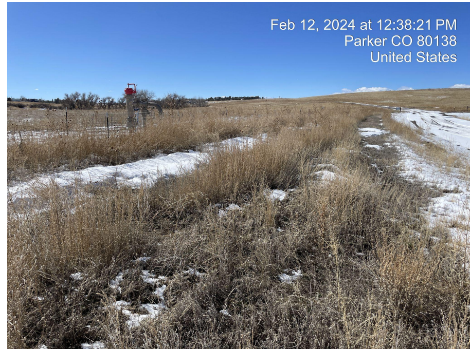
Photo 4. Photo taken of vegetation and weeds (kochia) in topsoil stockpile in interim reclaimed area of well pad. Photo taken facing south.