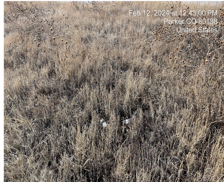
Photo 8. Photo of weeds (russian thistle & kochia) on the west side of pad. Photo taken facing south.