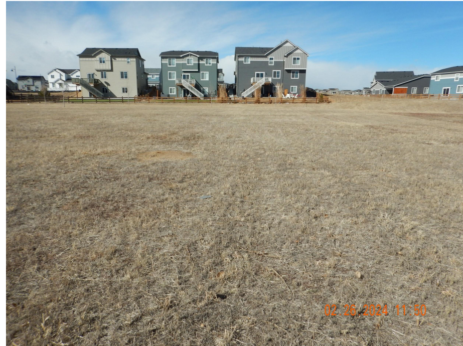
Photo 5. Photo taken from the well location, facing West. See comments under Photo 2.