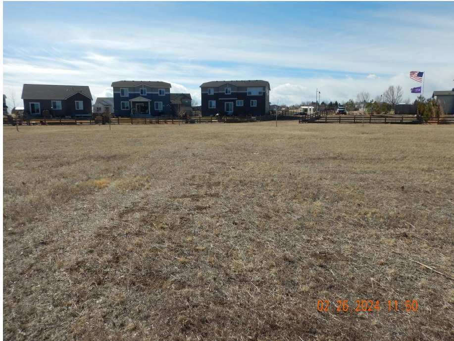
Photo 4. Photo taken from the well location, facing South. See comments under Photo 2.