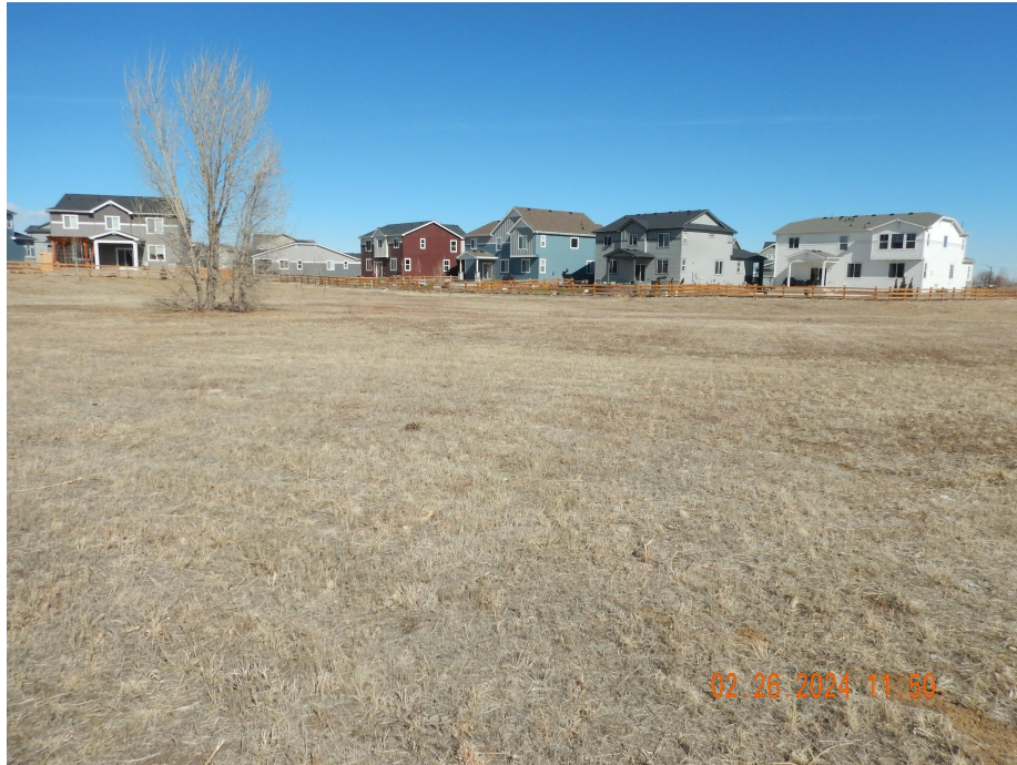
Photo 2. Photo taken from the well location, facing North. Photo illustrates location is within a land use change to housing development. All equipment has been removed. There were no weed or stormwater issues observed.