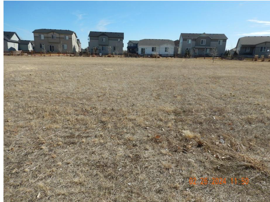
Photo 3. Photo taken from the well location, facing East. See comments under Photo 2.