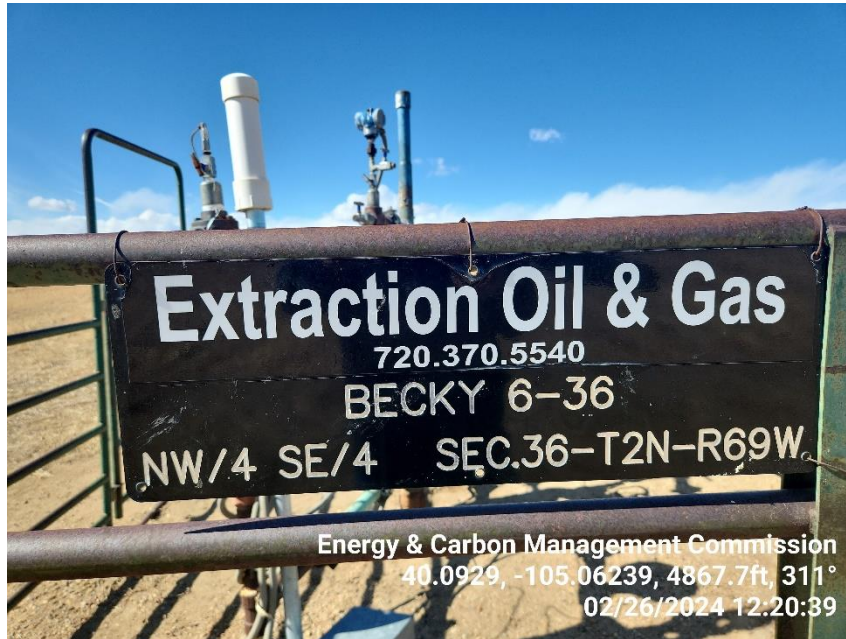
Photo 3 WH sign.