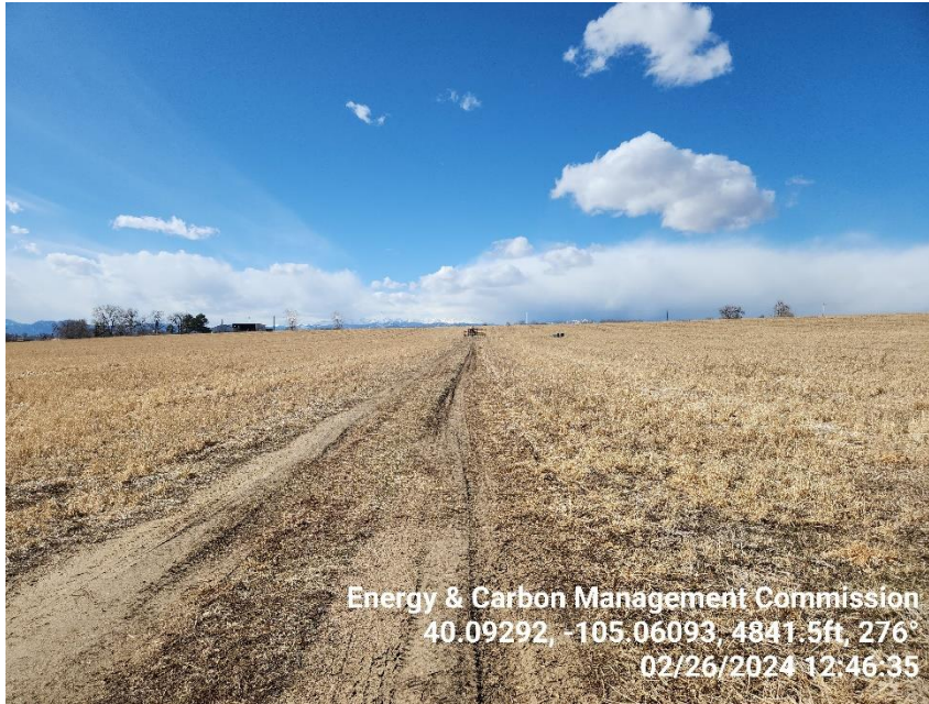
Photo 1 Access road to location.