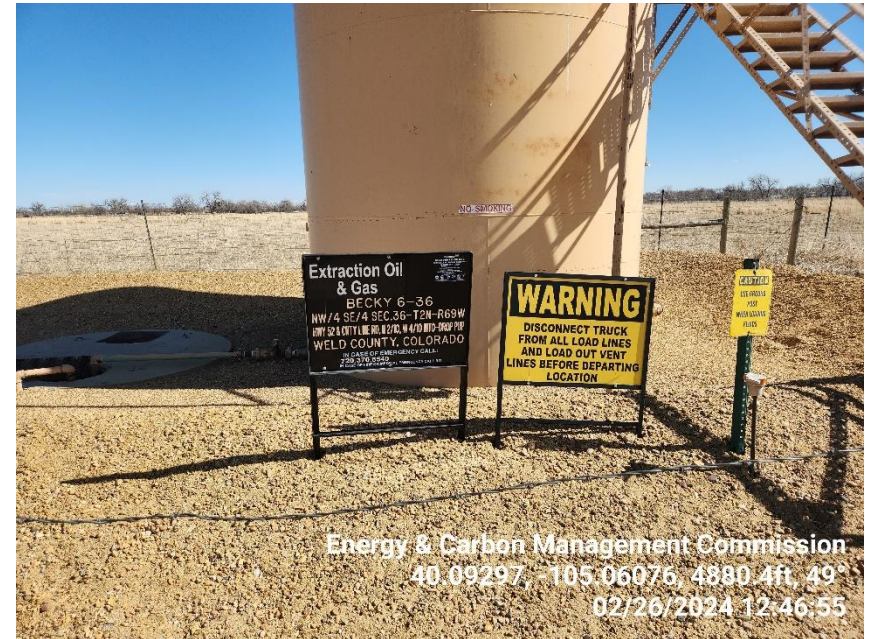
Photo 6 TB signs.