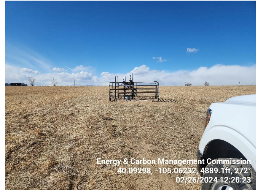
Photo 2 Well site.