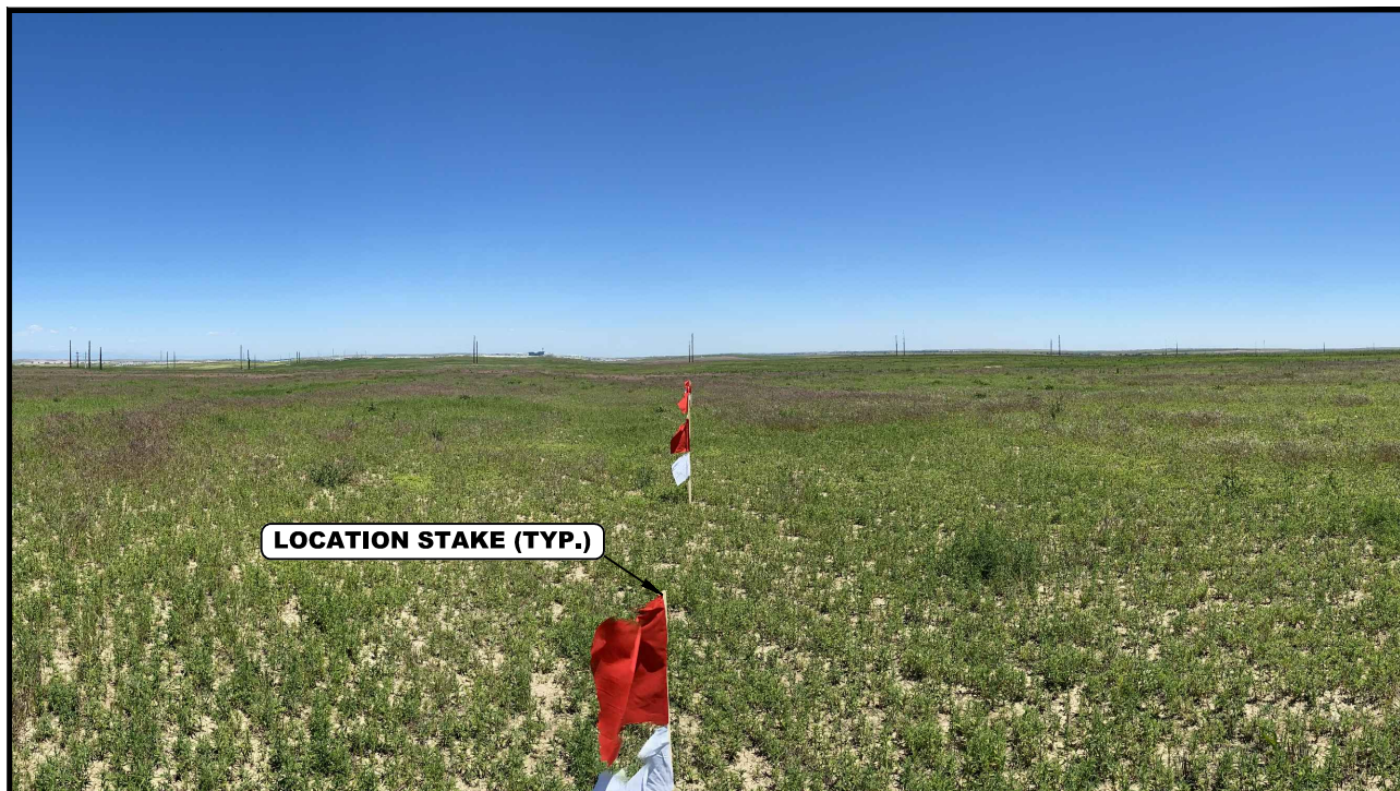
PHOTO: VIEW OF LOCATION STAKES