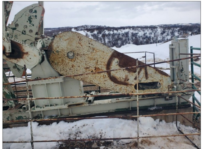
2/21/2024: Best guard back on PU.

2/21/2024: Screen placed over open containment.