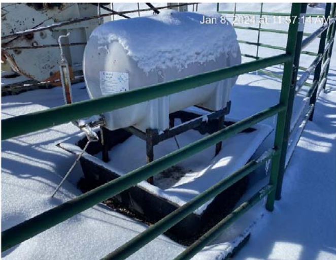
Containment open to wildlife.

Chemical tank inside containment; containment open to wildlife. Needs screens.