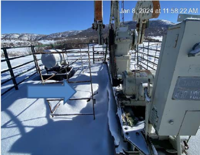
Belt guard on the ground