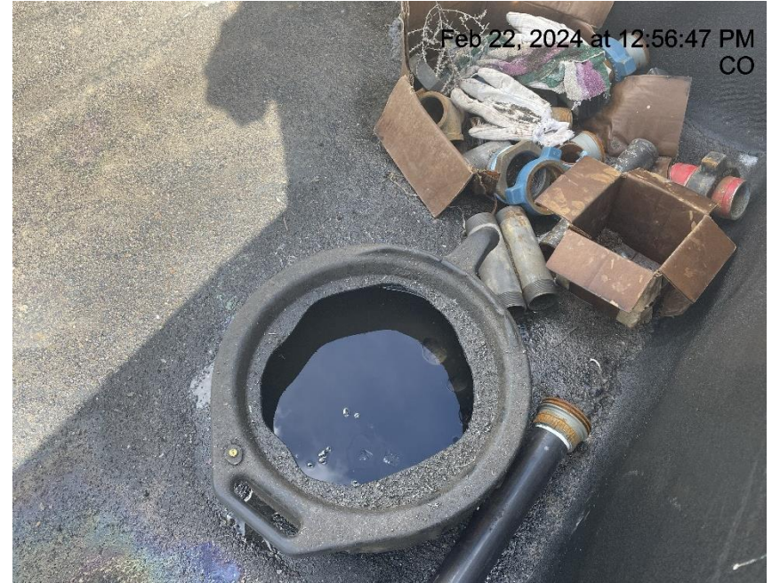
Photo # 7462 Stored supplies & Open container full of unknown fluid/wildlife hazard