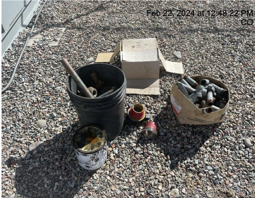
Photo # 7461 Stored supplies & improperly stored container of unknown chemical