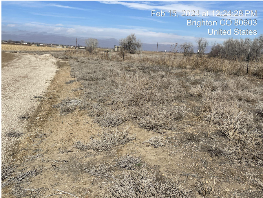
Photo 7. Photo taken of weeds (kochia & russian thistle) on east side of location. Photo taken facing northeast