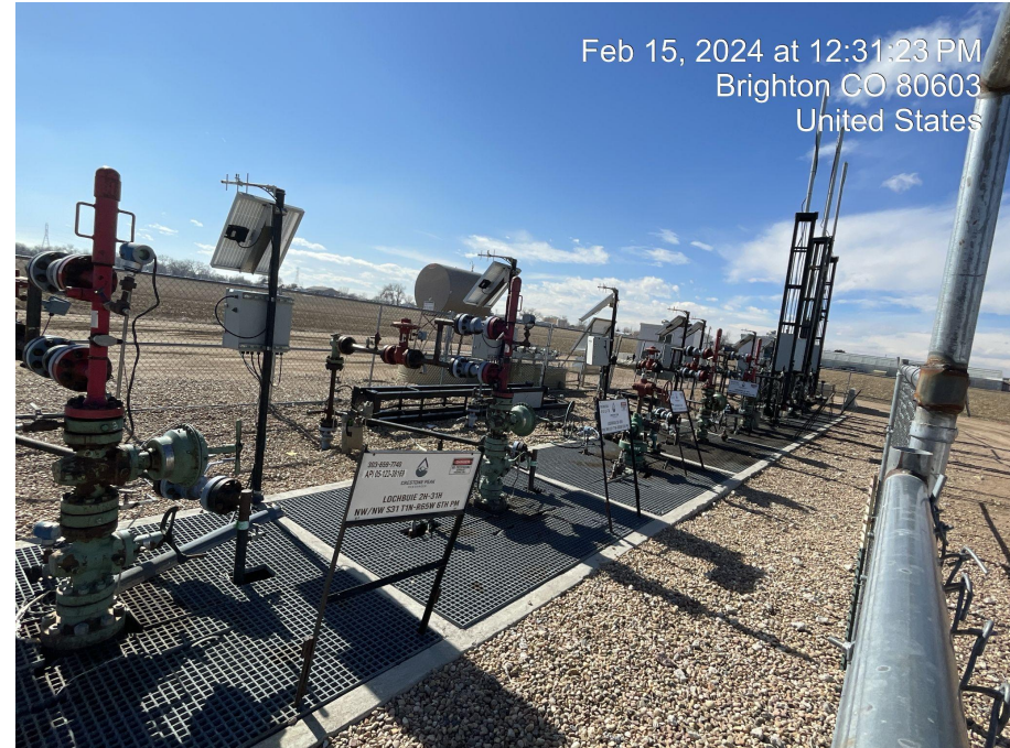
Photo 2. Photo taken of wells on site. Photo taken facing north east.