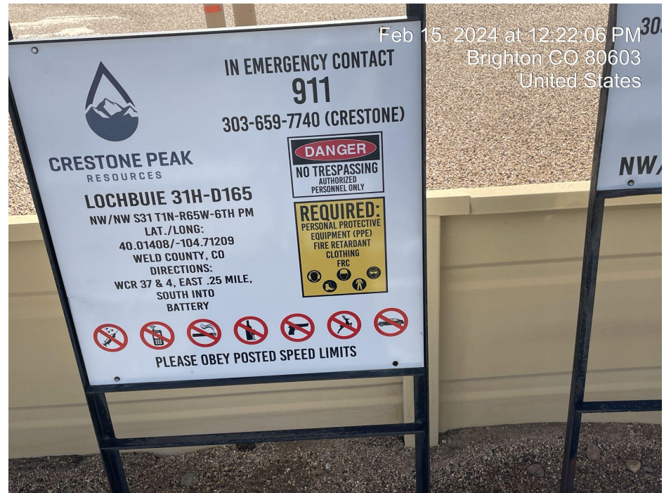
Photo 6. Photo taken of Tank battery location sign.