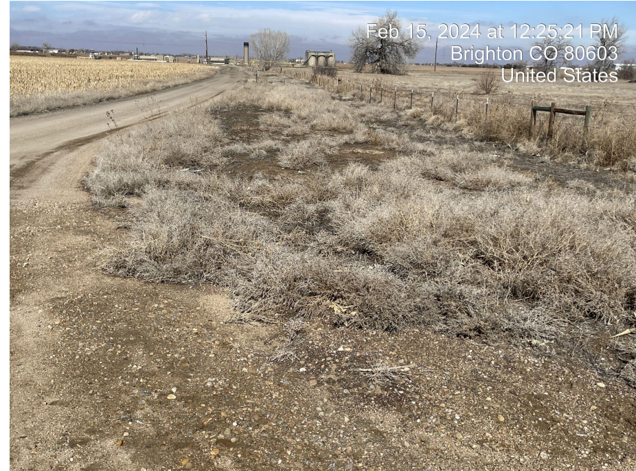
Photo 8. Photo taken of weeds (kochia & russian thistle) on east side of location at entrance of location. Photo taken facing north