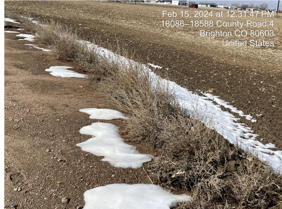
Photo 4. Photo taken of weeds (kochia) on perimeter of well pad. Photo taken facing northwest.