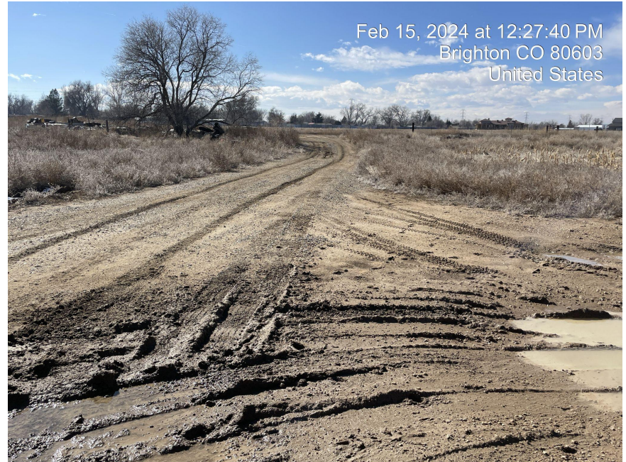
Photo 10. Photo taken of weeds (kochia & russian thistle) on southwest side of location. Photo taken facing southwest.