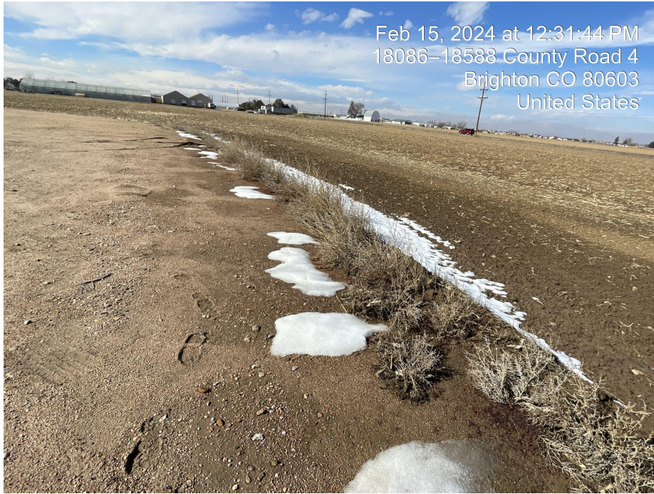
Photo 3. Photo taken of weeds (kochia) on perimeter of well pad. Photo taken facing northwest.