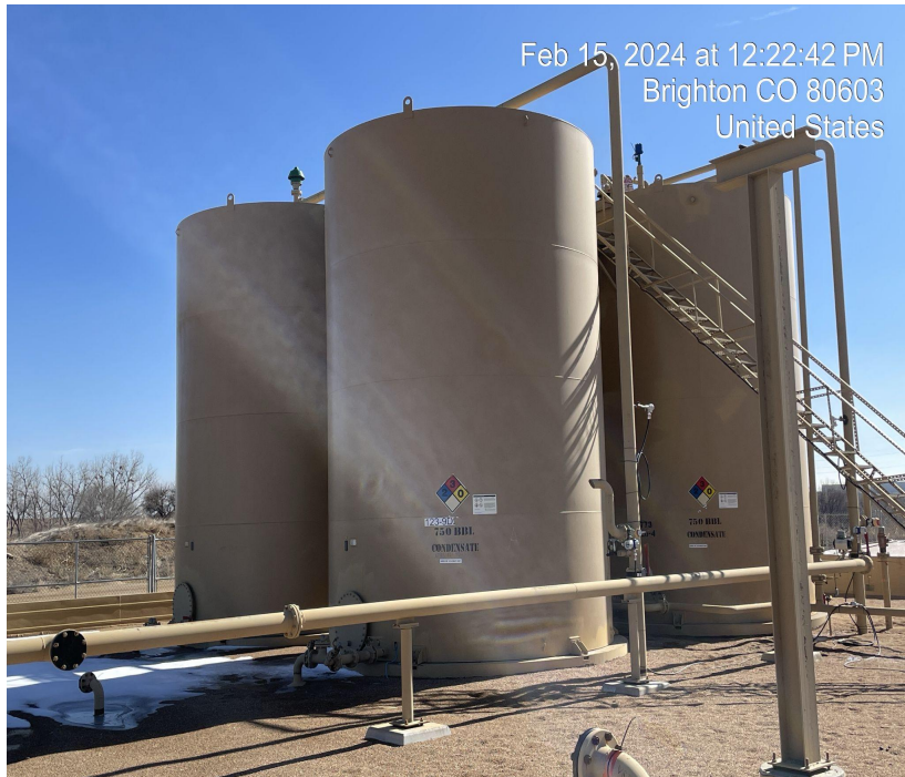
Photo 5. Photo taken of tank battery off pad. Photo taken facing east.