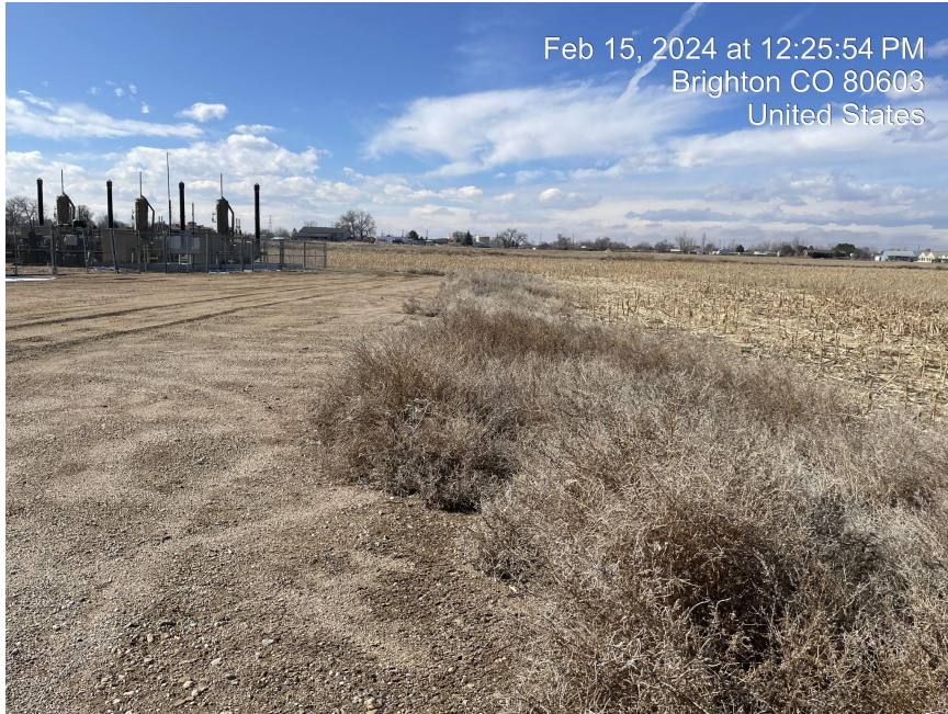
Photo 9. Photo taken of weeds (kochia & russian thistle) on north side of location. Photo taken facing west.