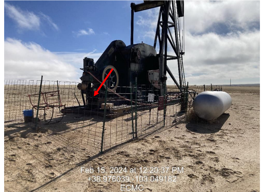
Photo 7 – Areas of impacted soils at the wellhead, 5 Gallon buckets stored on location