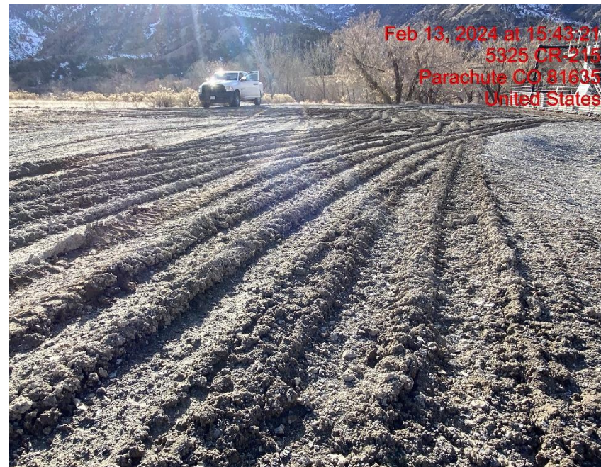
Lack of Stabilization – Photo #09268