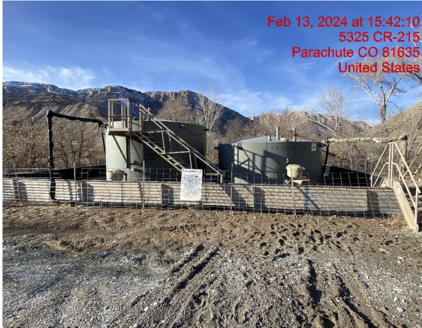
Tank Battery – Photo #09264