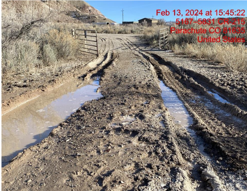
Lack of Stabilization on Lease Road – Photo #09269