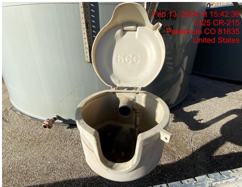
Open-Ended Load Line – Photo #09266