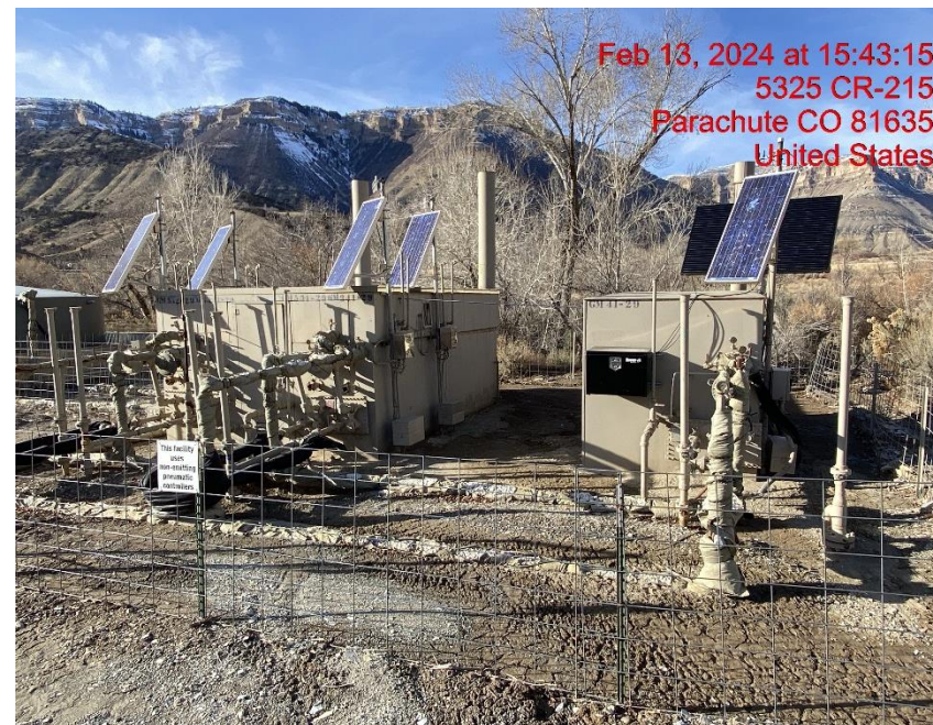
Separators – Photo #09267