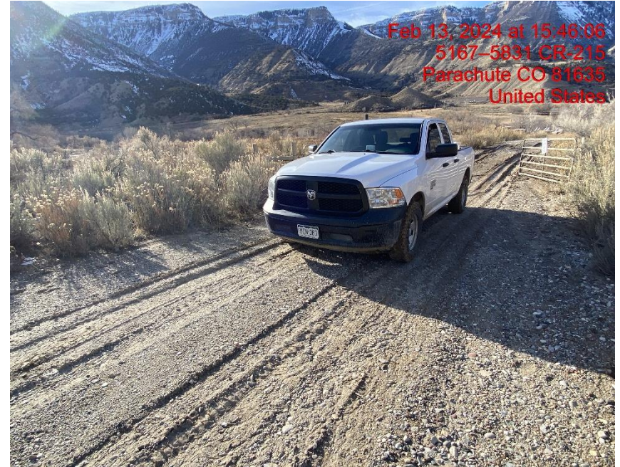
Insufficient Vehicle Tracking BMPs at Location Entrance/Exit – Photo #09270