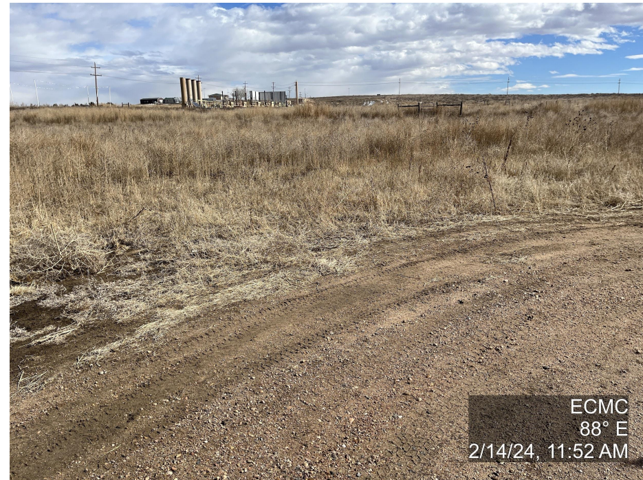
Photo 1. The photo was taken at the well location facing Northeast. The photo illustrates the producing wells and some area of interim.

Photo 2. The photo was taken at the well location facing East. The photo illustrates the interim areas are being managed by evidence of mowing activities.