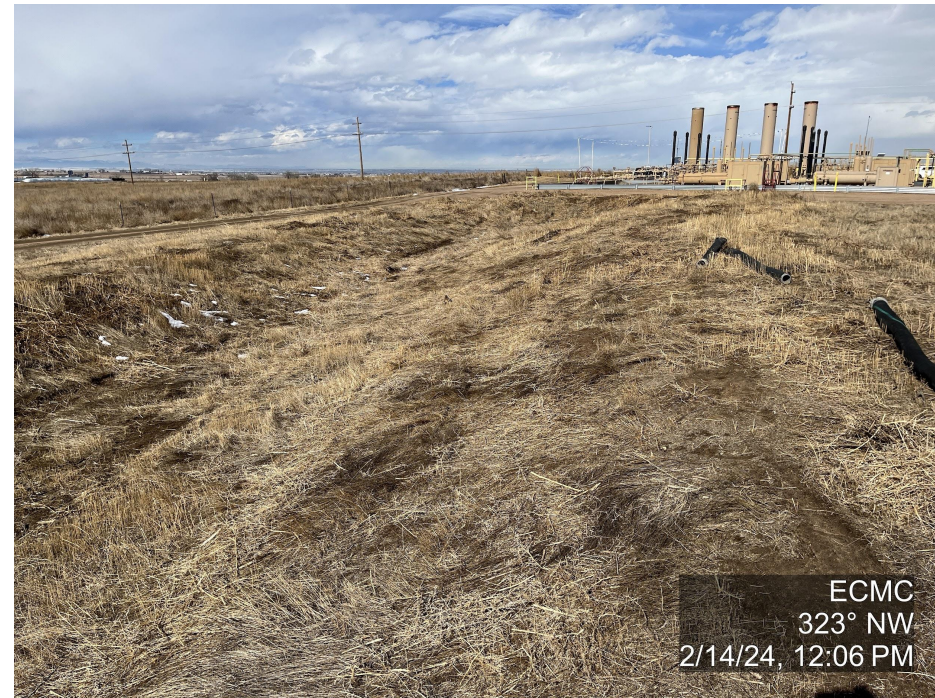
Photo 10. The photo was taken at the tank battery facility facing Northwest. The photo illustrates the sediment trap at the Southwest end of the facility.