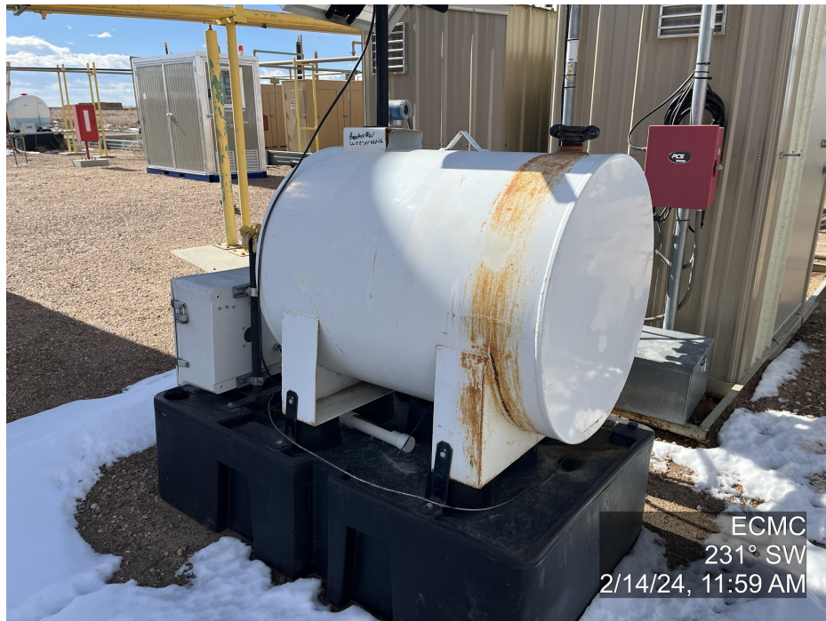
Photo 5. The photo was taken at the tank battery facility facing Southwest. The photo illustrates the small tank does not have proper tank labels. The photo is representative of 4 other tanks that are missing labels or the labels have faded and are illegible.