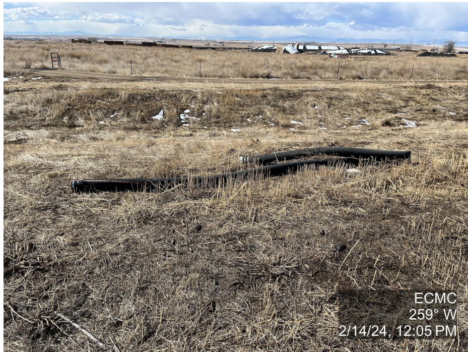
Photo 9. The photo was taken at the tank battery facility facing West. The photo illustrates discharge hose being stored within the interim.