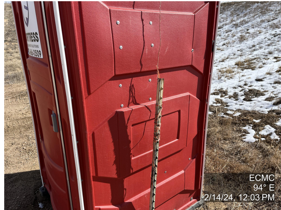
Photo 8. The photo was taken at the tank battery facility facing East. The photo illustrates the portable toilet has been secured by bailing twine which may be inadequate.