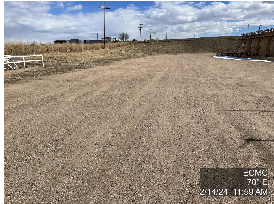
Photo 4. The photo was taken at the tank battery facility facing East. The photo illustrates the North side of the production facility.