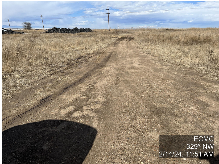
Photo 3. The photo was taken at the well location facing Northwest. The photo illustrates the access road has no current stormwater issues.