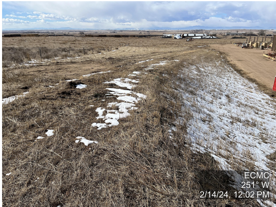
Photo 7. The photo was taken at the tank battery facility facing West. Refer to the comment for photo 6.