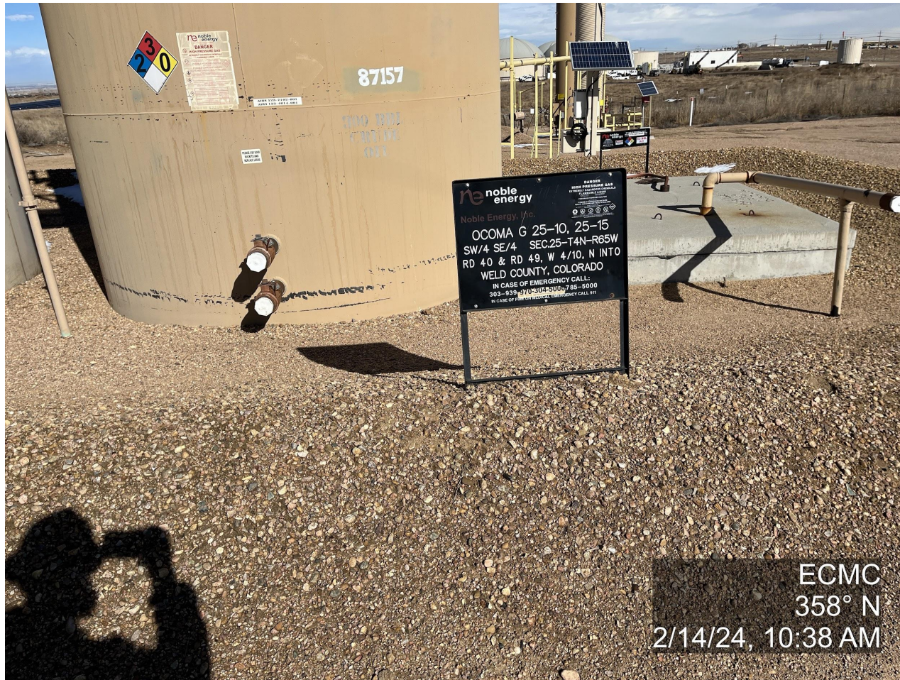
Photo 1. The photo was taken at the tank battery location facing North. The photo illustrates the operator sign.