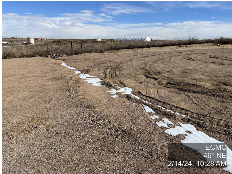
Photo 2. The photo was taken at the tank battery location facing Northeast. The photo illustrates the a diversion ditch running West to East along the center of the location.