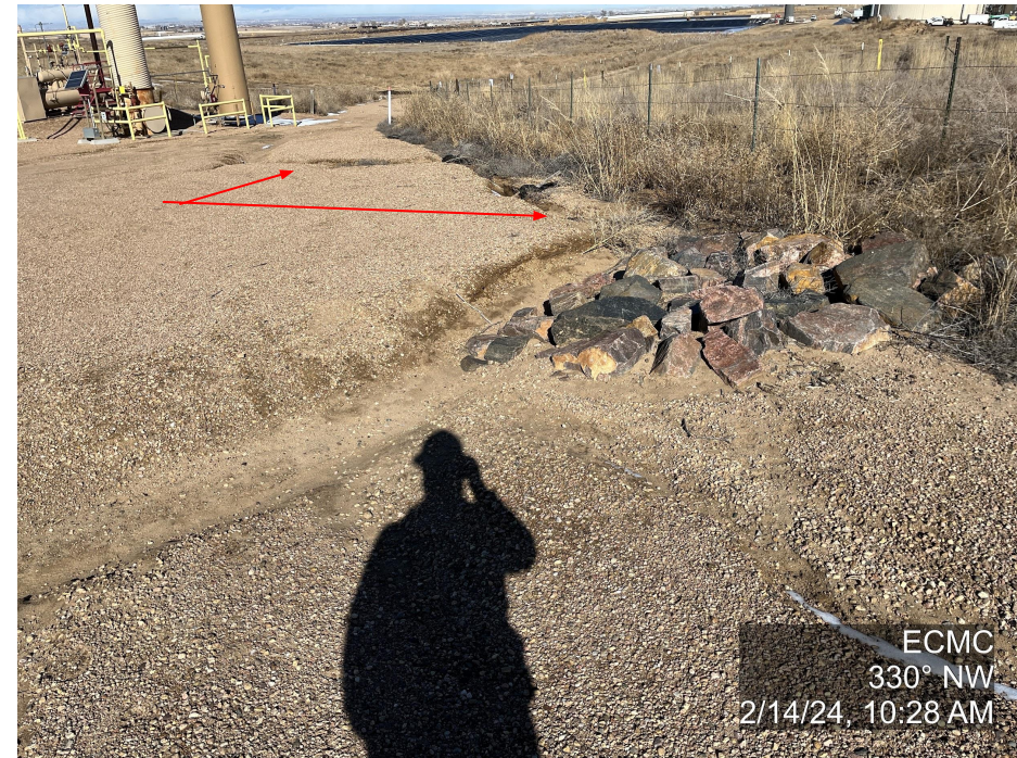
Photo 3. The photo was taken from the tank battery location facing Northwest. The photo illustrates where the ditch runs to a section of rip rap and shows erosion around the outer edge as well as rilling erosion running down the pad to the North.