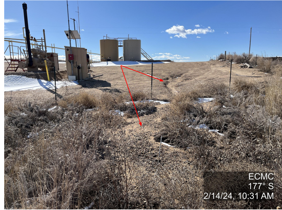
Photo 4. The photo was taken from the tank battery location facing West. The photo illustrates the continued erosion along the pad.