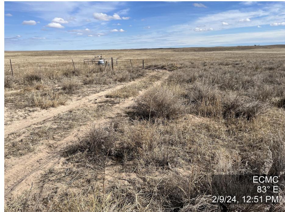
Photo 6. The photo was taken from the well location facing East. Refer to the comment for photo 5.