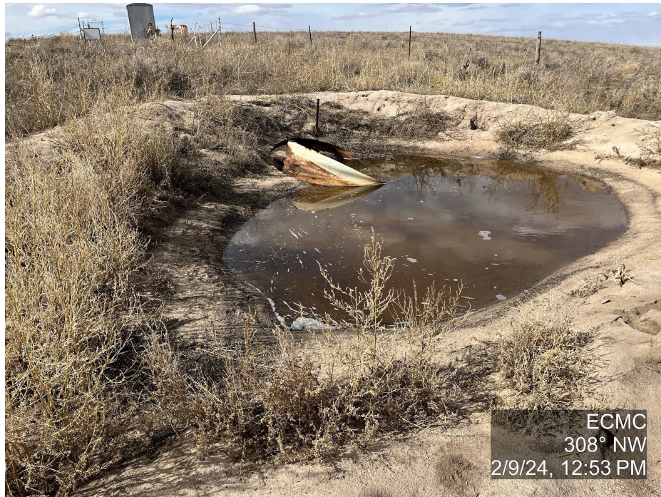
Photo 3. The photo was taken from the well location facing Northwest. The photo illustrates the active skim pit on location with the damaged tinhorn.