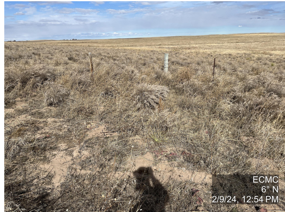
Photo 8. The photo was taken from the well location facing North. The photo illustrates the interim areas are adequately vegetated.