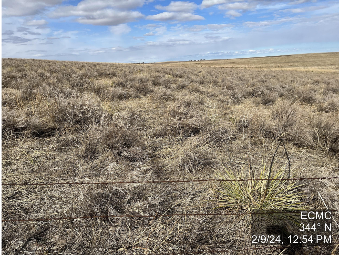
Photo 11. The reference photo was taken from the North side of the well location facing North. The photo illustrates reference areas contain Sandhill sagebrush, Yucca, Sand dropseed, among other vegetation.