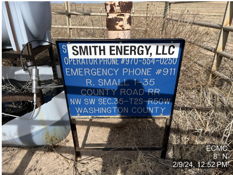
Photo 1. The photo was taken from the well location facing North. The photo illustrates the operator sign with covered emergency contact information.