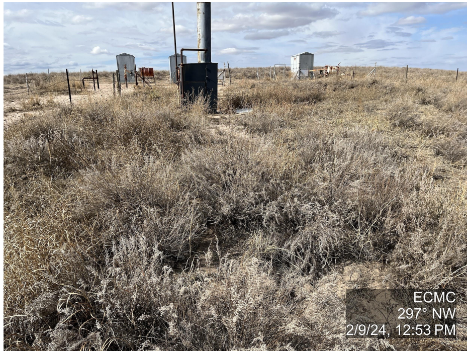
Photo 7. The photo was taken from the well location facing Northwest. The photo illustrates oil and gas equipment; meter sheds and what appears to be midstream equipment.