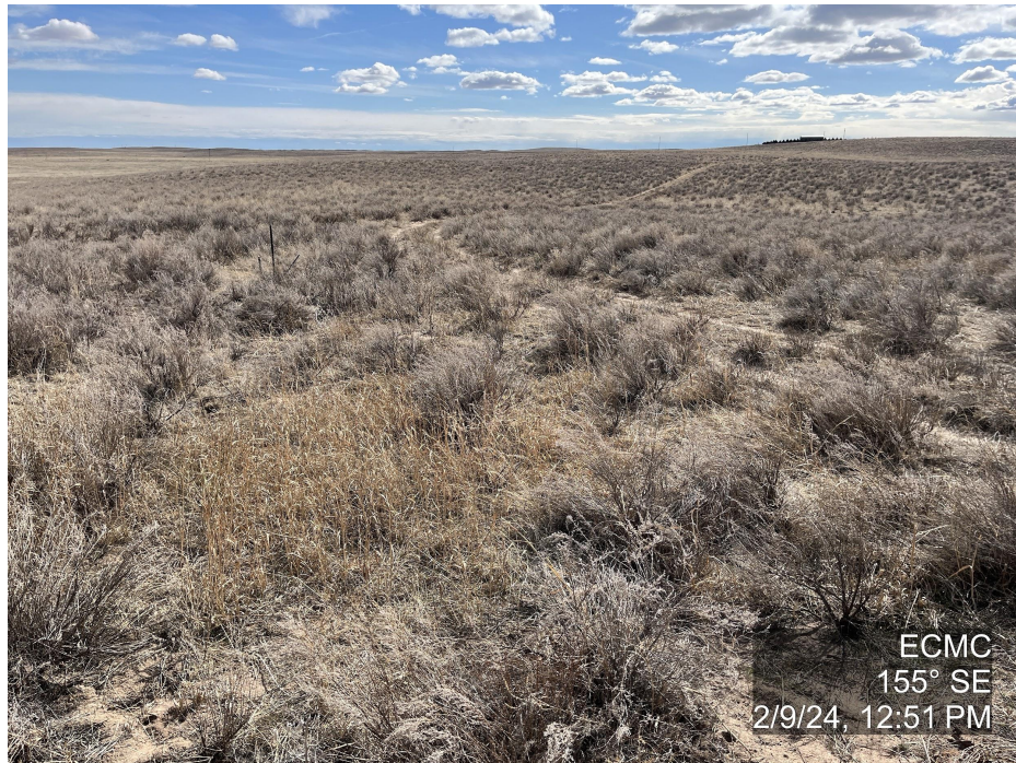
Photo 5. The photo was taken from the well location facing Southeast. The photo illustrates the access road.