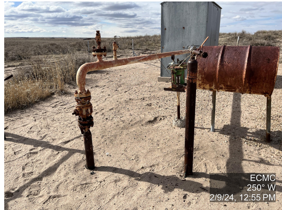
Photo 10. The photo was taken from the well location facing West. Refer to the comment for photo 9.