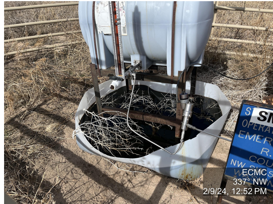
Photo 2. The photo was taken from the well location facing Northwest. The photo illustrates the tank placard is faded and illegible and the secondary containment is full and unprotected without wildlife netting.