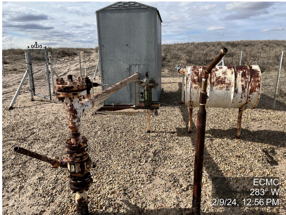
Photo 9. The photo was taken from the well location facing West. The photo illustrates midstream equipment on the well location.